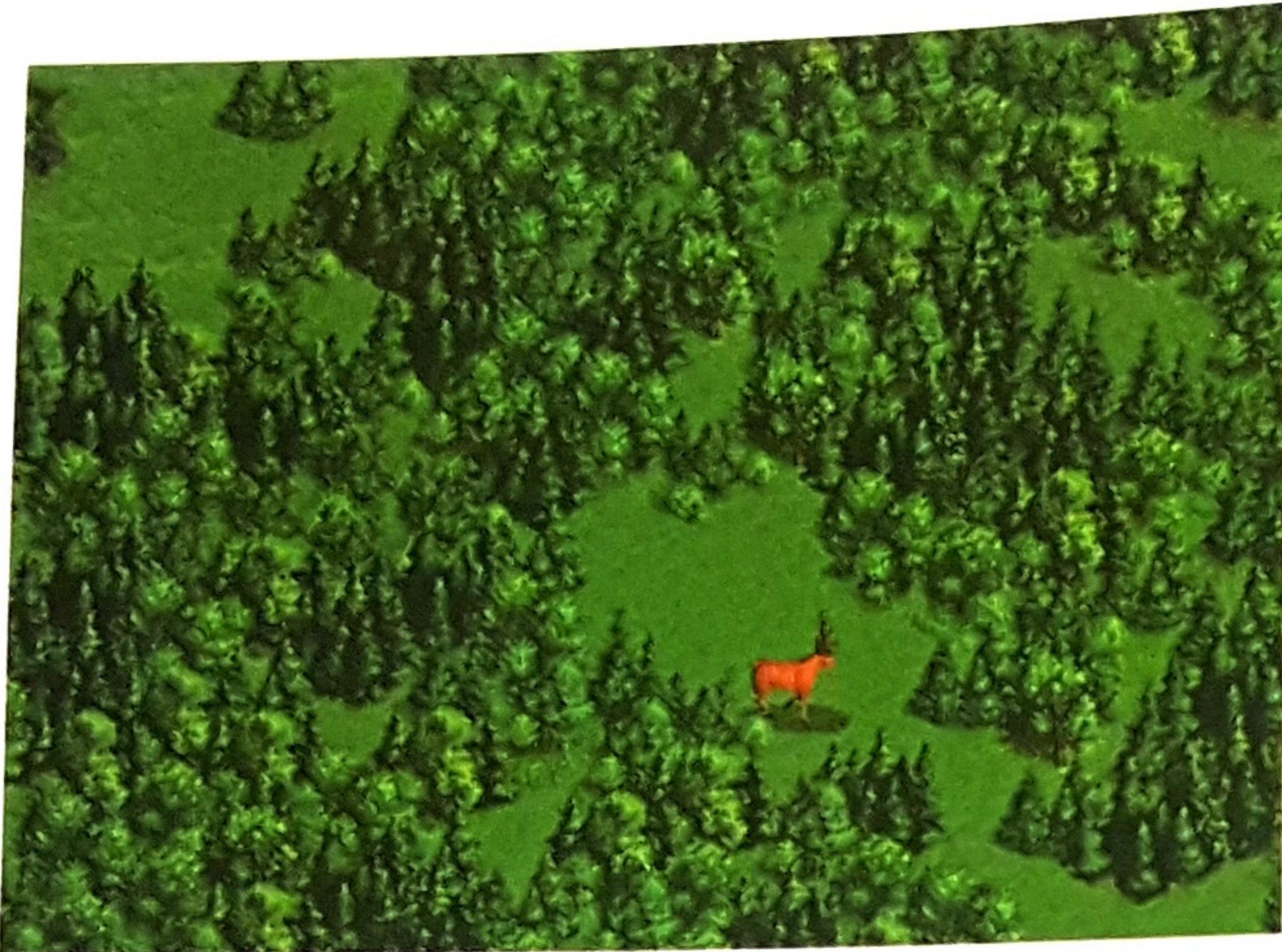
Above: Harun Farocki, Parallel I , 2012, two-channel HD video, color, sound, 16 minutes. Right: Harun Farocki, Parallel IV , 2014, HD video, color, sound, 11 minutes.