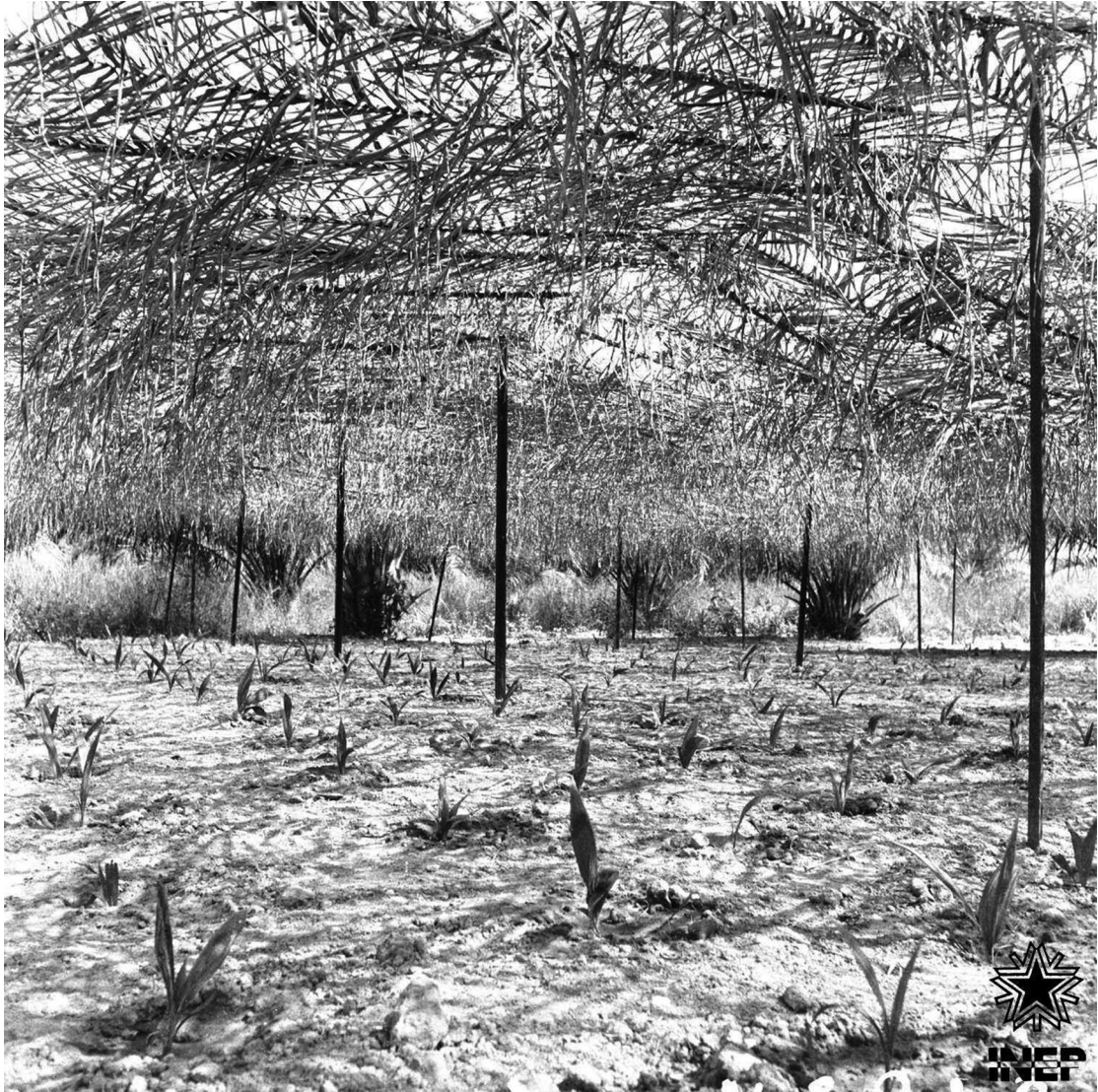
Experimental Farm of Pessubé, Guinea Bissau, photographer unknown, undated, source: CasaComum.org