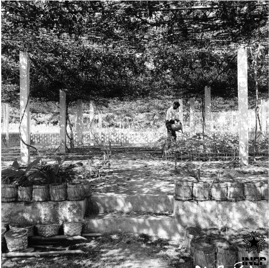
Experimental Farm of Pessubé, Guinea Bissau, undated