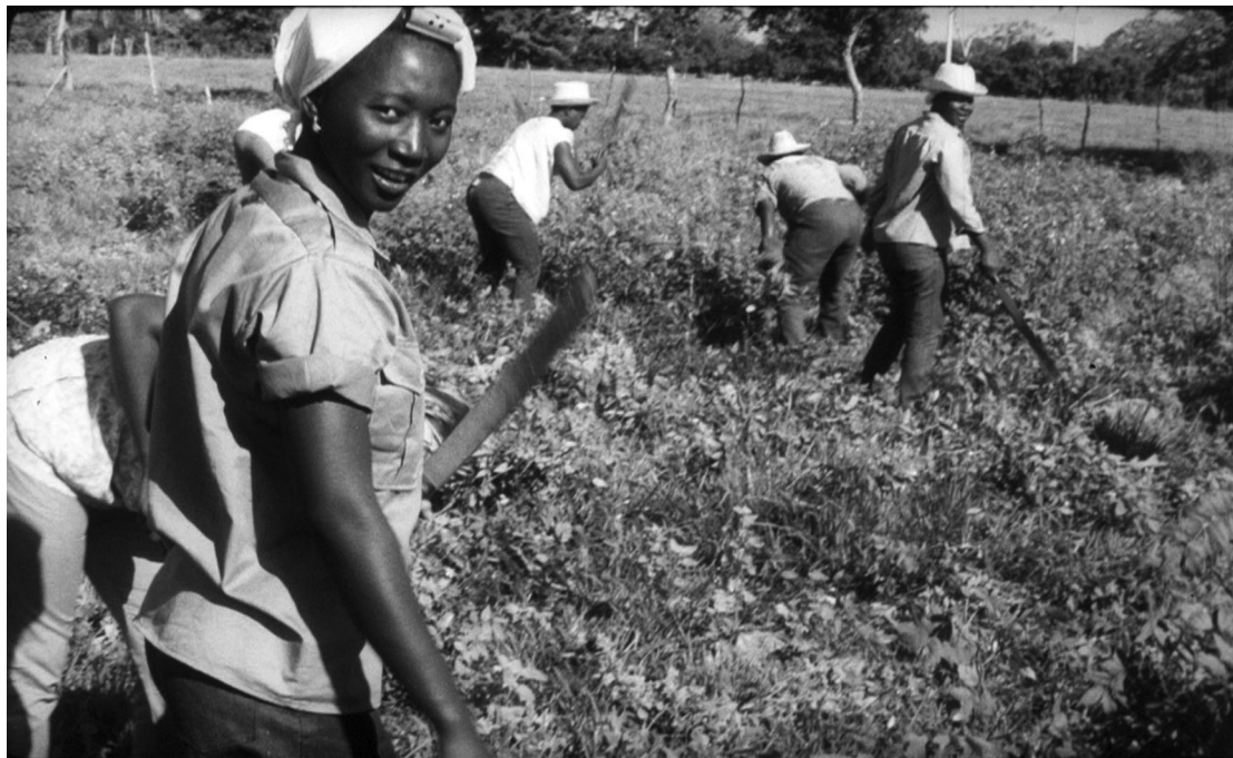
Voluntary work by Guinean students and camera exercise in Cuba, Dervis Espinosa, Cuba, INCA, 1967

Creole is a language derived from an appropriation of Portuguese vocabulary and the assimilation of oral and ethnic languages (especially from Mandinga syntax), and it was the language Cabral used to communicate with different ethnic groups in the course of the eleven-year-