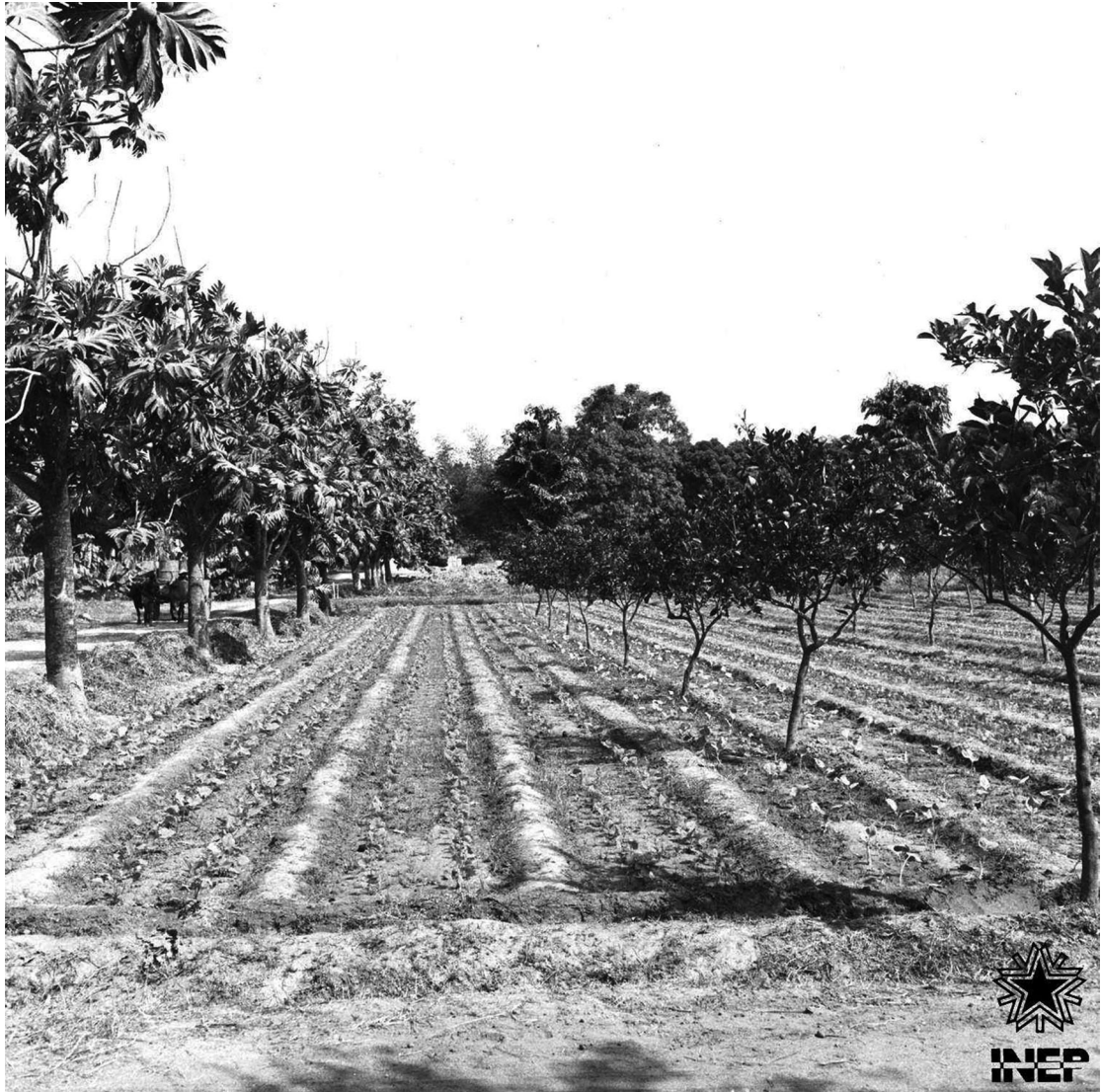
Experimental Farm of Pessubé, Guinea Bissau, photographer unknown, undated, source: CasaComum.org

later deliver his important speech 'The Weapon of Theory' at the First Tricontinental Conference of the Peoples of Asia, Africa and Latin America held in Havana in January 1966.