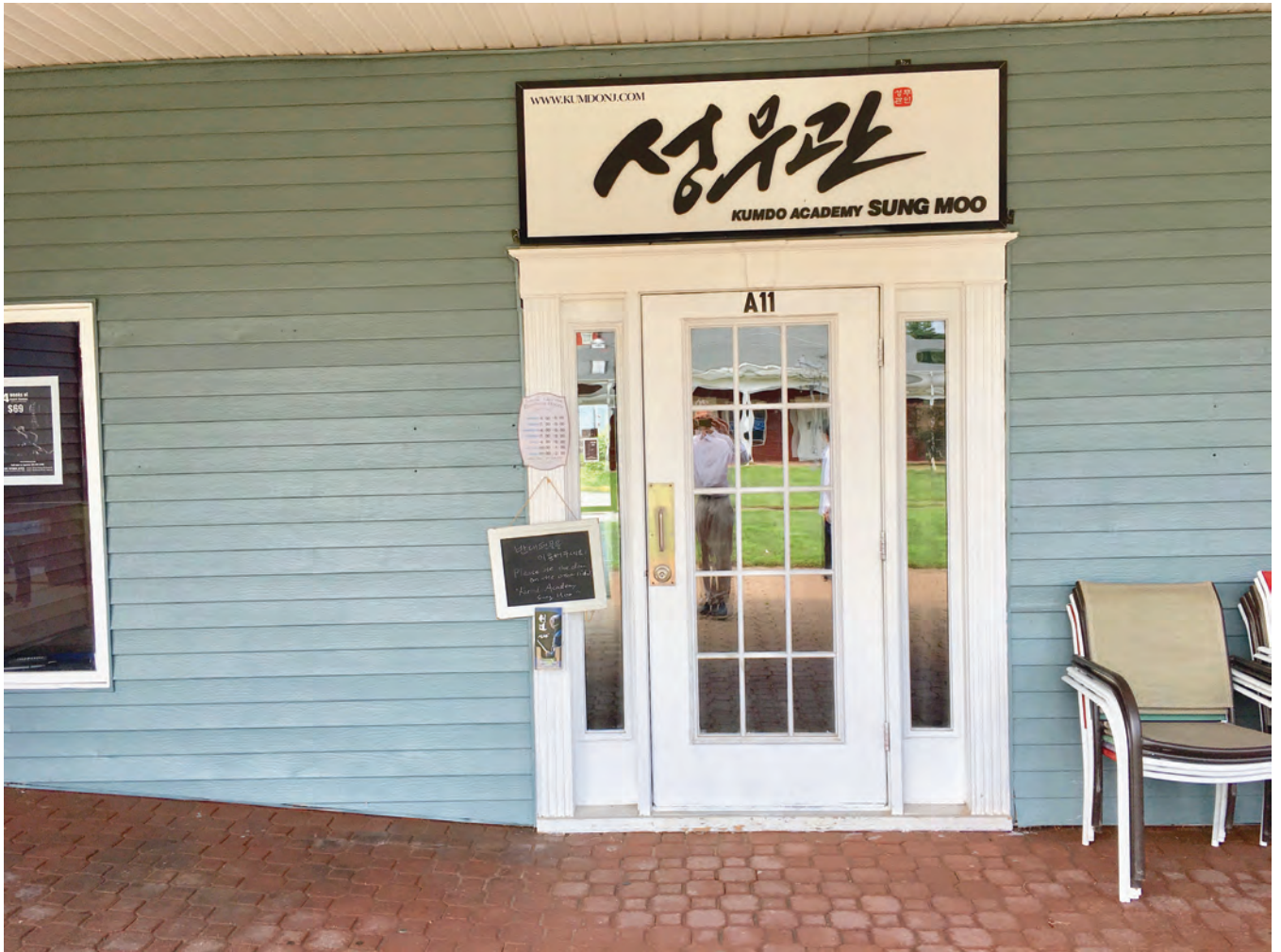
Kumdo Academy Sung Moo 570 Piermont Road Closter, New Jersey 07624