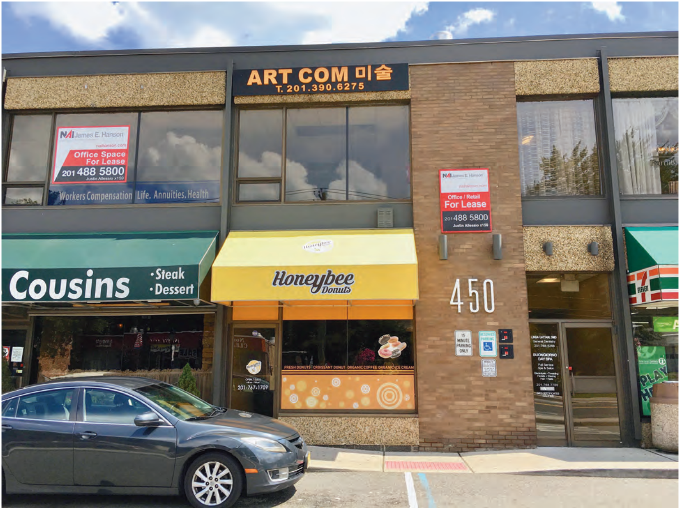
ARTCOM Art School 450 Livingston Street Norwood, New Jersey 07648