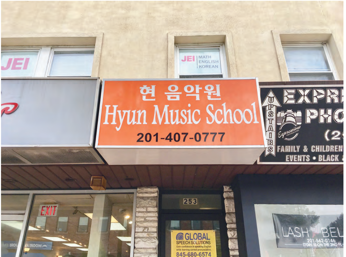
Hyun Music School 251 Closter Dock Road Closter, New Jersey 07624