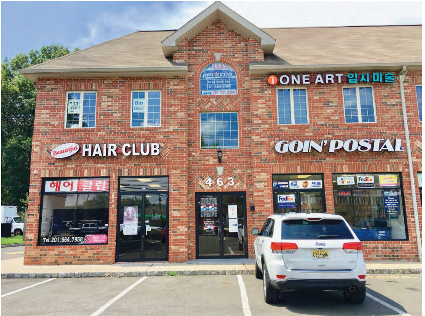
Beautiful Hair Club 463 Livingston Street Norwood, New Jersey 07648