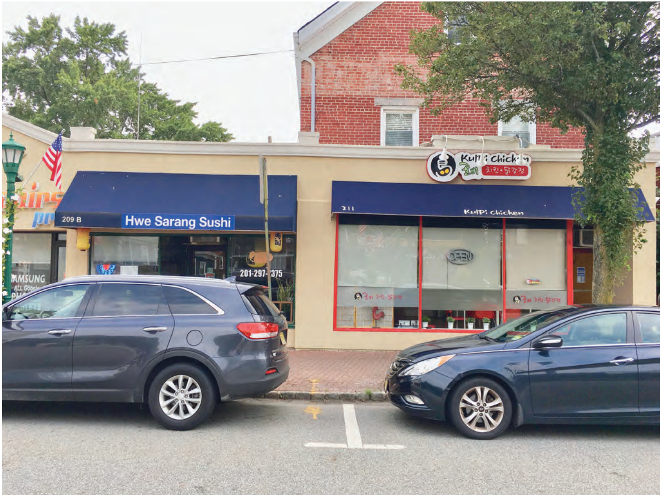
Hwe Sarang Sushi 209 Closter Dock Road Closter, New Jersey 07624