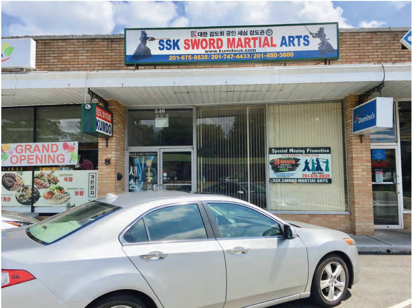
Sae Shim Kumdo Academy 540 Livingston Street Norwood, New Jersey 07648