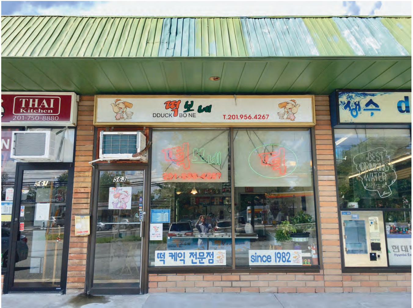
Dduk Bo Ne 563 Livingston Street Norwood, New Jersey 07648