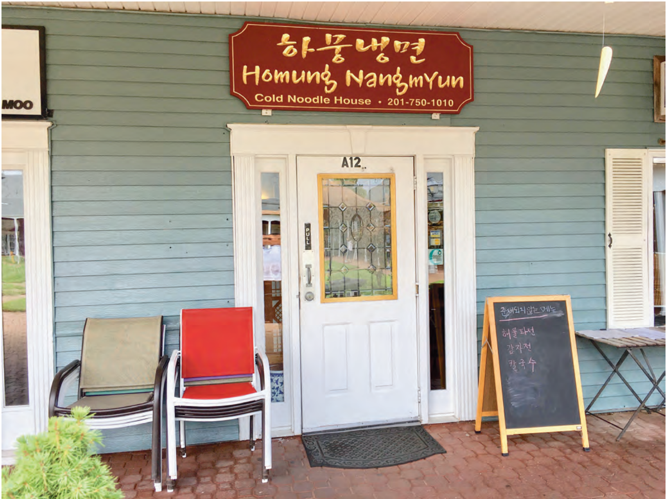
Homung Nangmyun Cold Noodle House 570 Piermont Road Closter, New Jersey 07624