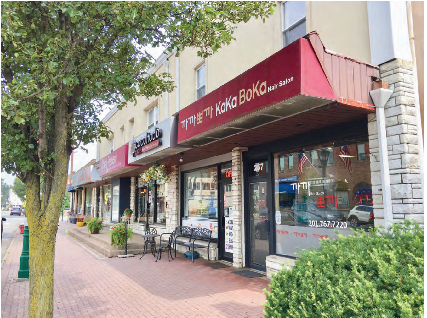
KaKa BoKa Beauty Salon 257 Closter Dock Road Closter, New Jersey 07624