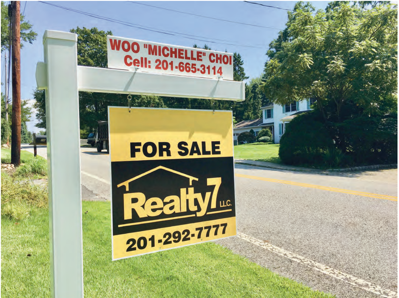
Woo "Michelle" Choi - Realty7 L.L.C. 41.02260, -73.96055 Old Tappan Road Old Tappan, New Jersey 07675