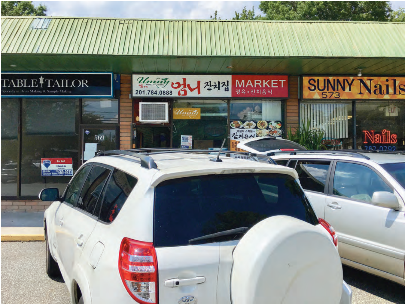
[Um Ni] Umny Market 571 Livingston Street Norwood, New Jersey 07648