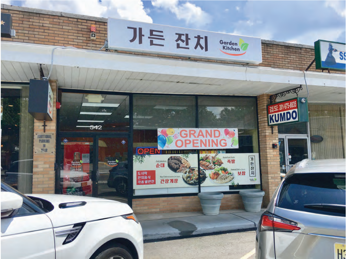
Garden [Banquet] Kitchen Restaurant 542 Livingston Street Norwood, New Jersey 07648