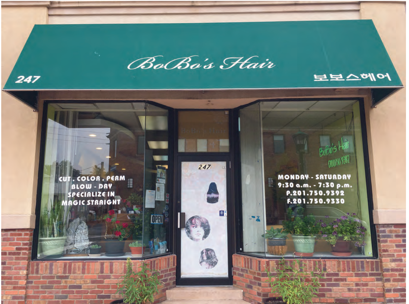
BoBo's Hair Salon 247 Closter Dock Road Closter, New Jersey 07624