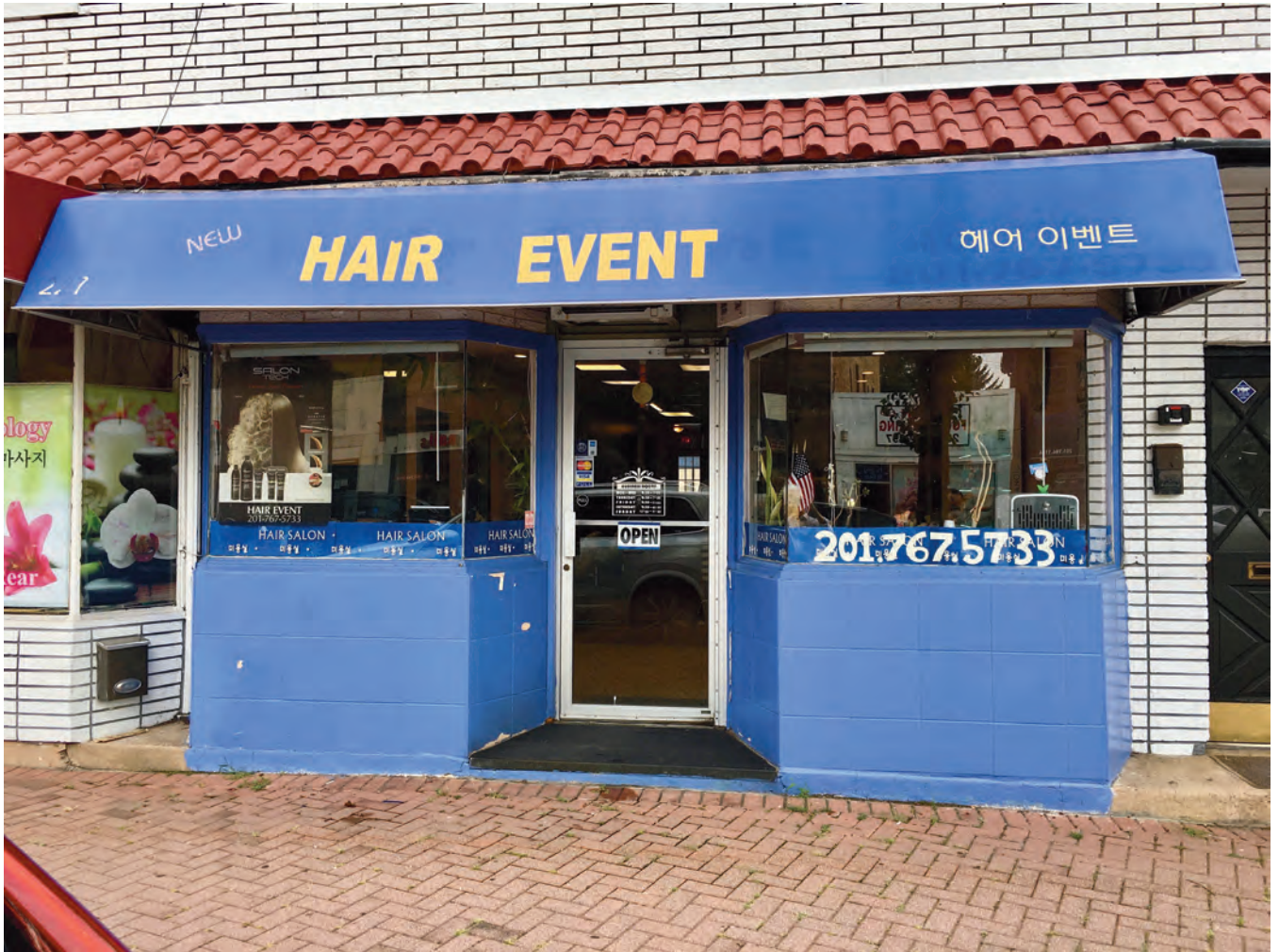
New Hair Event Salon 227 Closter Dock Road Closter, New Jersey 07624