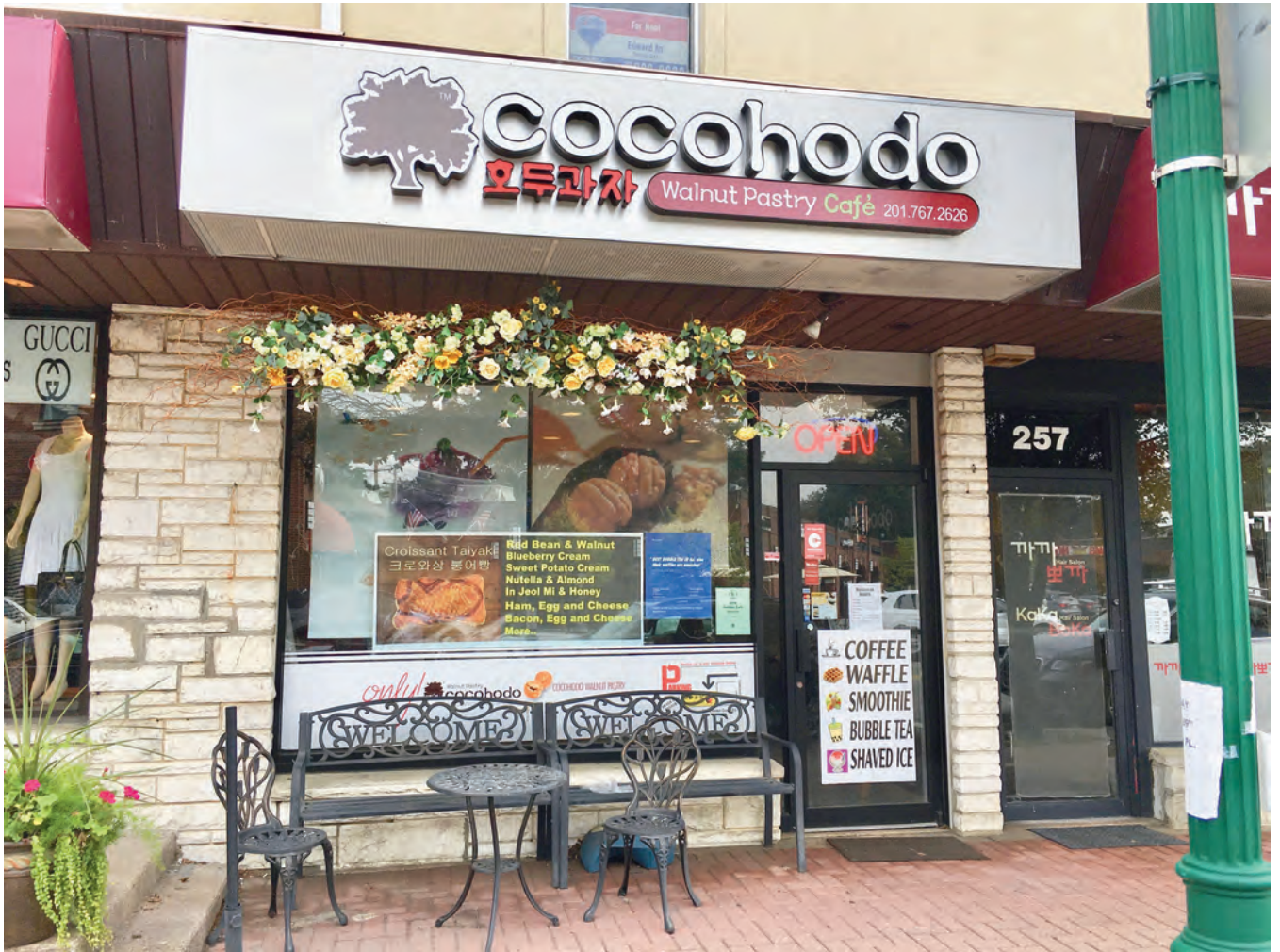
Cocohodo Walnut Pastry Café 255 Closter Dock Road Closter, New Jersey 07624