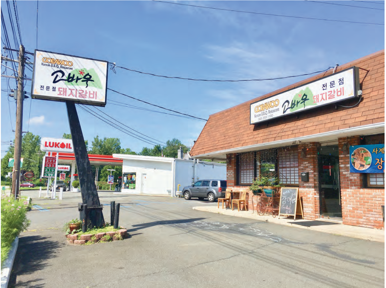
Go Ba Woo Korean Barbeque 4 Route 303 Tappan, New York 10983