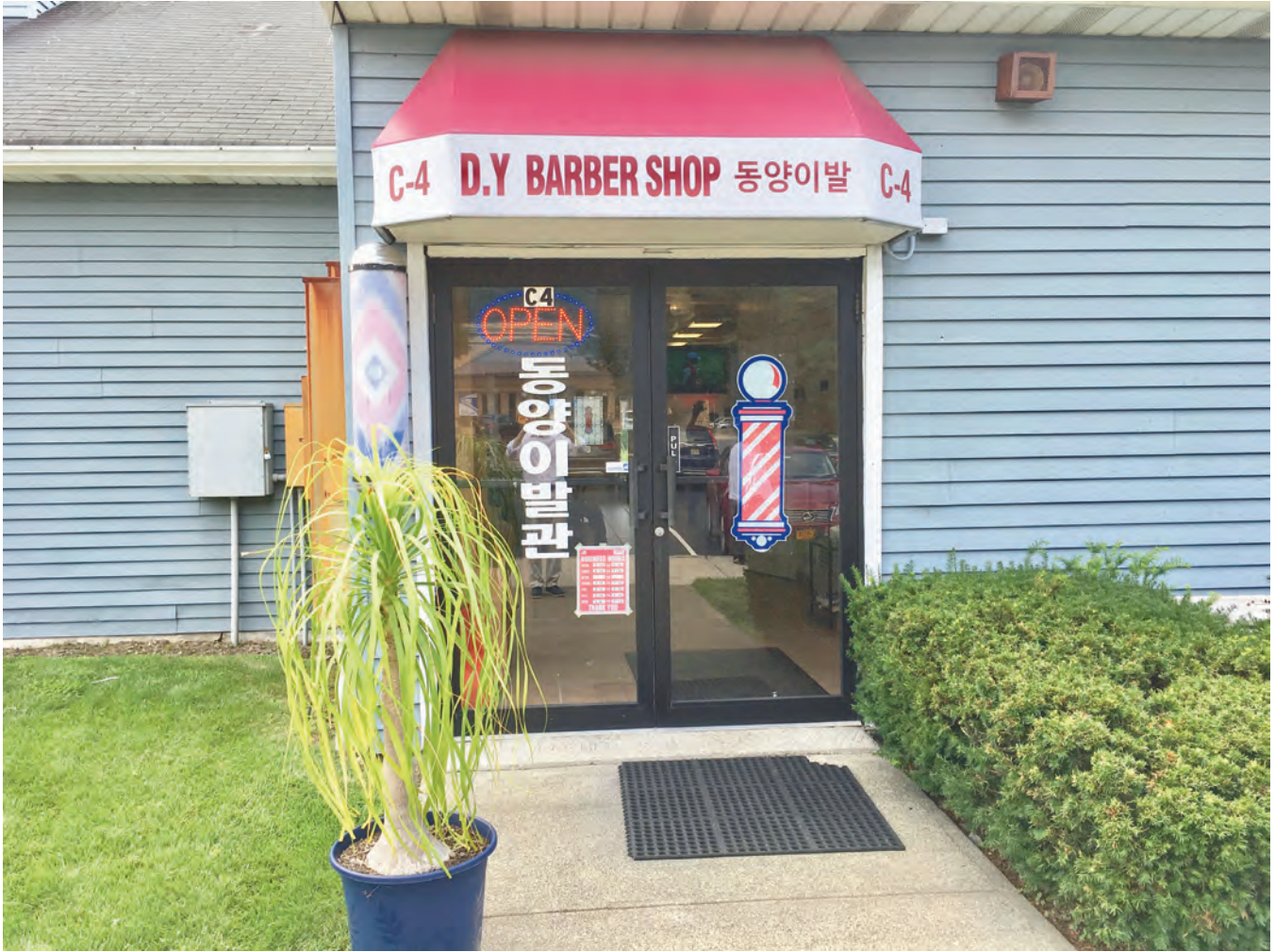
Dong Yang Barber Shop 570 Piermont Road Closter, New Jersey 07624