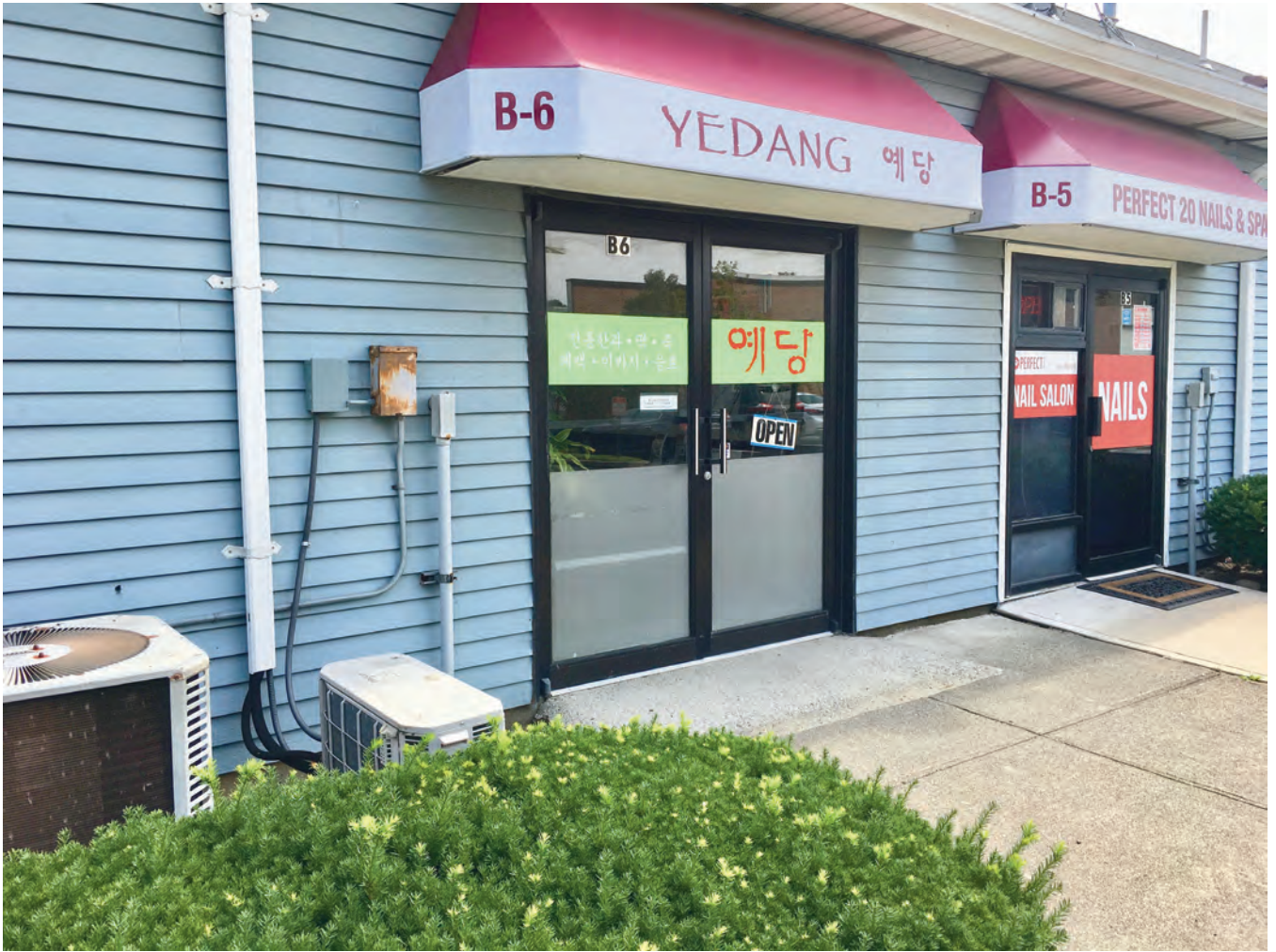
Yedang Traditional Confections 570 Piermont Road Closter, New Jersey 07624