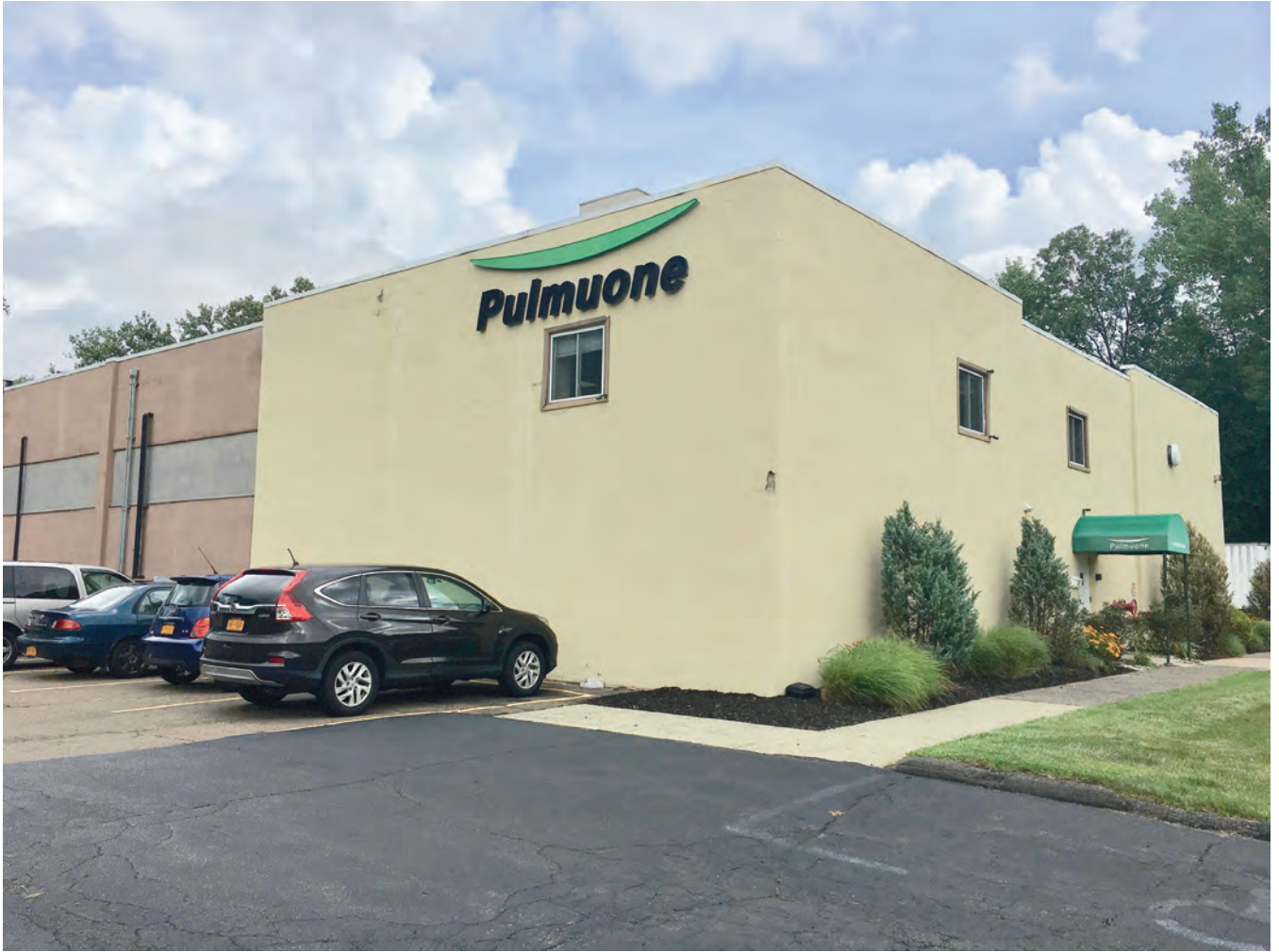
Pulmuone Wildwood Incorporated 30 Rockland Park Avenue Tappan, New York 10983