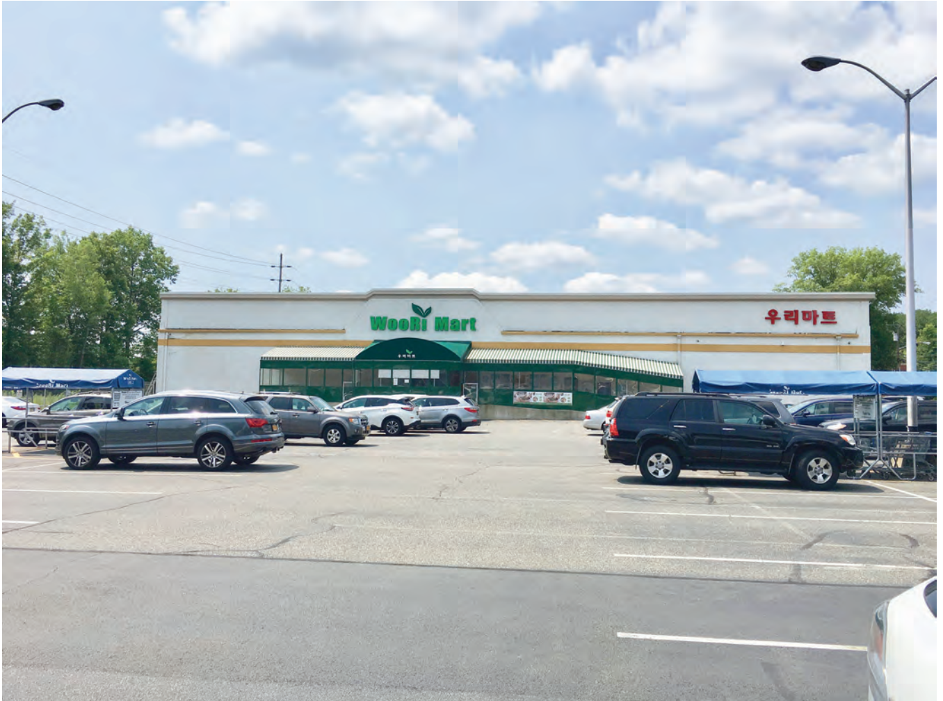
Woori Mart Supermarket 206 Pegasus Avenue Northvale, New Jersey 07647