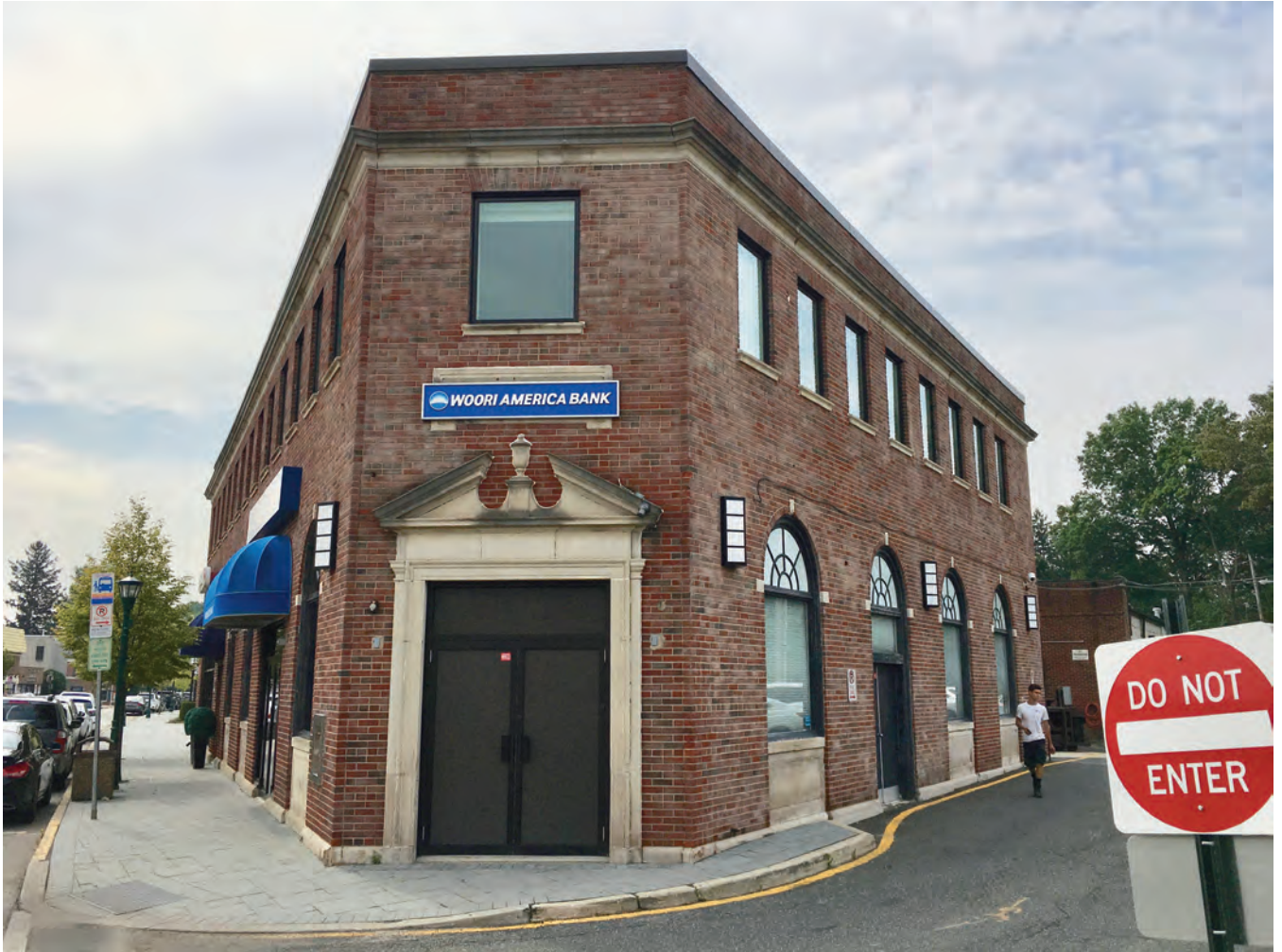
Woori America Bank 234 Closter Dock Road Closter, New Jersey 07624