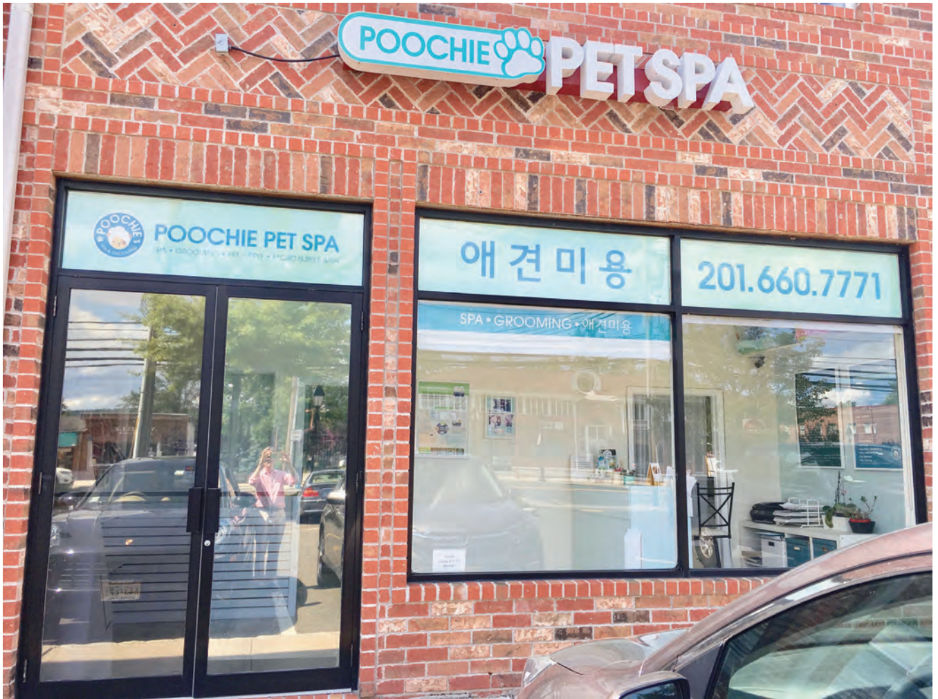
Poochie Pet Spa 463 Livingston Street Norwood, New Jersey 07648