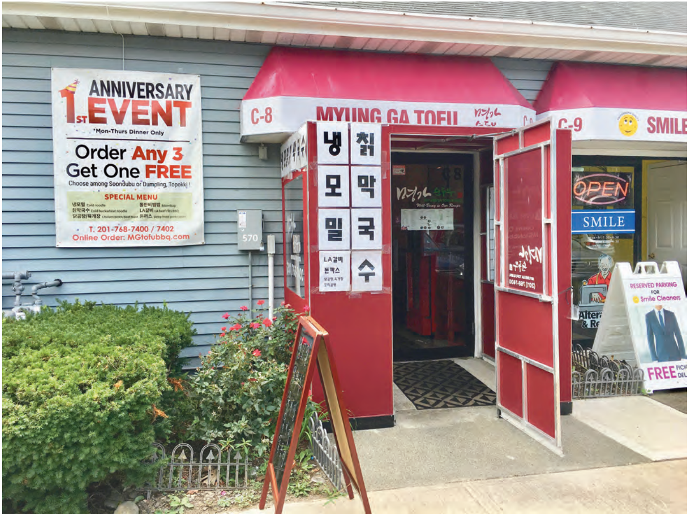
Myung Ga Tofu Restaurant 570 Piermont Road Closter, New Jersey 07624