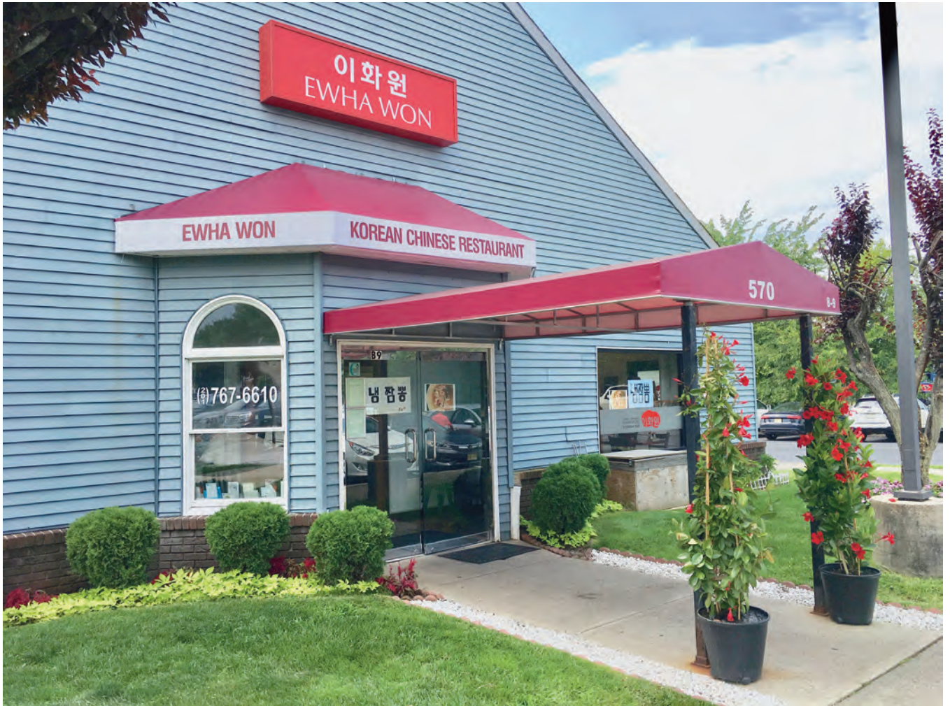
Ewha Won Chinese Korean Restaurant 570 Piermont Road Closter, New Jersey 07624