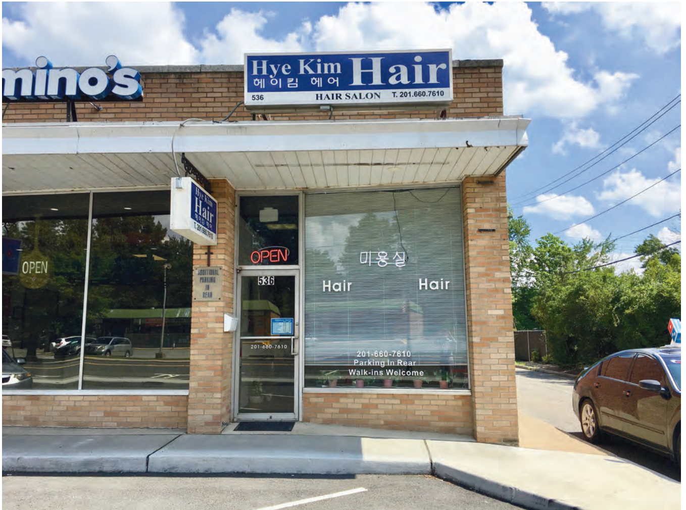
Hye Kim Hair 536 Livingston Street Norwood, New Jersey 07648