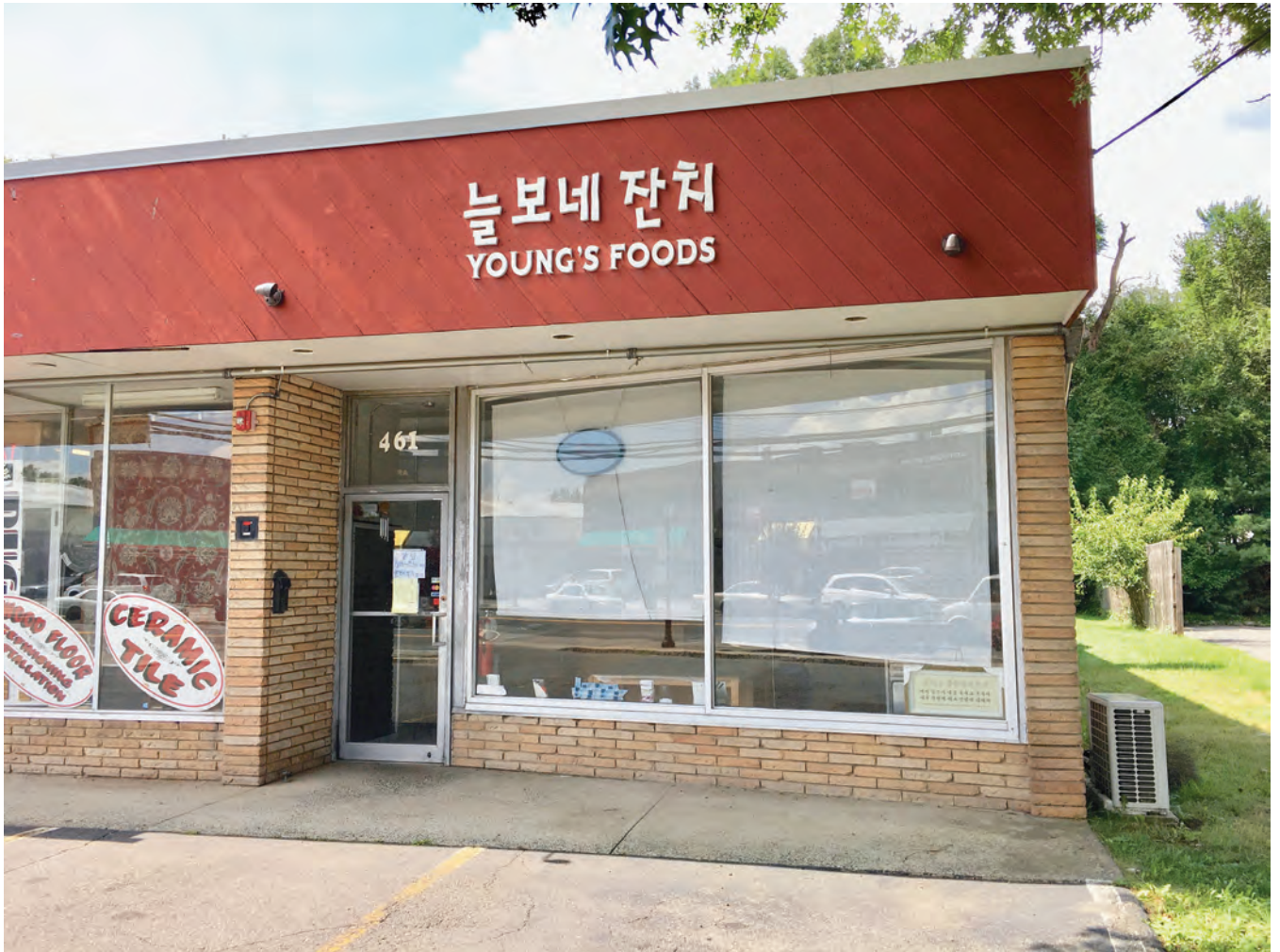
[Nulboneh Banquet] Young's Foods 461 Livingston Street Norwood, New Jersey 07648