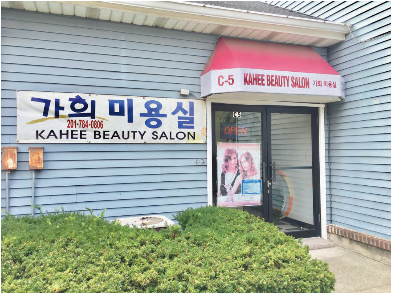
Kahee Beauty Salon 570 Piermont Road Closter, New Jersey 07624