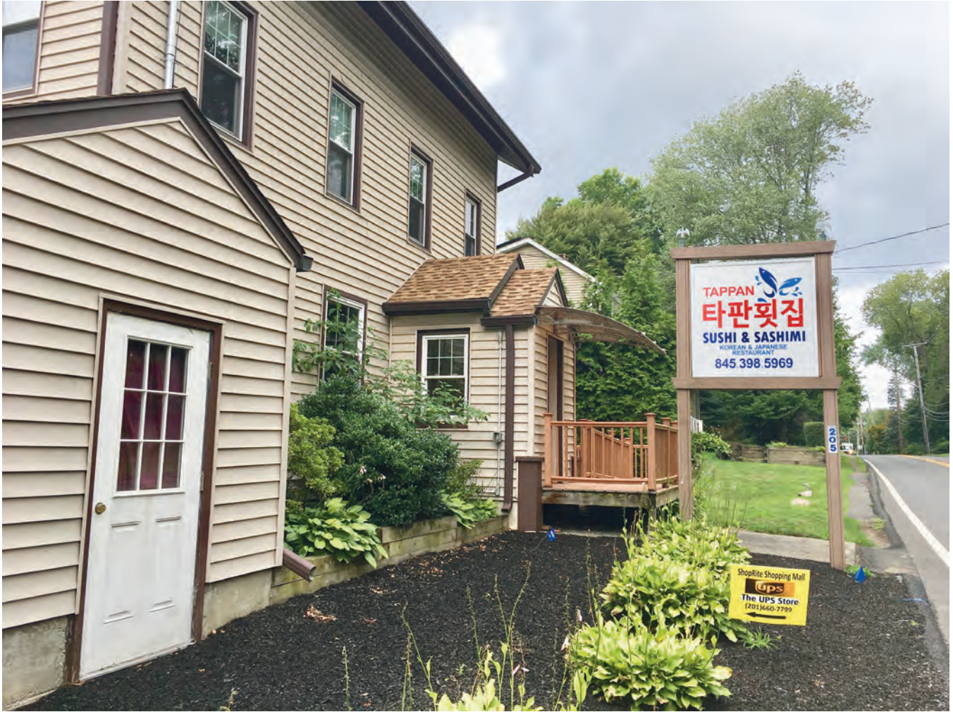
Tappan Sushi & Sashimi 205 Oak Tree Road Tappan, New York 10983