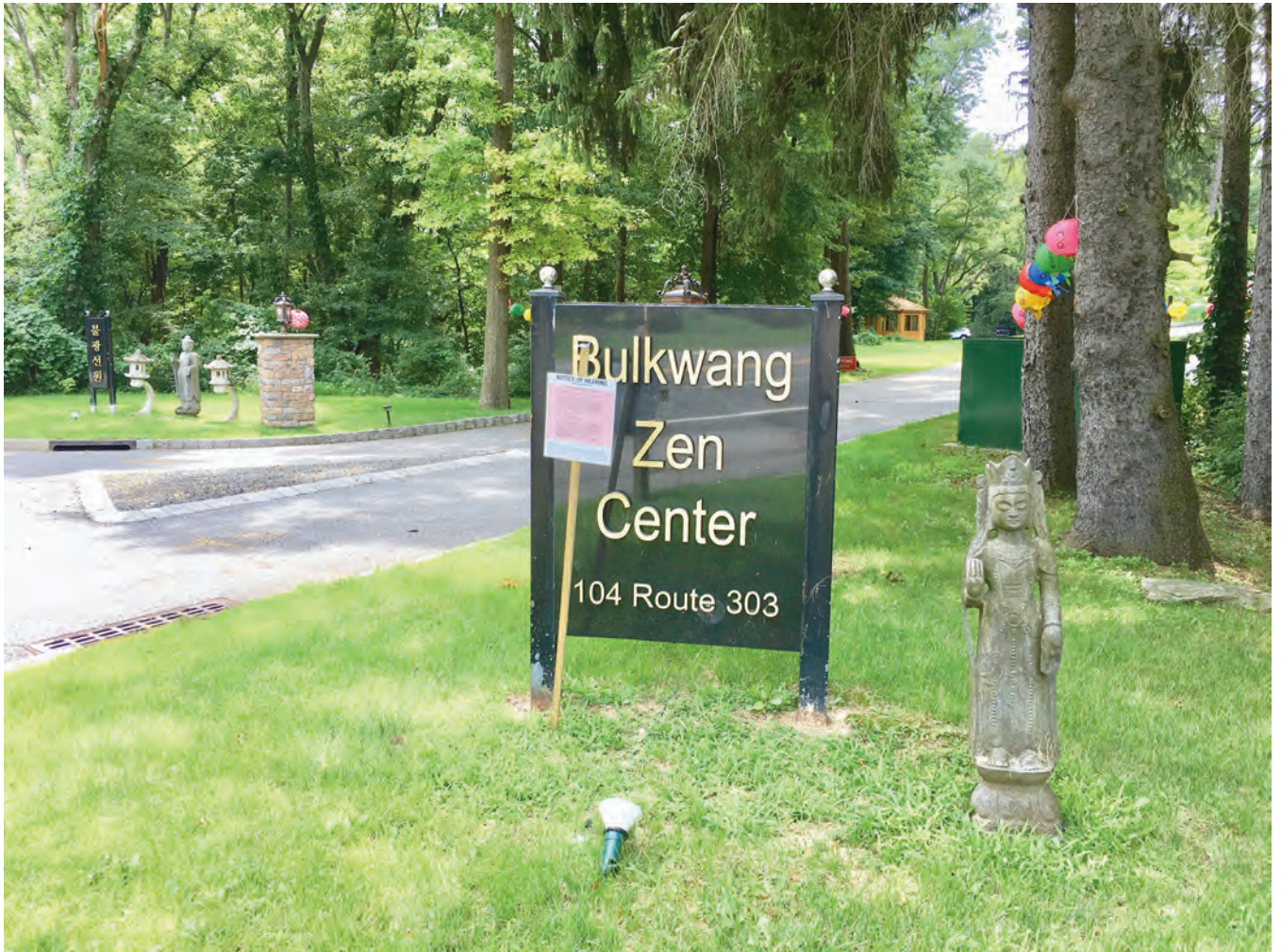
Bulkwang Zen Center 104 Route 303 Tappan, New York 10983