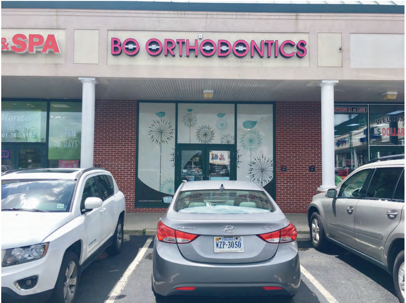
Bo Orthodontics 269 Livingston Street Northvale, New Jersey 07647