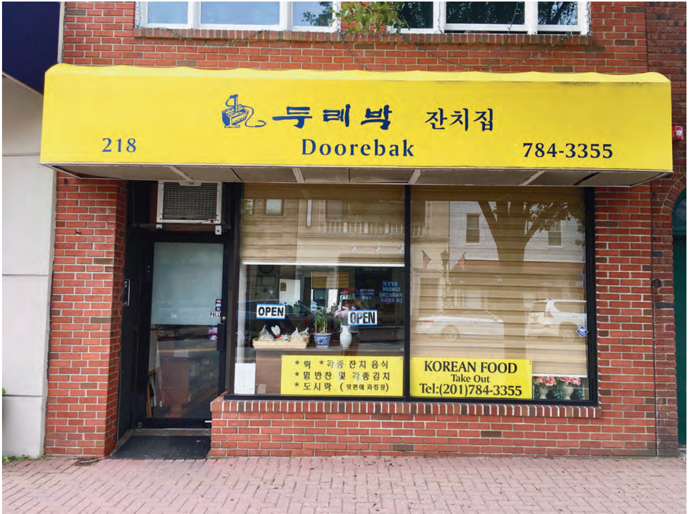
Doorebak Caterers 218 Closter Dock Road Closter, New Jersey 07624