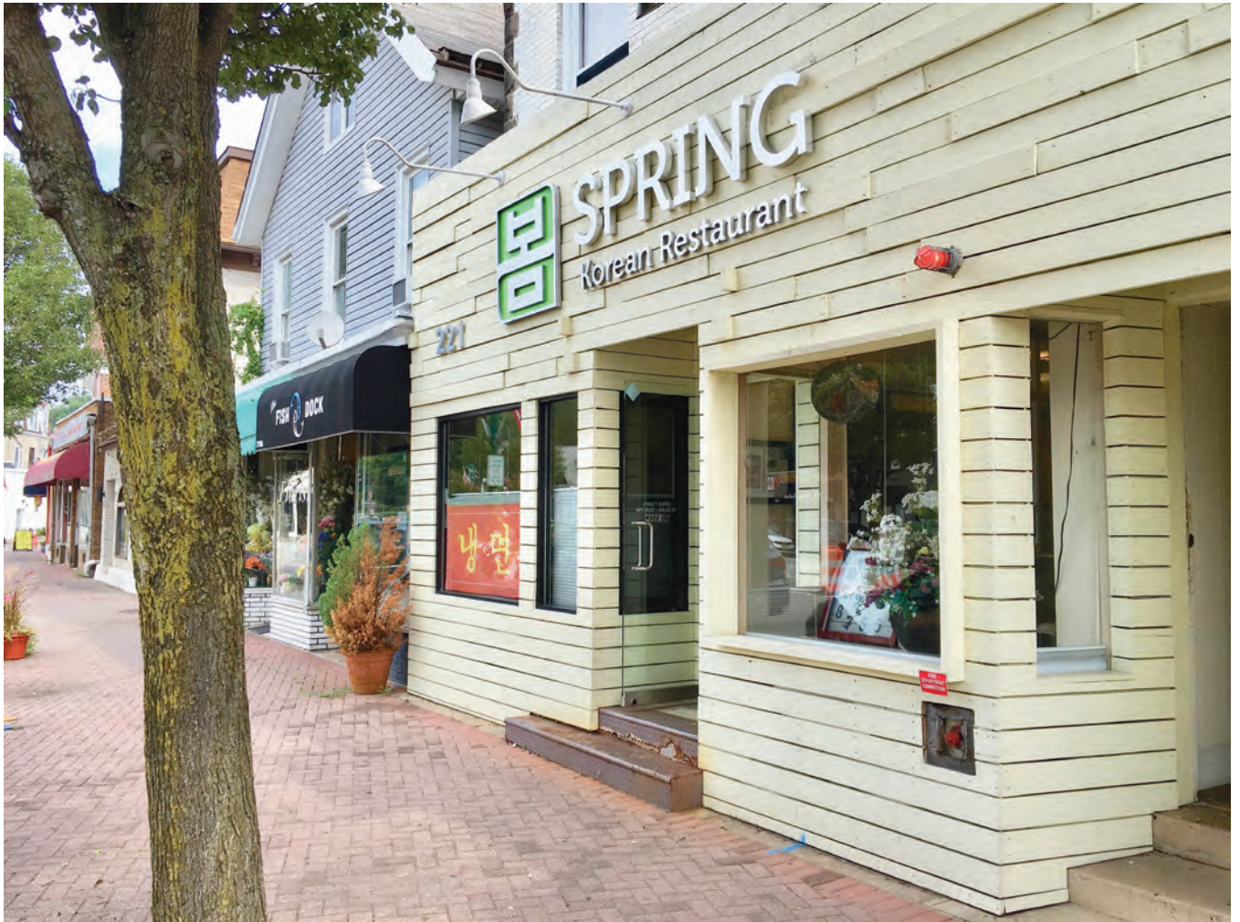
Spring Korean Restaurant 221 Closter Dock Road Closter, New Jersey 07624