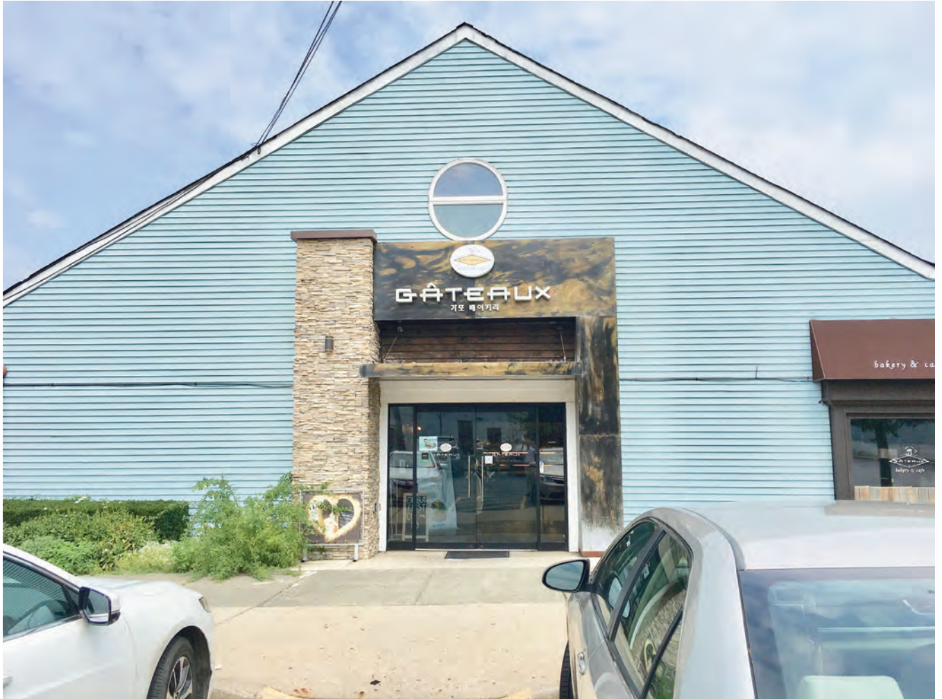
Gateaux Bakery and Café 570 Piermont Road Closter, New Jersey 07624