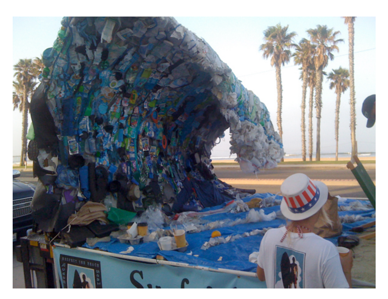
Figure 6 . Andre Faubert, Huntington Beach Fourth of July Parade Float, 2011, 580 pounds of refuse from the shores of Huntington Beach, California.

As one example, take Figure 6, a 2011 parade float from Huntington Beach, California, made of trash collected from that beach, a float that has Hokusai's print as one obvious reference.