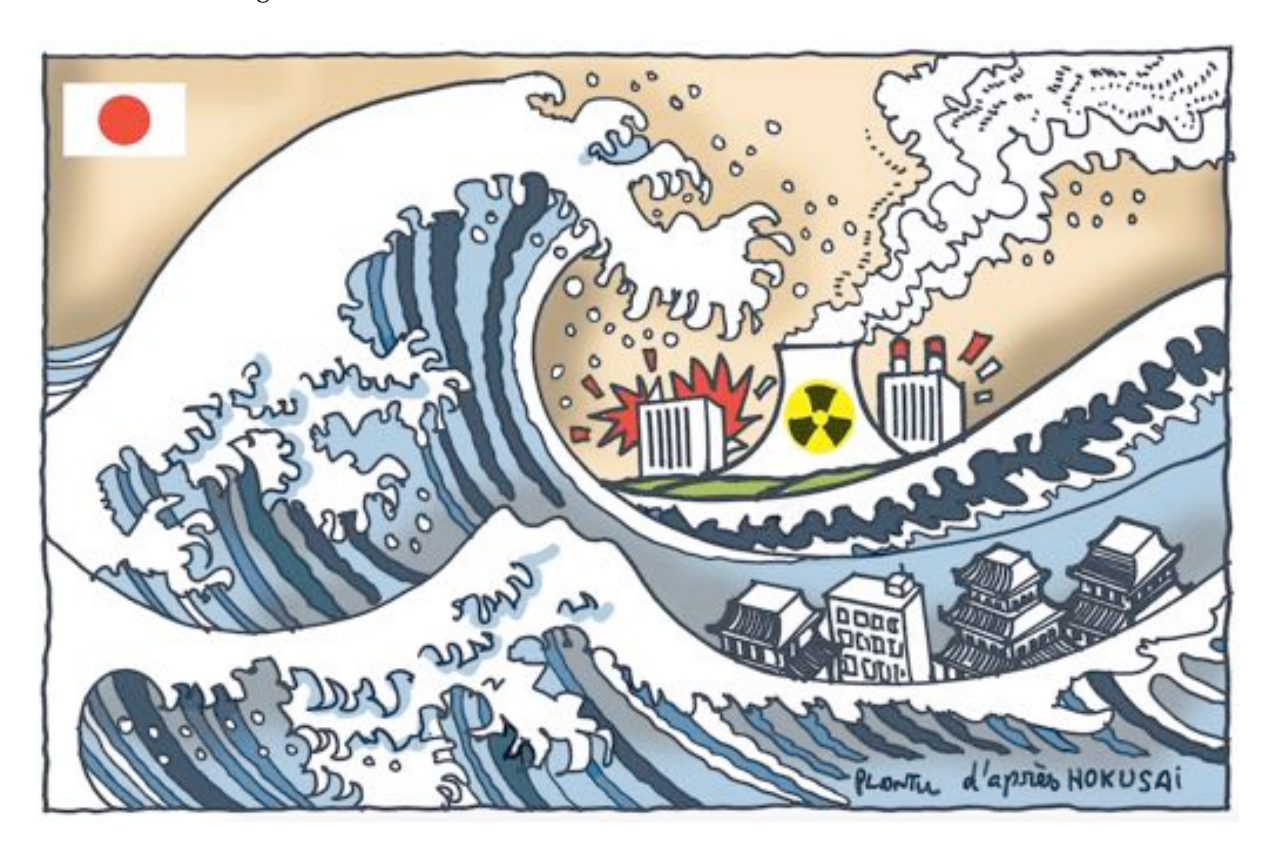
Figure 2. Dessin de Plantu, d'après Hokusai, Le Monde, 15 mars 2011. Reproduced with Permission.

more—and operates as something of a call to arms. It now no longer jeopardizes only the small fishing boat in the image, but also a wider translocal polity. It operates as a harbinger of danger to/for the viewer, who is addressed as a person caught up in a world in which catastrophe is globalized. In some ways, this leverages earlier habits of viewing toward new purposes; Guth writes, "the vantage point adopted in 'Under the Wave off Kanagawa' erases the boundaries between subject and object, transforming the viewer into a participant in this watery drama;"<sup>11</sup> the participant nowadays becomes the environmentally freaked out citizen. No surprise that, in the aftermath of the 2011 tsunami, the Wave was reactivated to speak, in a range of editorial cartoons, to that disaster (Figure 2), even sometimes being used as an icon for warnings in tsunami zones (Figure 3).