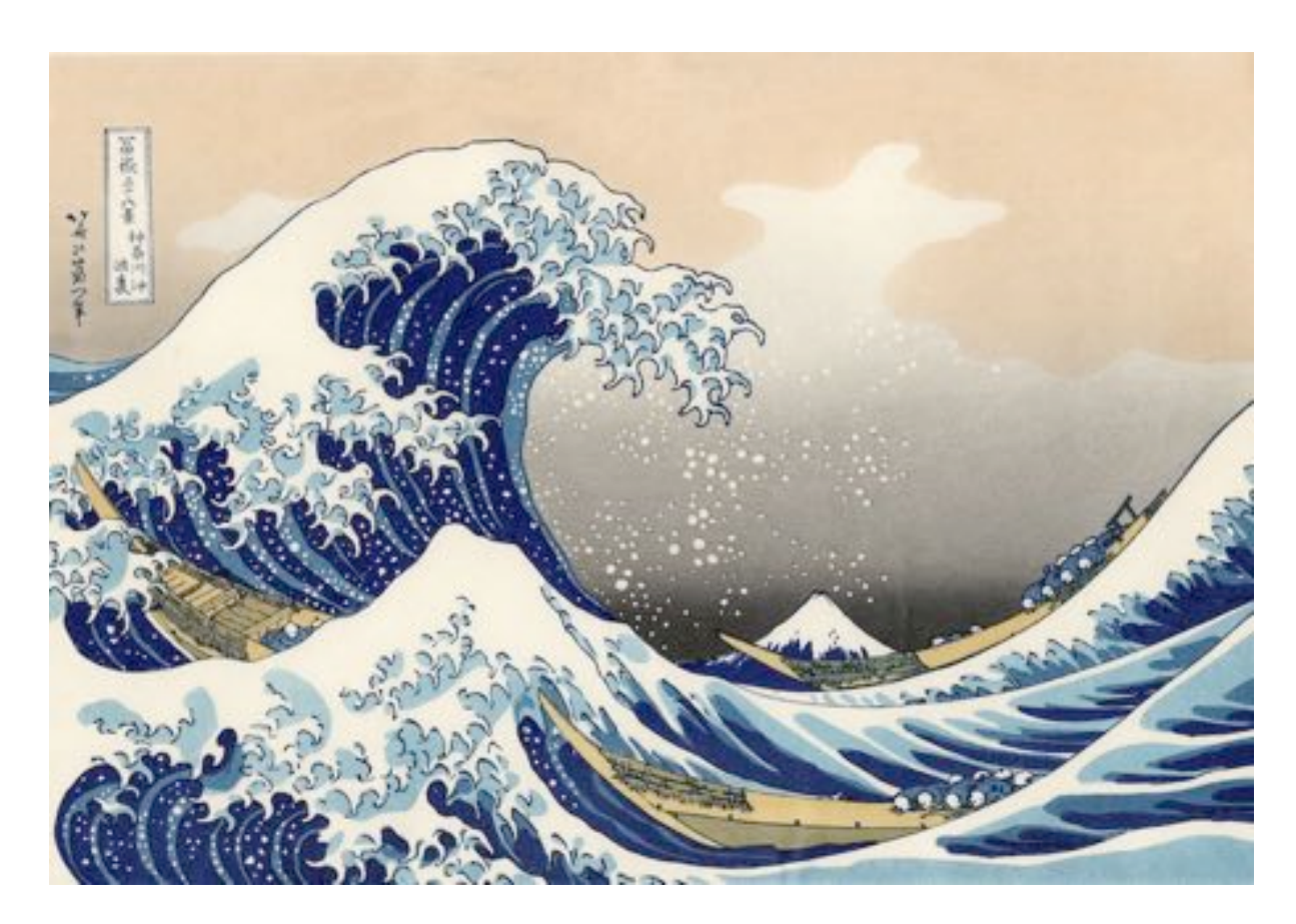
Figure 1. Katsushika Hokusai, Under a Wave at Kanagawa, c. 1829, woodblock print

My examination of recent avatars of the Hokusai figure builds on art historian Christine Guth's Hokusai's Great Wave: Biography of a Global Icon, the essential account of the worldwide history and travel of the Wave image. Guth brilliantly examines the mutating social life of Hokusai's image, from its production in late-Edo Japan to its emergence as a French, Euro-American, and then global signifier of all things Japanese; from its work in Japanese nationalism to its play in circuits of commodity capitalism; from its status as a shorthand for international high art to its popular manifestation as a lifestyle brand (think surfing); and from its early conscription into classical Western aesthetics of the sublime to its increasing association with looming global environmental disaster. The commentary I offer here—really just a footnote to Guth's definitive book—examines how artists are today rematerializing Hokusai's Wave so that they might call attention to the beleaguered life of the sea in the age of a toxic and trashed modernity.