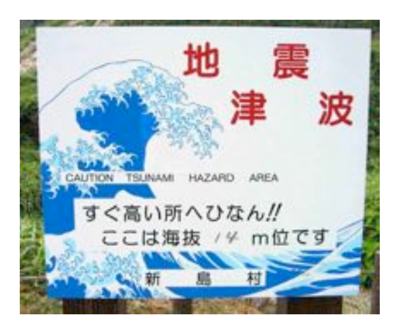
Figure 3. Tsunami warning sign, Niijima, Japan.

Not everyone has been sanguine about this appropriation. Earth and Ocean scientists in particular have been adamant that Hokusai's wave not be mistaken for a tsunami. Tsunamis do not feature cresting troughs, but arrive rather as encroaching floods. Just because the word tsunami is Japanese and the woodcut is Japanese, they emphasize, does not mean the Wave represents a tsunami.<sup>12</sup>