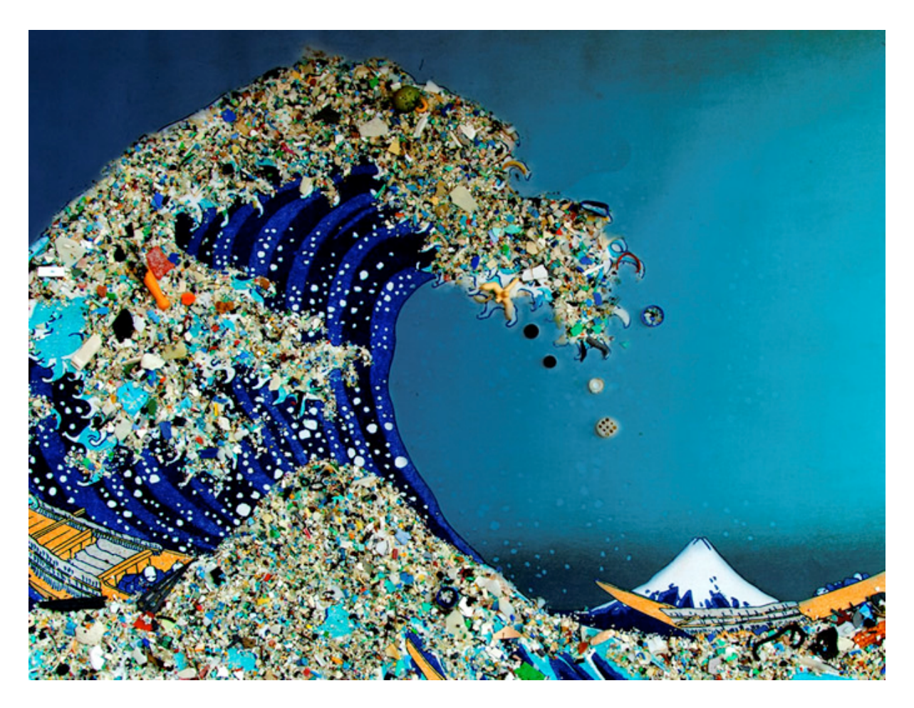
Figure 8 . Bonnie Monteleone, Plastic Ocean: In Honor of Captain Charles Moore, from the What Goes Around Comes Around collection, 2011, trash.