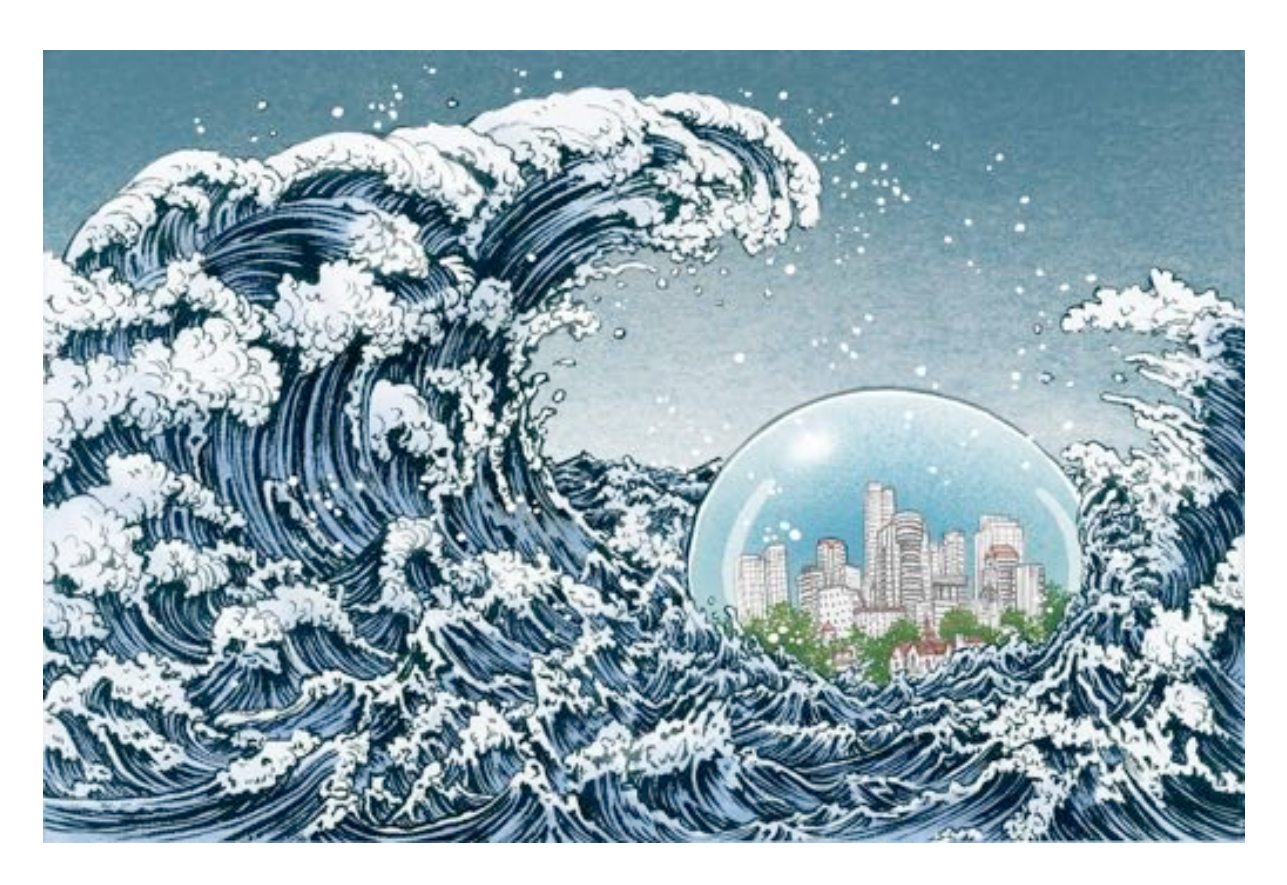
Figure 4. Yoko Shimizu, illustration for Michael Cockram, "Bracing for Climate Change," Green Source Magazine, January/February 2013. Copyright Yoko Shimizu http://yukoart.com/blog/climate-change-and-the-city, blog entry, February 11, 2013. Reproduced with Permission.