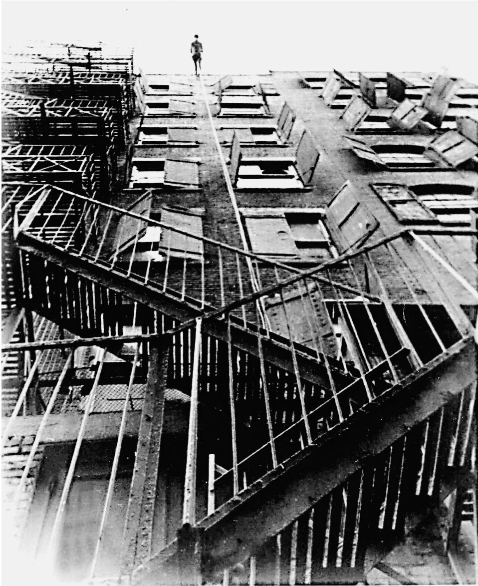
Trisha Brown. Man Walking Down the Side of a Building. 1970.