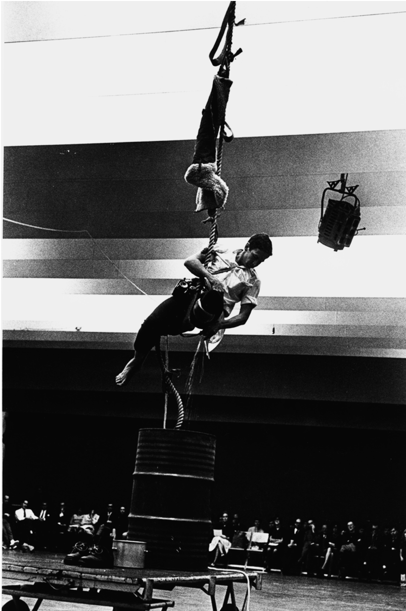
Robert Rauschenberg. Elgin Tie. 1964.