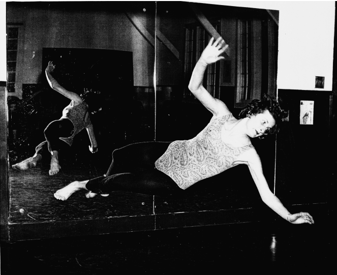
Trisha Brown. c. 1964.

stand, sit, and lie down—performed in indeterminate, improvised relationship to one another, without transitions. Her elimination of transitions echoes ideas articulated in John Cage’s “History of Experimental Music,” where he wrote, “Composers were getting rid of the glue . . . where people had felt the necessity to stick sounds together to make a continuity. . . . We felt the opposite necessity, to get rid of the glue so that sounds would be themselves.” 12 Yet in dance, more than in music, “erasing the glue” is an unachievable ideal: one has to get from A to B. Brown’s combination of pedestrian actions with indeterminate rules for their performance produced unpredictable results. As Brown cantilevered off the floor into handstands and hovered above the ground, critics discerned movement tasks: “a sitdown fall and handstands,” 13 or a “grow[ing], flower[ing] of its own natural accord from its first physical impulse of simply getting up and lying down,” 14 with “spontaneity” named as Trillium ’s most prominent attribute. Brown’s choreographic logic, the dynamic of formalized movement tasks and indeterminate performance, went unseen .