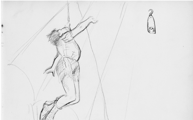
Edgar Degas. Sketch for Miss La La at the Cirque Fernando. 1879.

includes a detailed drawing of the apparatus of the performer's suspension: a wooden plaque hollowed to hold her teeth's bite and attached to a simple hook, the mechanism of her upward lift towards the circus tent's heights. Similarly, Man Walking (2010) revealed not only movement through space but also the apparatus that made such movement possible. The walker was lifted while trying to exert her or his weight to walk downward, producing a succession of actions and cognitive decisions whose deployment—by gravity, by the belayers, and by the performer—was visible to the audience.