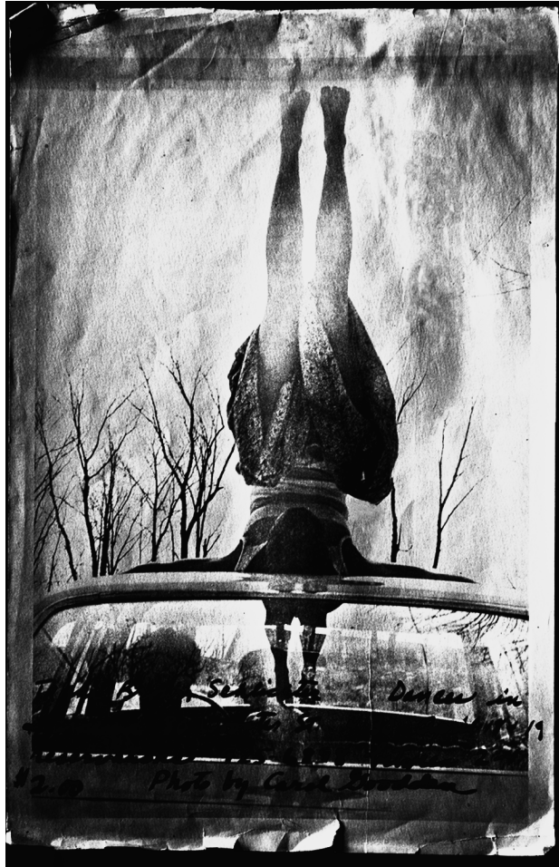
Poster for "Dances in and Around 80 Wooster Street." 1970.

Museet, Stockholm, featured Rauschenberg descending by a rope from the ceiling lights in one of the museum's galleries, which took him, as he performed various tasks, to the gallery's floor. Brown's 1970 use of 80 Wooster Street's façade and interior, as well as the street outside, extended a legacy of Fluxus "street events" presented in SoHo in the mid-1960s. 45