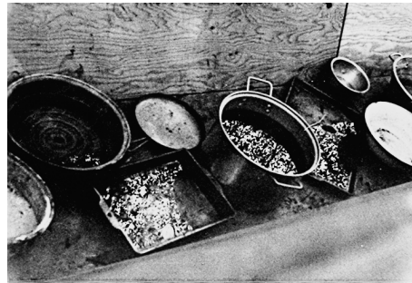
Brown. The Stream. 1970.

Brown's path from 80 Wooster Street to the Whitney Museum was anticipated by the logic of Man Walking , and the new interest in temporality on the part of museums underpinned her Whitney Museum program, “Another Fearless Dance Concert.” 54 In this context, Brown reconfigured the piece as Walking on the Wall (1971). Seven dancers, suspended from the grid of the Whitney's ceiling, walked across two perpendicular gallery walls. Without the determining limit provided by architecture, this activity was not object-like: instead, walking is defamiliarized as a group process enacted across two surfaces of an implied open cube.