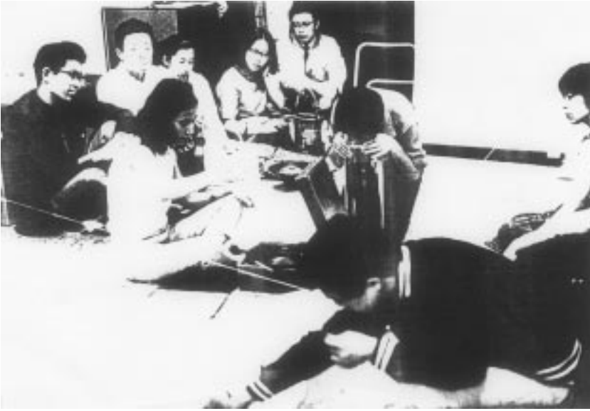
| Figure 10.1 |

Mieko Shiomi performing her "Water Music" at the Crystal Gallery, Tokyo (8 September 1965)