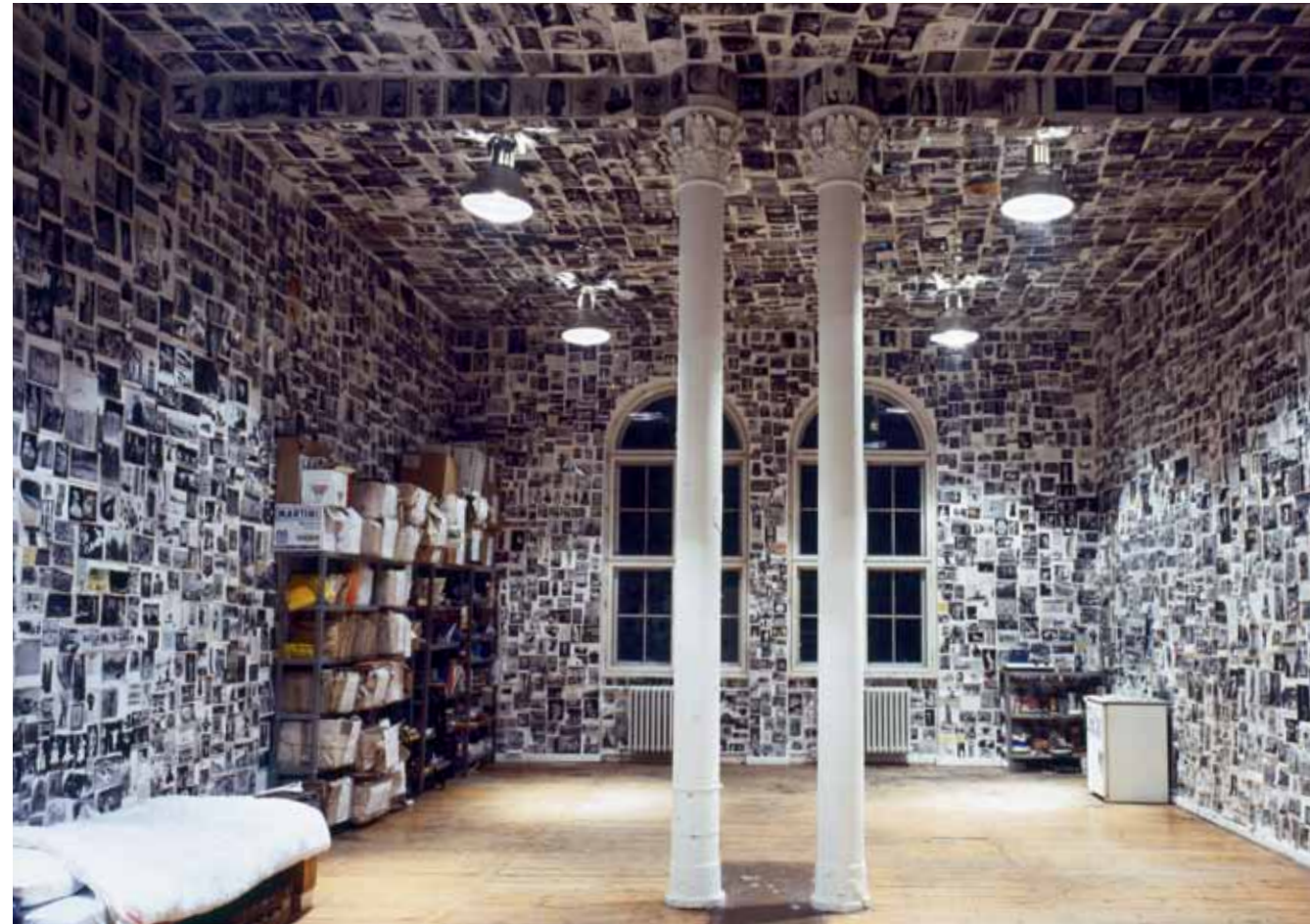
View of subREAL's installation Dataroom , 1995, part of the "Art History Archive," at Künstlerhaus Bethanien, Berlin.

the course of the exhibition, the images slowly peeled off and fell to the floor in a symbolic reenactment of the regime's downfall. The display also evoked the systematic censorship that occurred under Communist rule. Images of artworks had been cropped or altered for publication in ARTA , a process made apparent by subREAL's installation of the original, prepublication images sent to the magazine.