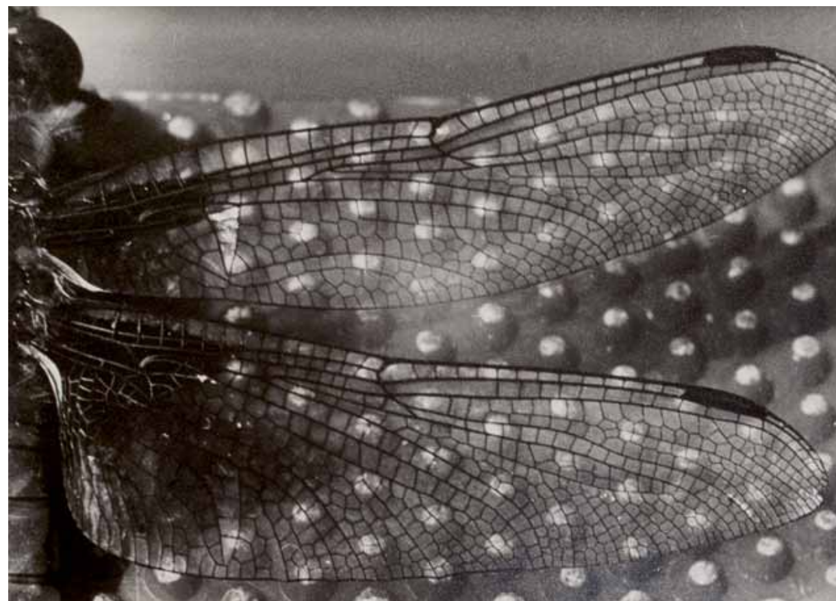
Ștefan Bertalan: Dragonfly Wings Study , ca. 1972-74, black-and-white photograph, 8¼ by 11½ inches.

During this lull, the artists who would become the representatives of the Romanian neo-avant-garde finished their educations and started taking artistic risks. Yet even as they benefited from the thaw, Romanian experimentalists maintained their official duties as academics or members of the UAP, producing art sanctioned by the state. This oscillation between private and public practices—the effective splitting of the artistic self in two—also informed