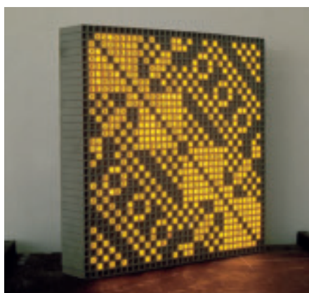
Vladimir Bonačić GF. E32 -S 1969/1970 Computer-controlled light object Aluminum, electronics, electric lamps 1024 elements 68 × 68 × 12 cm SDS-930, computer program implemented in special-purpose hardware Produced at Ruđer Bošković Institute, Zagreb Dunja Donassy-Bonačić, bcd cybernetic art team

In 1977, almost ten years after his first artistic experiments, Bonačić stated that a Dynamic Object was a “concept in which impregnable unity is established between the computer system and a work of art.” 16 In 1987 he added: “To integrate computer systems and art, without allowing one to dominate the other, is seen as a step toward the common language. This means that the artist and their work of art are able to communicate; artists and their art use a common language.” 17