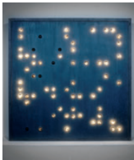
Vladimir Bonačić Random 63 1969 Electronic object 76 × 76 × 7 cm PDP-8 Dunja Donassy-Bonačić bcd cybernetic art team

imal originality,’ no matter what the results of the program might be. The random generator creates the accidental and unique presentation, which has neither value nor importance for human beings. Such information can evoke various associations in the observer. However, a computer used in such a way lags far behind the human being. Even if the expressive potentialities of the computer were equal to those of a human being, the essence of Pollock’s world and creation would not be surpassed, regardless of the complexity of future computers or peripheral units. That, of course, does not mean that a man (or a monkey or other animal) aided by a computer could not create an aesthetically relevant object if they act consciously or unconsciously obeying the law of accident.” 33