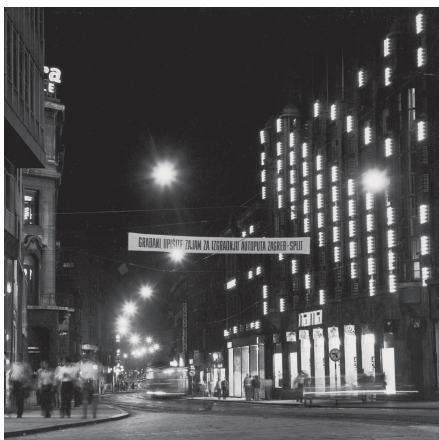
Vladimir Bonačić DIN. PRIO 1969–1971 Computer-controlled light installation Metal construction, electronics, electric lamps, glass 100 × (88 × 48 × 25 cm) Installed on Nama department store on the street Ilica, Zagreb SDS-930, computer program implemented in special-purpose hardware Produced at Ruder Bošković Institute, Zagreb

in 1971, he also set up another installation on the facade of the Nama department store on Ilica Street, the Dynamic Object DIN. PRIO .