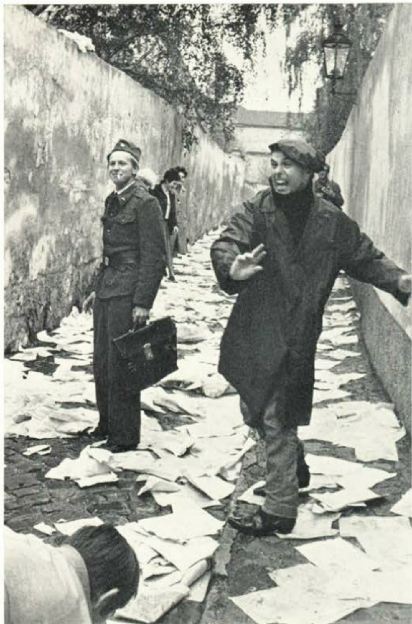
The illustrations on this page relate to Manifestation of August 2nd , described on the facing page