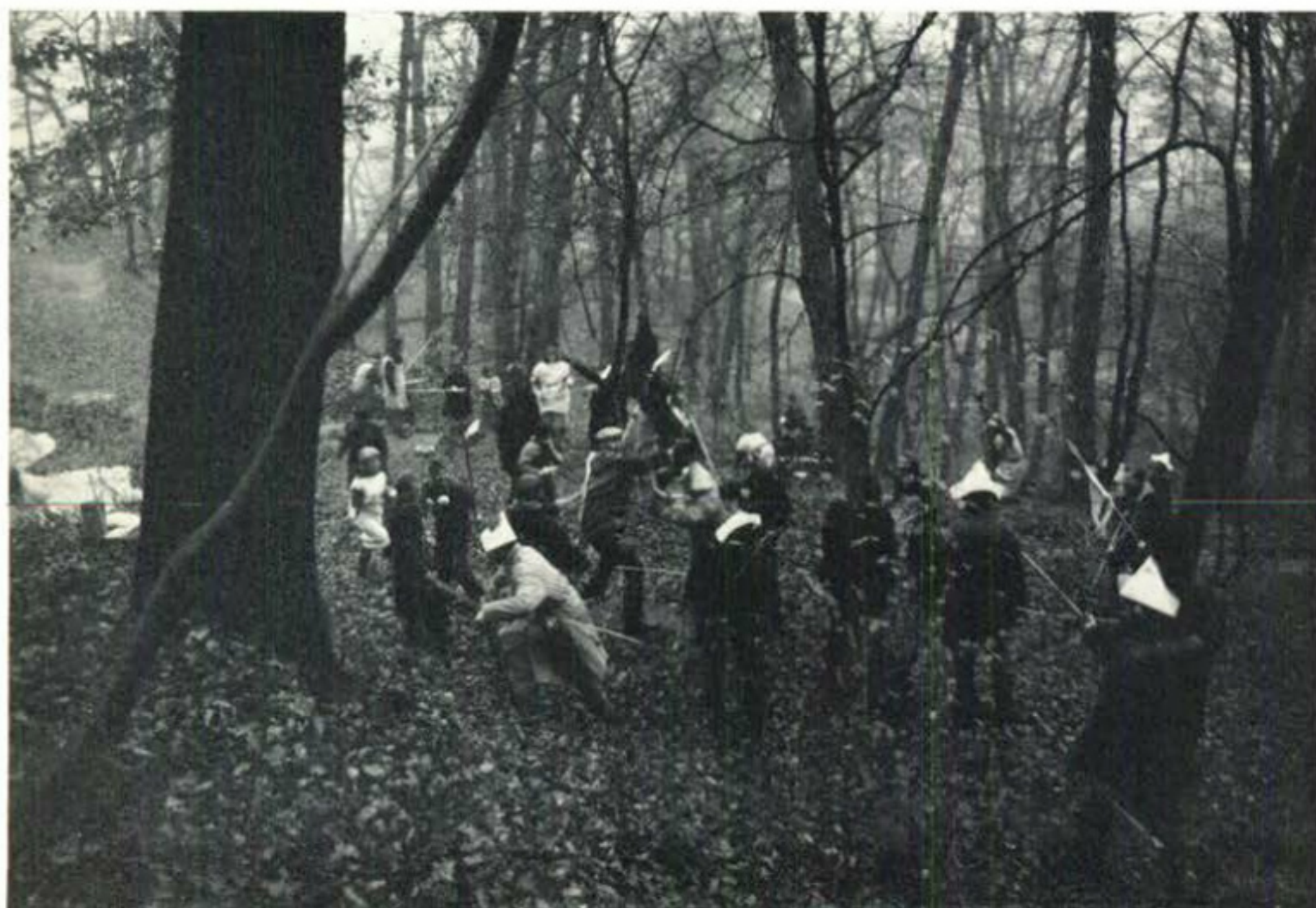
Soldiers' game —a self-explanatory Happening played out in a wood on the outskirts of Prague