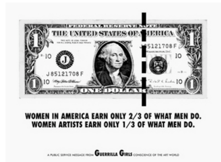
Guerrilla Girls, Women in America Earn Only 2/3 of What Men Do , 1985, offset print on paper, 17 x 22".

Further complicating the current status of artistic production is the 180-degree shift in the profile of the artist, from marginal outcast to a fetish figure for the "creative," networked economy. Cultural critics from Luc Boltanski and Eve Chiapello to Brian Holmes have analyzed how '90s-era business managers and policy makers absorbed the desire for autonomy writ large by the artistic demands of '60s counterculture to transform the workplace into a softer, less hierarchical, and ultimately more flexible form of social control. The new spirit of capitalism calls on all of us to think like an artist: outside the box .