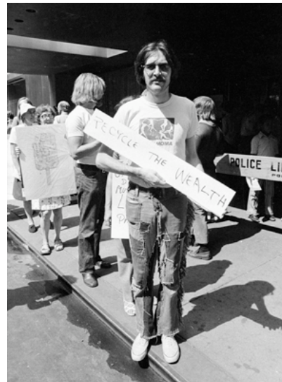
Strike by the Professional and Administrative Staff Association of the Museum of Modern Art, supported by the Art Workers' Coalition, outside the Museum of Modern Art, New York, August 30, 1971.

BEFORE AN ARTWORK can be exhibited, before it represents or refuses to represent anything, before it can be dealt, sold, or collected, there come research and planning, gathering tools, purchasing materials, and even alerting networks. Whether the outcome is an object, document, gesture, or performance, it is, obviously, the result of labor. When Nicolas Bourriaud describes an artwork as “a dot on a line,” it is this indivisibility of labor and result that he seeks to capture. But it is not the “line” that museums and collectors covet—it is the “dot,” perhaps most appropriately envisioned as a red sticker. In this near-feral market, the artwork has increasingly become the focus, which probably explains why so little attention is paid to the conditions of artistic labor, even among artists themselves.