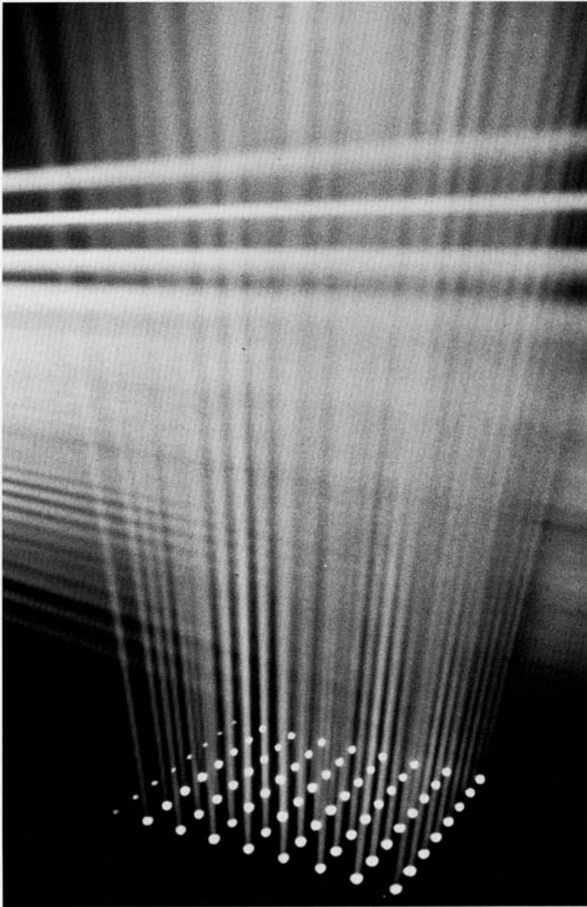
Fig. 4. Gyorgy Kepes, Simulated effects of a proposed mile-long programmed luminous wall, suggested for the Boston Harbor Bicentennial, 1964–1965 .