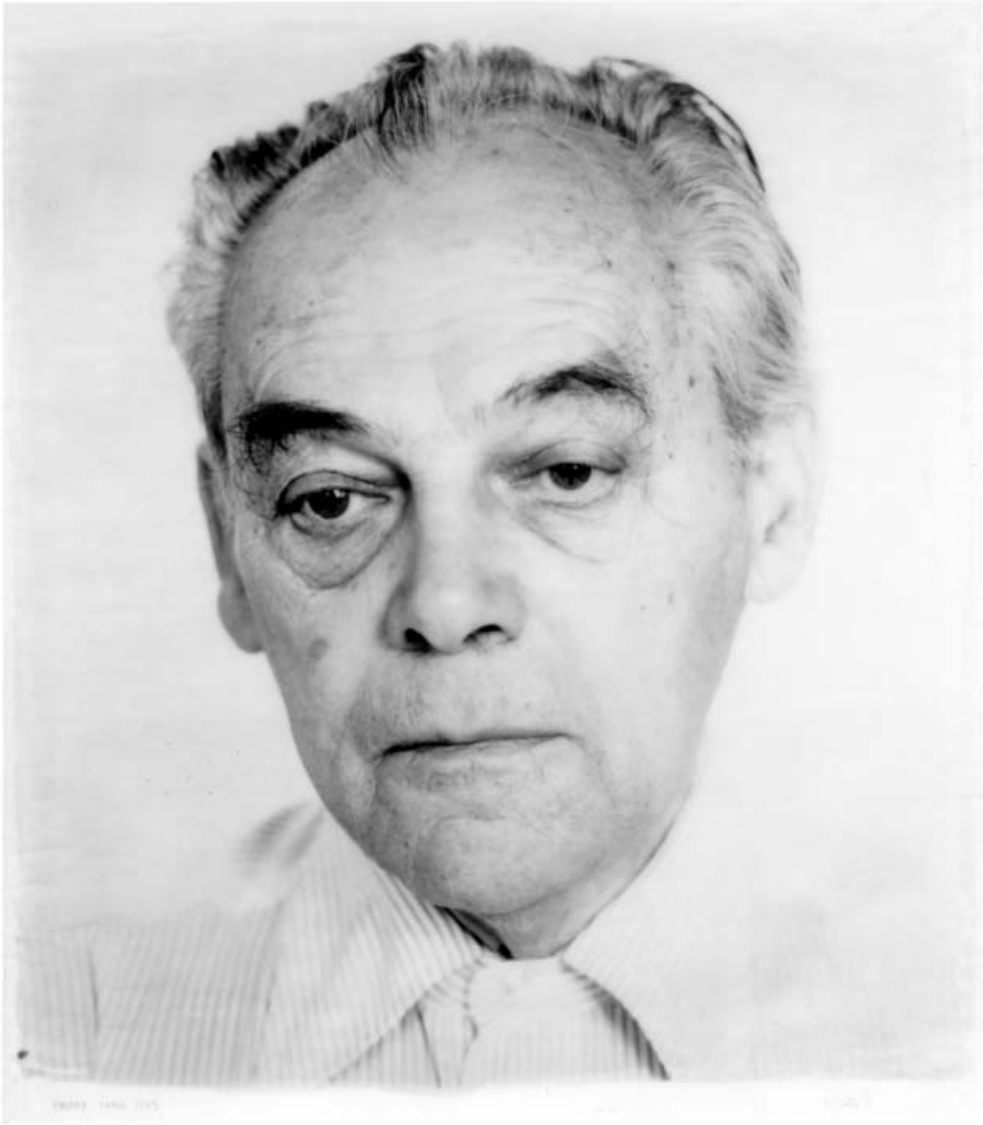
Fig. 1. Wendy Synder MacNeil, Gyorgy Kepes , 1983, platinum palladium print on vellum. National Portrait Gallery, Washington, DC. © 1983 Wendy Synder MacNeil. Photo: National Portrait Gallery.

may indeed have appeared “sudden” to contemporary observers. 1 Read superficially, Kepes’ observation, particularly his remark about the “cultural climate,” seems to imply