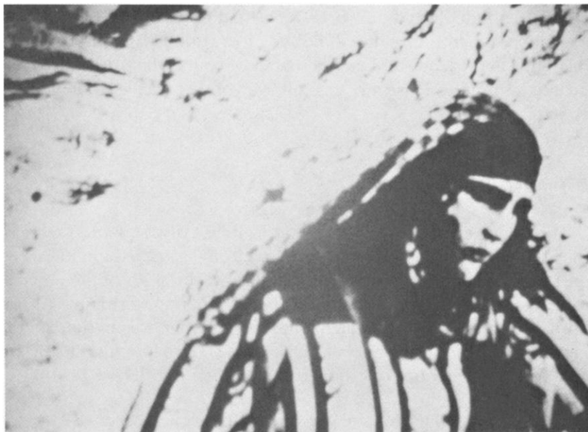
Aida, 4000 B.C.