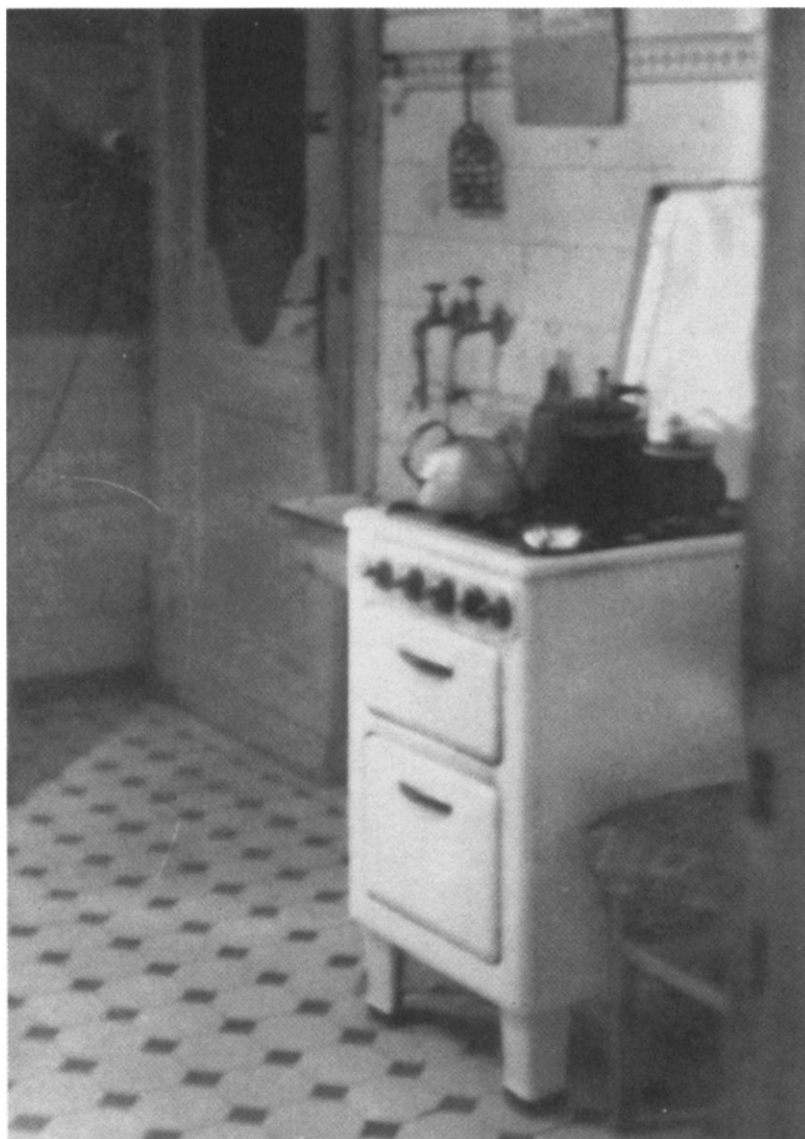
Kitchen with stove, Halberstadt, during the broadcast of the opera Carmen of 21 December 1946, Radio Leipzig.