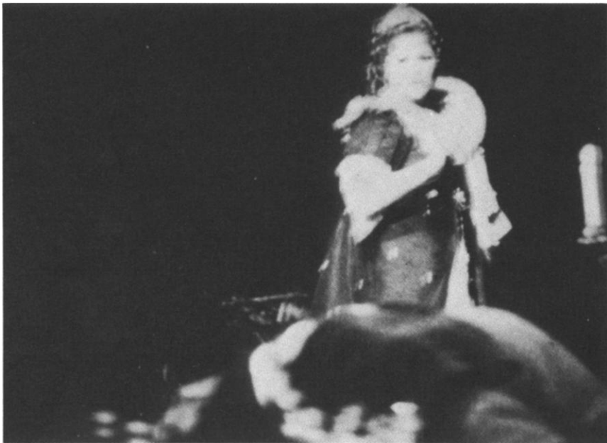
Tosca: In the foreground, police chief Scarpia, whom she has stabbed.

The police chief of Rome, Scarpia, was either at first sight a conservative of the old school, a gentleman, whose clothed body one forgot in favor of his face; an untouchable man, who becomes embroiled in an intrigue just this once by the overwhelming diva, Tosca. He wants to steal Tosca away from that horrible farmer boy, that immature mama’s boy Mario, whom she had taken for her lover merely because he had a few crude gestures at his command; this spoiled child will drop her, however, as soon as she, growing older, will be displaced by the rising diva, Ermolli, and only then will Tosca have reached a state of full bloom to which Scarpia can relate. For Scarpia, each course of action is contingent upon the need for the Vatican state somehow to prevail, and that in turn depends exclusively on that bastard Mellas leading the Austrian troops in northern Italy.