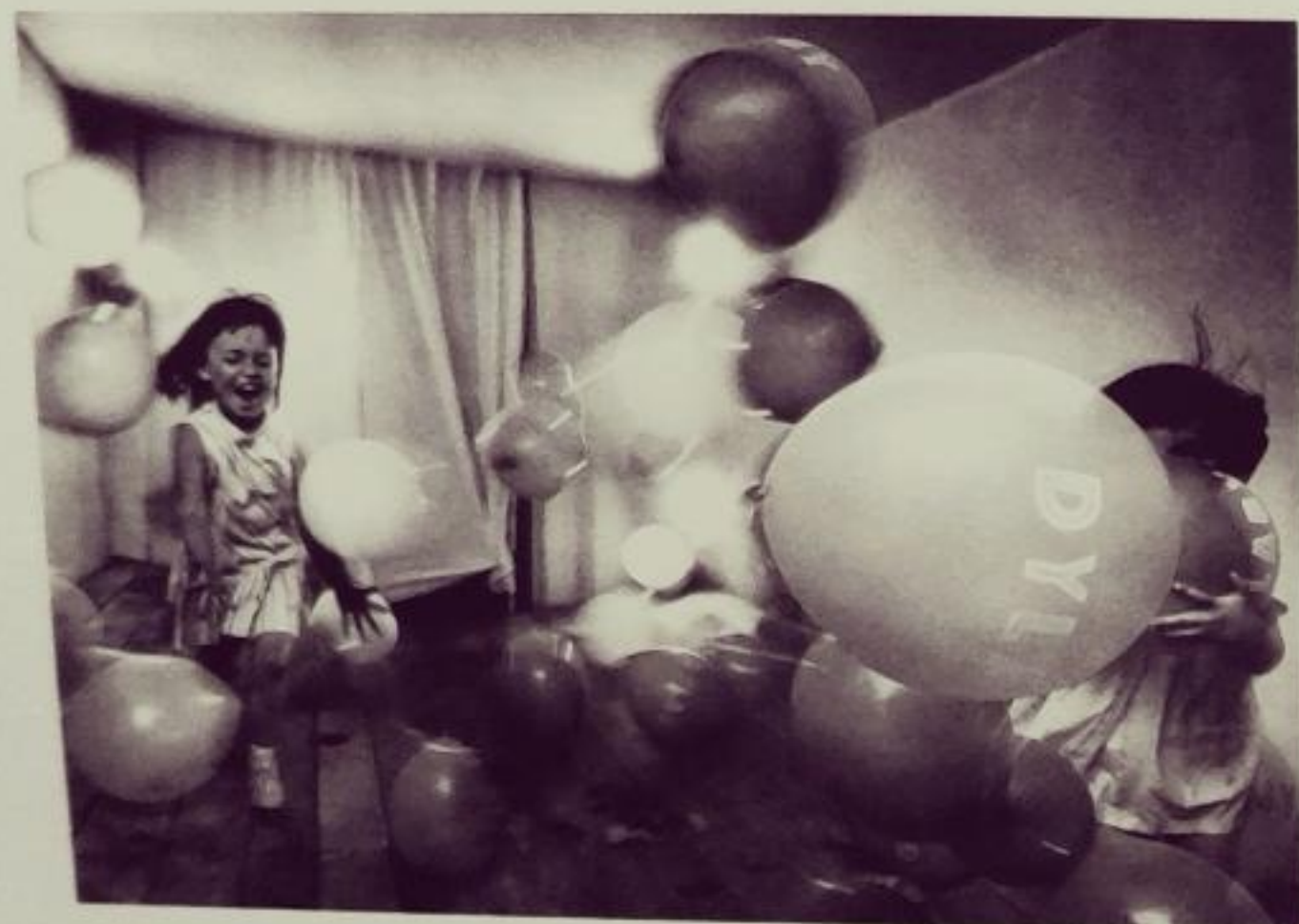
Installation view of Jean Tinguely's environment in DYLABY: DYNAMISCH LABYRINT (DYNAMIC LABYRINTH), Stedelijk Museum, August 30–September 30, 1962

Sandberg and Hultén also actively promoted American art's latest developments with shows devoted to Abstract Expressionism and Pop art—a focus that Sandberg's successor, de Wilde, pursued by hosting touring mid-career surveys dedicated to such important figures as Andy Warhol and Claes Oldenburg, in 1968 and 1970, respectively. A particularly ambitious traveling exhibition of the time began in January 1970, when the Moderna Museet presented the first comprehensive show of Edward Kienholz's series of environmental assemblages collectively known as Tableaux . Over two years the exhibition traveled, in different versions and under various titles, to five cities across Europe—Düsseldorf, Paris, Zurich, Amsterdam, and London. 3 The tour gave the artist, whose Portable War Memorial installation “dispens[ing] real live Coca Colas to the spectators” was on view, the idea that a piece made of “a six pack of bottles—one from each show—would be a nice souvenir of [his] European experiences,” as “those Coke bottles were manufactured locally with interesting things like ‘Buvez Coca Cola, Drick [sic] Coca Cola’ etc. imprinted on the glass or stamped on the caps.” 4 Kienholz's pseudo-imperialist attitude would soon become familiar to other American artists, for whom travel was becoming increasingly important in their work.