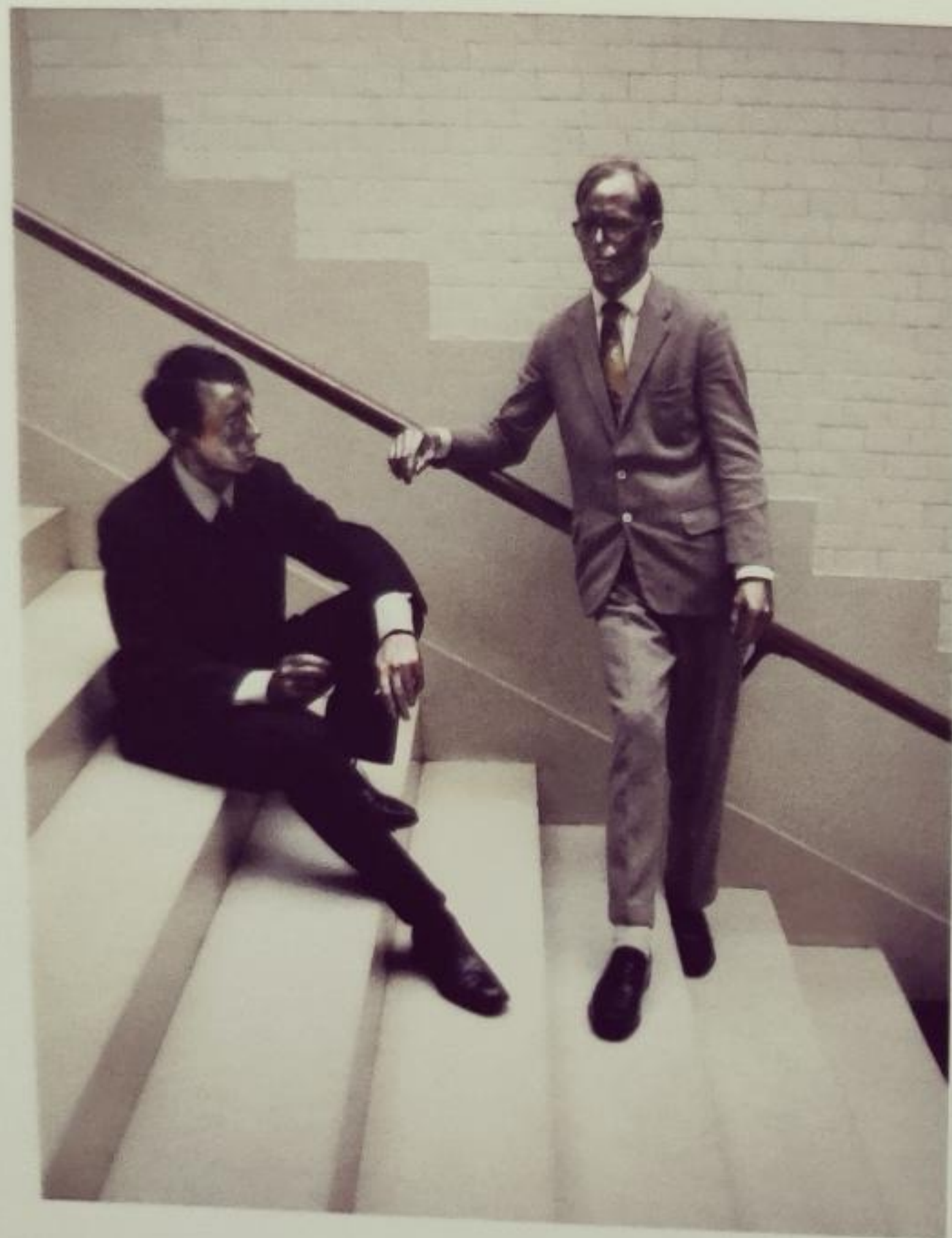
Gilbert & George. POSING ON STAIRS . Stedelijk Museum, November 22, 1969.

If most of Ader's fellow artists traveled the world extensively, their trips didn't always leave a direct imprint on the subject or form of their work. Gilbert & George, for example, gave "living sculpture" performances in such cities as London, Amsterdam, Düsseldorf, Oslo, New York, Melbourne, Tokyo, and Brussels between 1969 and 1977, quickly reaching a broad international audience. 17 On each occasion, the artists, performing in British-tailored tweed suits, were seemingly unaffected by their surroundings, appearing as if straight out of their London home on Fournier Street. Hanne Darboven, who spent two years in New York before returning to her native Germany in 1968, also developed a body of work in which external factors, such as her place of residence or the exhibition context of her art, appear to have made no visible impression. More significant for Darboven were her travels not through space, but through time, with only a calendar as a roadmap. Stanley Brouwn's work shares with Darboven's scribbled notations a sense of inner travel that keeps the outside world at bay. The viewer is never told what happens in Darboven's years, months, or days,