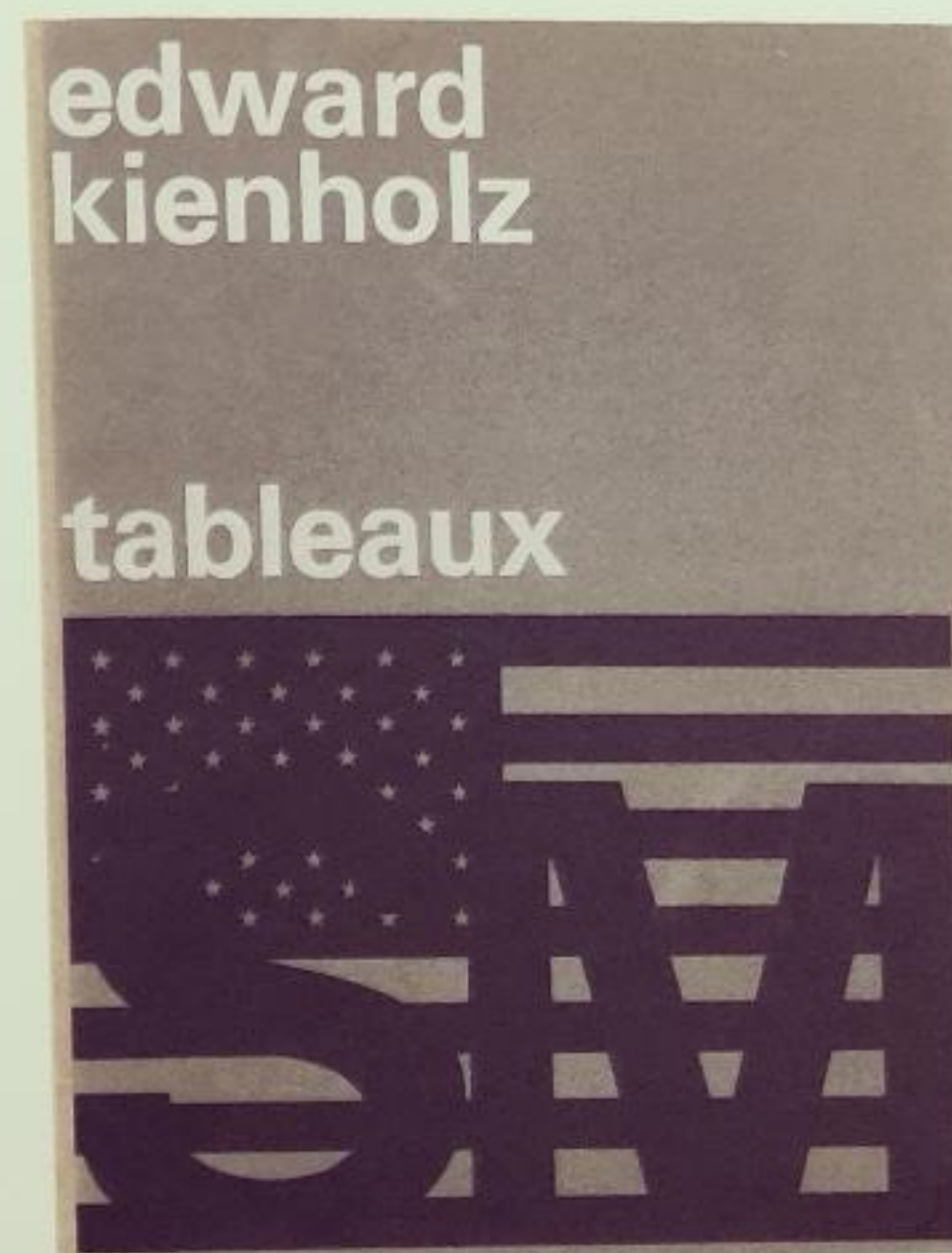
EDWARD KIENZHOLZ: TABLEAUX . Stedelijk Museum, 1970. Design: Wim Crouwel. Photolithographed exhibition catalogue, 10 1/2 x 8 3/16" (26.7 x 20.8 cm) (closed). The Museum of Modern Art Library

Indeed, as American art appeared throughout Europe, it wasn't long before artists and galleries began to emulate the new strategies of partnership that developed among museums in the 1960s and early '70s. Galleries soon formed loose networks around groups of artists, allowing them to split airfares and shipping costs by scheduling strings of shows within short time frames. As Lawrence Weiner recalls, “It was a tour. It was like playing football—it went from stadium to stadium. And the interesting thing was that there was a whole system built into it.” 5 Another Conceptual art pioneer, Robert Barry, made a piece solely based on this “system.” For Invitation Piece , 1972–73, he asked eight of his dealers to announce, in turn, an exhibition of his work in a successive gallery. The first card read: “Paul Maenz [Cologne] invites you to an exhibition by Robert Barry at Art & Project, Amsterdam, during the month of November 1972.” In November, Art & Project issued a second card announcing a show by Barry the next month in London, at Jack Wendler Gallery. The process continued until Gian Enzo Sperone brought it full circle by sending out an invitation to an exhibition opening in June 1973 at Paul Maenz Gallery. 6