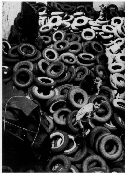
2 • Allan Kaprow, Yard , 1961

Between this embryonic stage and the first fully fledged public happening, 18 Happenings in 6 Parts , nothing fundamentally changed but the structure got more complex. For this event, which