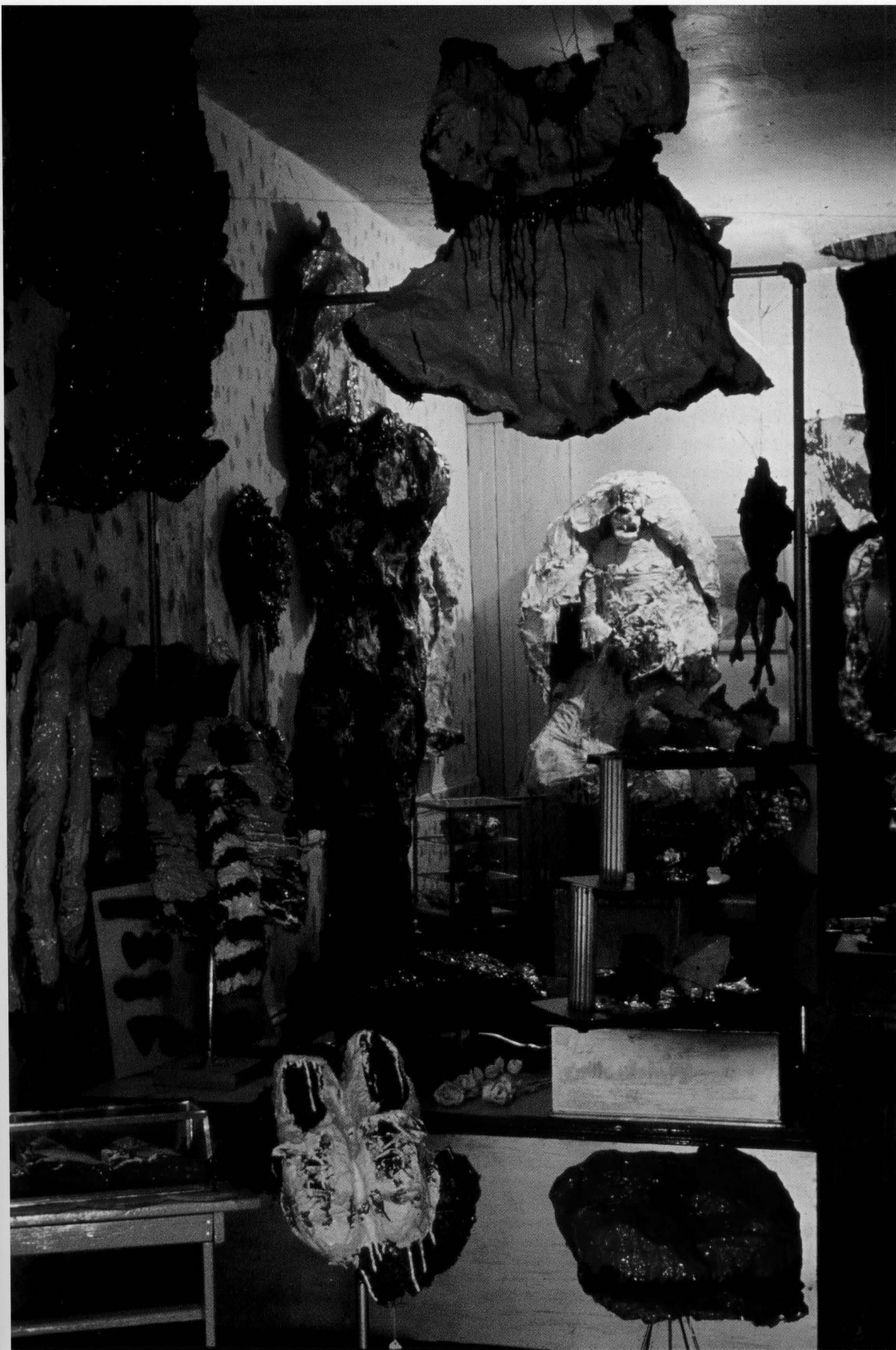
1 • Claes Oldenburg, interior of The Store , 107 East 2nd Street, New York, December 1961