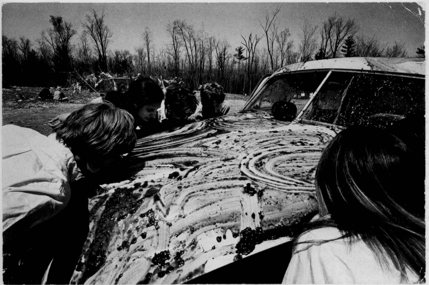
3 • Allan Kaprow, Household , 1964 Happening

Such impermanence became a key element of Kaprow's concept (after the initial experience of 18 Happenings in 6 Parts , he often stated that happenings should never be repeated in order to preserve what he deemed their most important quality, their immediacy, their "suchness," as he called it). This has little to do with any interest in spontaneity (happenings were scripted and rehearsed, no matter how aleatory their structure), but with a somewhat naive belief, derived from Cage's Zen-like philosophy, that uniqueness as such was a guarantee of "presence," and that "presence" as such, when thought of as a natural process, was a guarantee against the blatant commodification of all things that characterized the postwar consumerist society.