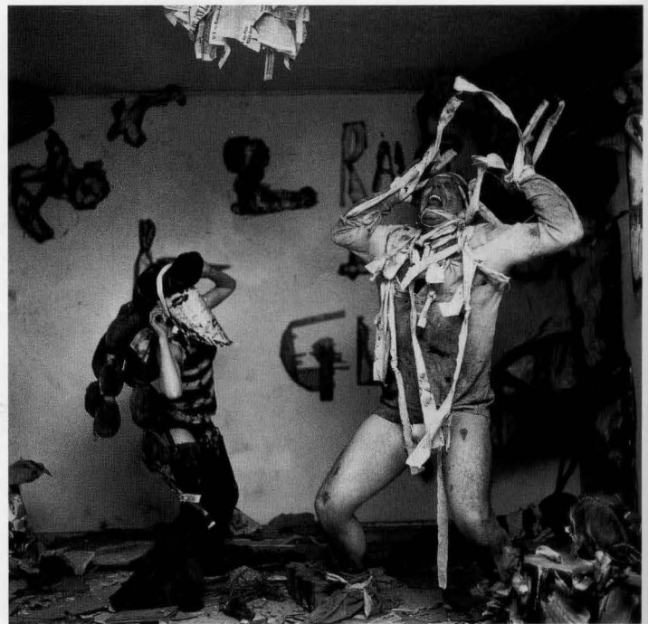
4 • Claes Oldenburg, Snapshots from the City , 1960 Performance at Judson Gallery, Judson Memorial Church, New York

What was left over from this fake yardsale was installed as a much sparser version of The Street in the Reuben Gallery in May 1960, after which Oldenburg retreated to the country for the summer. It is there, while reflecting upon his dissatisfaction with the second, clean, version of The Street in a typical modernist "white cube," that he fully elaborated his concept of the Ray Gun, particularly its ubiquity: any object shaped in a right angle, even a blunt one, can be a Ray Gun, which, in a humorous appropriation of Mondrian's phrase, Oldenburg crowned with the title of "universal angle." "Examples: Legs, Sevens, Pistols, Arms, Phalli—simple Ray Guns. Double Ray Guns: Cross, Airplanes. Absurd Ray Guns: Ice Cream Sodas. Complex Ray Guns: Chairs, Beds." In short, just as gold had for long functioned as the standard of monetary circulation, the Ray Gun was a "general equivalent," the empty sign through which all kinds of things could be compared and exchanged. Although it