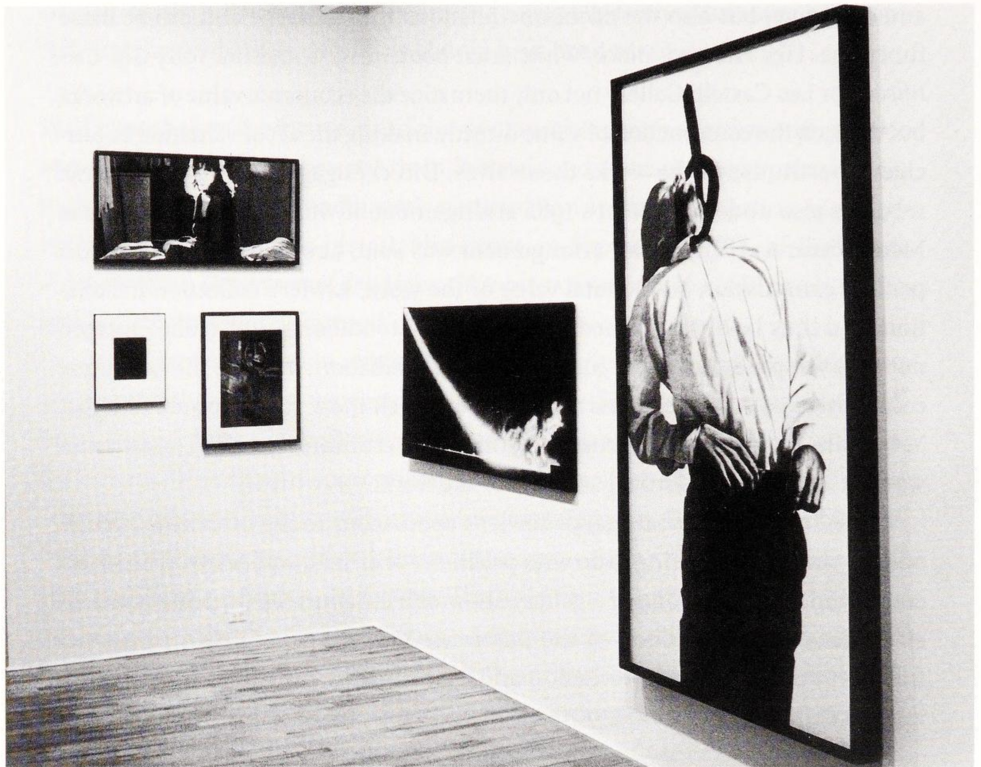
6.3 Louise Lawler, installation view of an arrangement of works by gallery artists at Metro Pictures, New York, 1982.