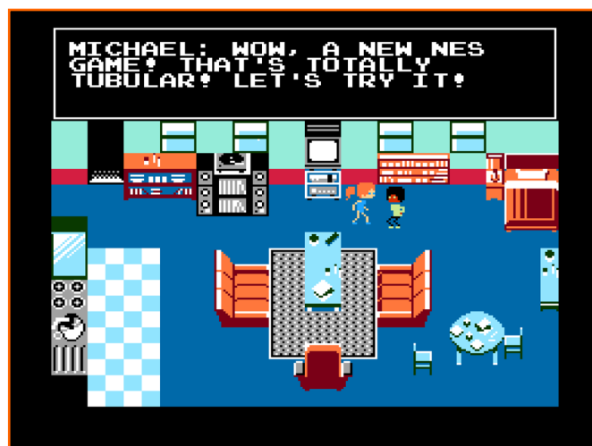
Fig. 2. Still from What remains , "Wow a new NES game!". Hoorn: Iodine Dynamics.