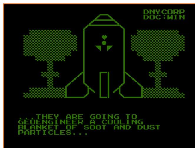
Fig. 9. Still from What remains , "They are going to geoengineer a cooling blanket of soot and dust particles...". Hoorn: Iodine Dynamics.

In the game DNYCorp is distracting people with an epic yet fake alien invasion. The solution they propose is to attack the aliens with nuclear weapons. This will, not coincidentally, generate a nuclear winter, cooling the earth, neutralizing the effects of global warming so people can continue to burn the fossil fuels offered by DNYCorp. The company proposes a technical solution – geoengineering – using the nuclear winter theory, while simultaneously distracting from the cause of the problem. This part of the game is based on the same paper Russell Seitz attacked to defend Reagan's SDI. The TTAPS paper, named after its authors, drew attention to the second order effects of a nuclear attack, the dramatic drop in Earth's surface temperature for a period of weeks to months due to atmospheric dust, causing crop failure (Turco et al. 1983). The infrastructure put in place to promote