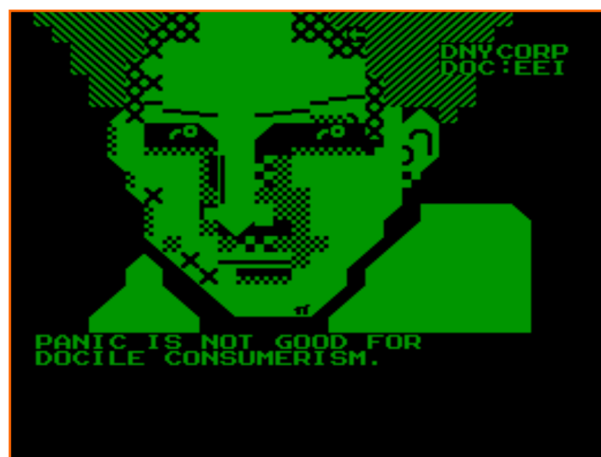
Fig. 5. Still from What remains , “Panic is not good for docile consumerism”. Hoorn: Iodine Dynamics.