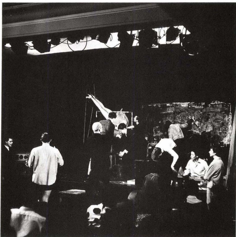
Simultaneous Performance at Neo-Dada in der Musik, Dusseldorf (1962).