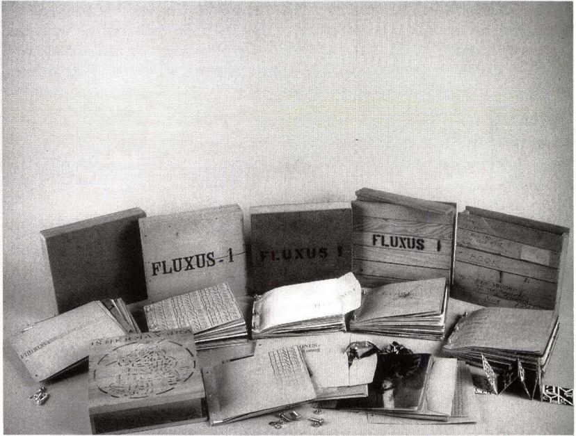
Fluxus I, various examples (circa 1964-1978), The Gilbert and Lila Silverman Fluxus Collection, Detroit.