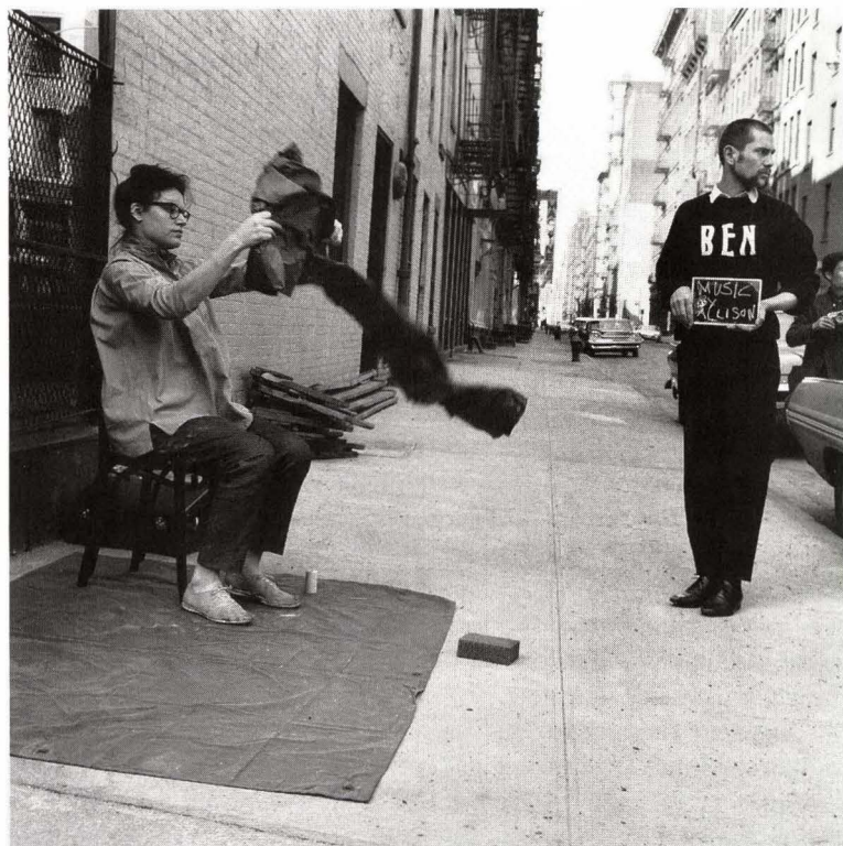
Alison Knowles performing Music by Alison (with Ben Vautier), during the Flux Festival at Fluxhall, "Street Events" NYC, May 23, 1964.