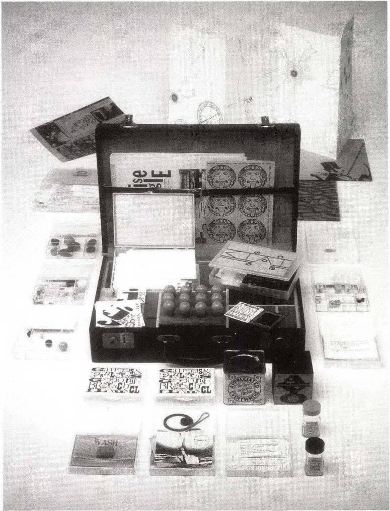
Fluxkit (1964; this example 1966), vinyl case with mixed media. 12 x 17 x 5 overall. Photo courtesy of the Walker Arts Center. Courtesy of the Gilbert and Lila Silverman Fluxus Collection, Detroit.