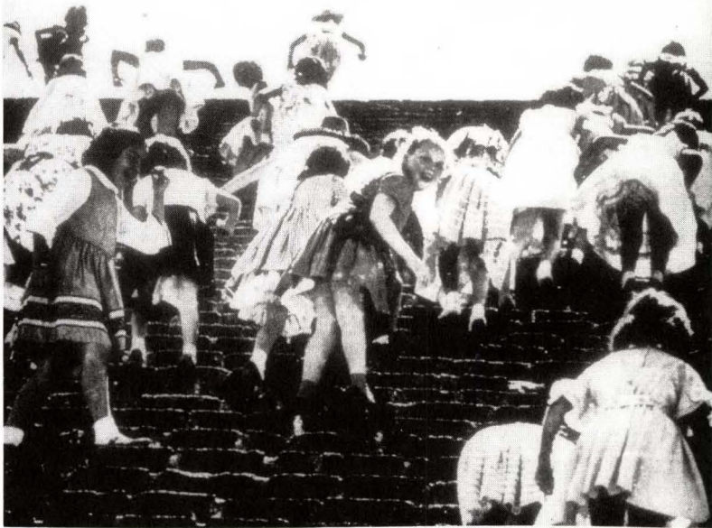
Free Flux Tours (1976), offset black on white paper, designed by George Maciunas.