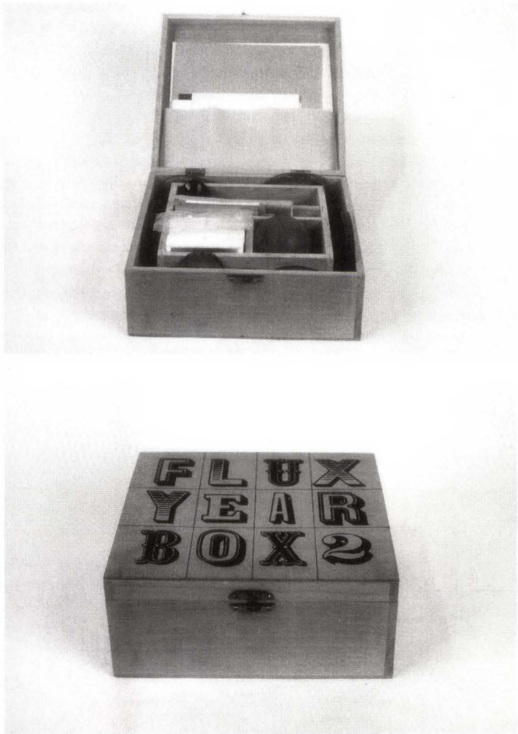
Flux Year Box 2 (1966; this example 1968), wood box with mixed media, 8 x 8 x 3 3/8.