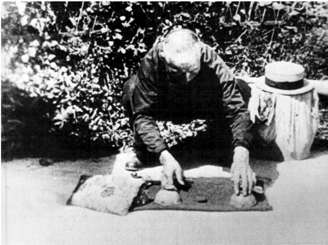
The Man with a Movie Camera