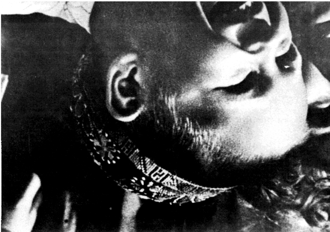
The Man with a Movie Camera