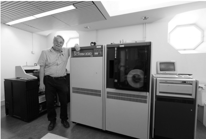
Fig. 2. DEC-2020 computer “Nadja,” used extensively for up to thirty parallel students’ interactive development and running of Simula programs 1979–88. It was revived 2010, started at first effort, here with the proud author. Historically important as the first mainframe academic computer owned (and run) by a department (NADA, KTH) and not by the six centralized computer centers, one in each university region in Sweden.

When the personal workstation revolution came in 1984, we moved some courses with Simula in computer science, programming, graphics, and interaction over to the Macintosh that survived until 1997, thereby abandoning the DEC computers in 1988. Developments and experiences in this area appear in [28–30].