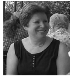
Fig. 3. Alan Kay & Adele Goldberg

Then there was Simula, which the designers thought of as an extension of Algol. It was basically a preprocessor to Algol the way C++ was a preprocessor for C. It was a great concept and I was lucky enough to see it as almost a new thing. ... If you combine Simula and Lisp – Lisp didn't have data structures, it had instances of objects – you would have a dynamic type system that would give you the range of expression you need. ... It is not too much of an exaggeration to say that most of my ideas from then on took their roots from Simula – but not as an attempt to improve it. It was the promise of an entirely new way to structure computations that took my fancy. As it turned out, it would take quite a few years to understand how to use the insights and to devise efficient mechanisms to execute them.