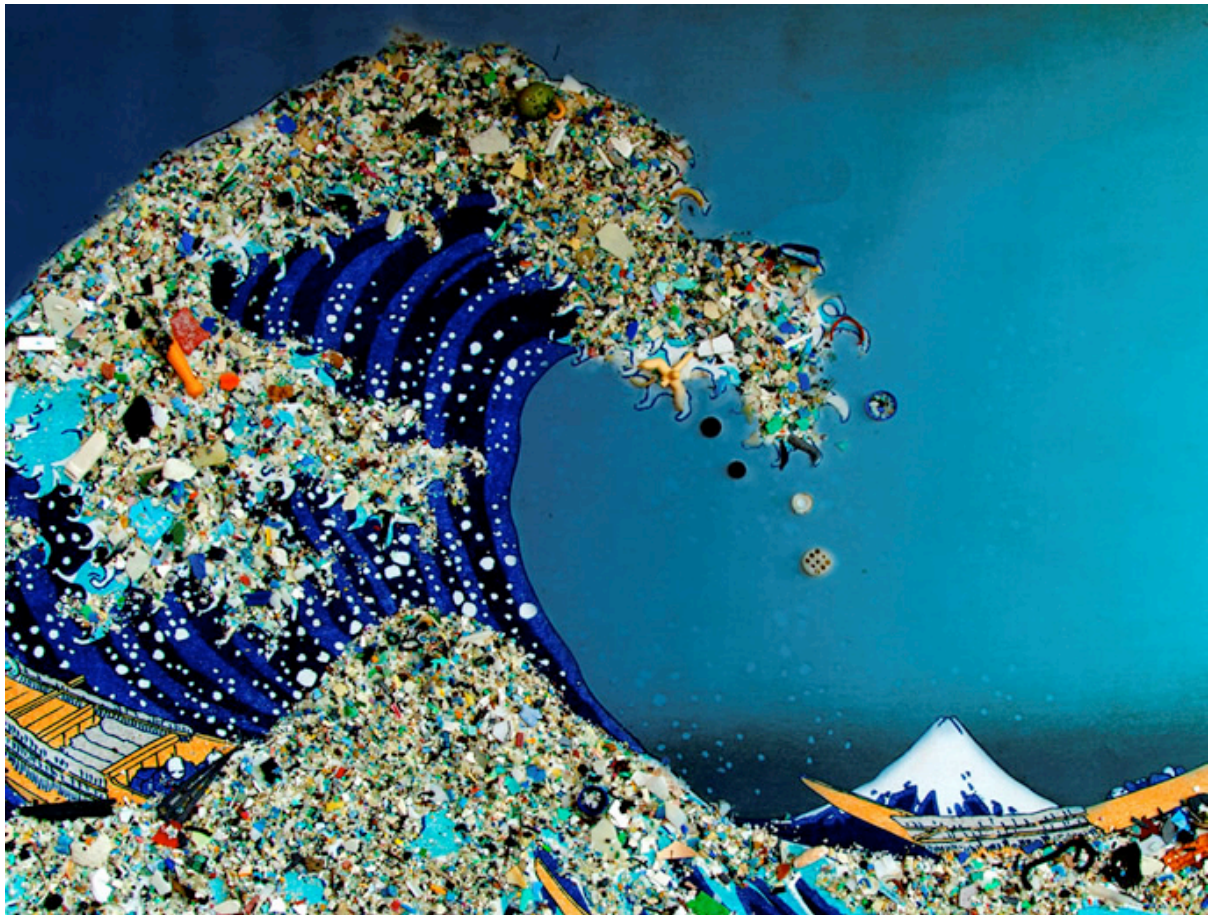
Figure 8. Bonnie Monteleone, Plastic Ocean: In Honor of Captain Charles Moore , from the What Goes Around Comes Around collection, 2011, trash. Copyright Bonnie Monteleone. Reproduced with Permission.

Figure 8 is a photo of an image made with actual trash pasted onto a surface.