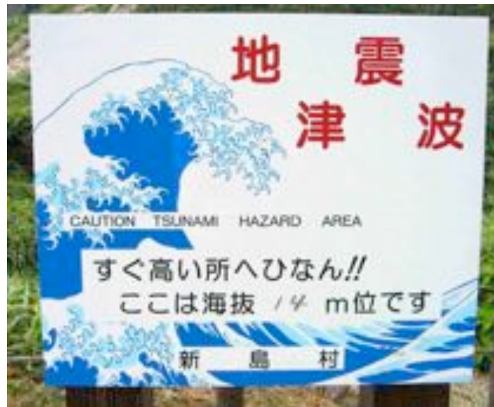
Figure 3. Tsunami warning sign, Niihima, Japan.

Not everyone has been sanguine about this appropriation. Earth and Ocean scientists in particular have been adamant that Hokusai's wave not be mistaken for a tsunami. Tsunamis do not feature cresting troughs, but arrive rather as encroaching floods. Just because the word tsunami is Japanese and the woodcut is Japanese, they emphasize, does not mean the Wave represents a tsunami. 12