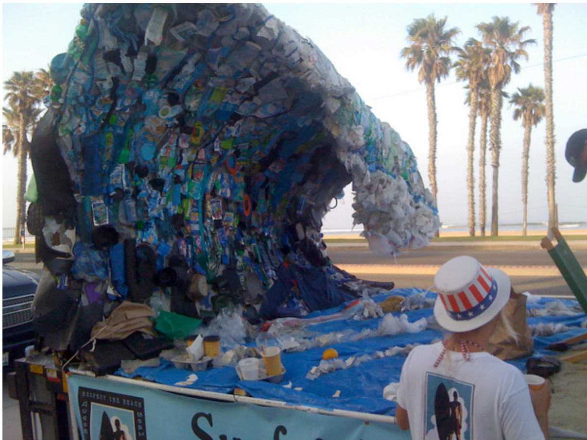
Figure 6. Andre Faubert, Huntington Beach Fourth of July Parade Float, 2011 , 580 pounds of refuse from the shores of Huntington Beach, California.

As one example, take Figure 6, a 2011 parade float from Huntington Beach, California, made of trash collected from that beach, a float that has Hokusai's print as one obvious reference.