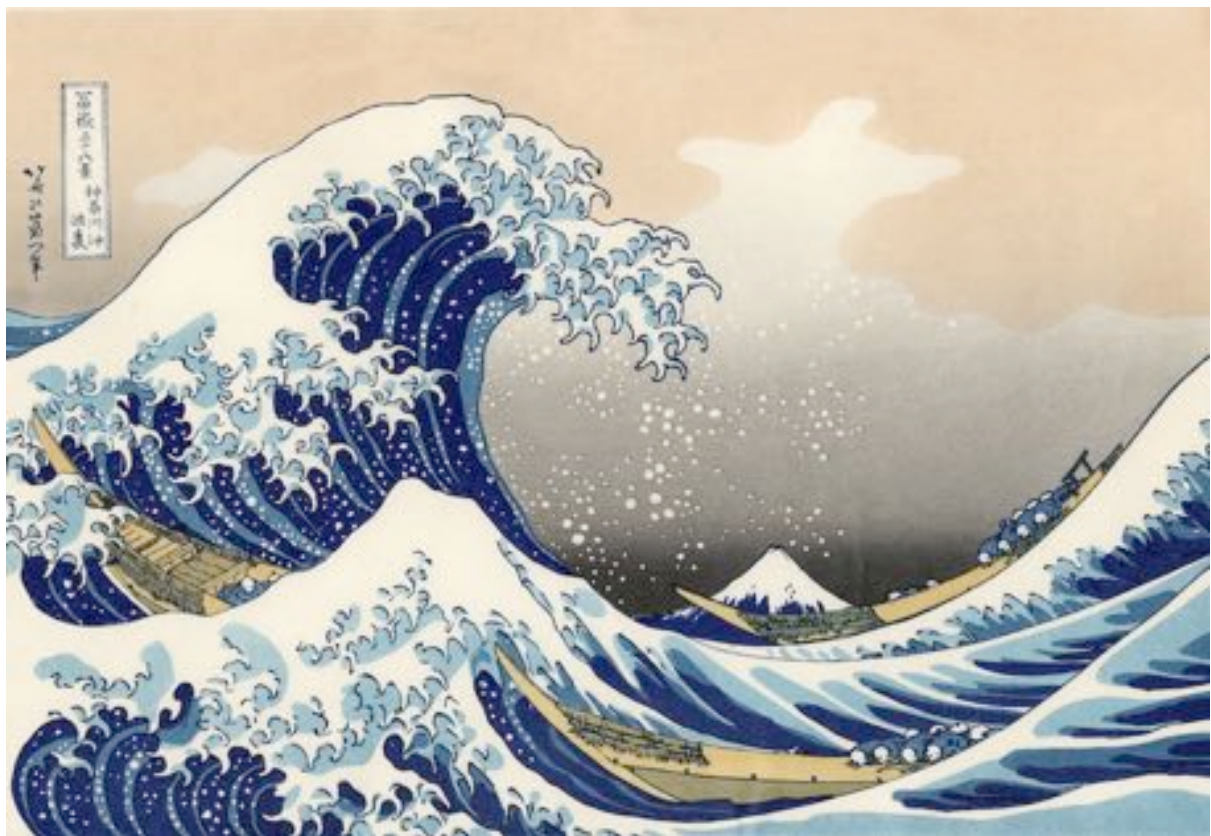
Figure 1. Katsushika Hokusai, Under a Wave at Kanagawa , c. 1829, woodblock print

My examination of recent avatars of the Hokusai figure builds on art historian Christine Guth’s Hokusai’s Great Wave: Biography of a Global Icon , the essential account of the worldwide history and travel of the Wave image. Guth brilliantly examines the mutating social life of Hokusai’s image, from its production in late-Edo Japan to its emergence as a French, Euro-American, and then global signifier of all things Japanese; from its work in Japanese nationalism to its play in circuits of commodity capitalism; from its status as a shorthand for international high art to its popular manifestation as a lifestyle brand (think surfing); and from its early conscription into classical Western aesthetics of the sublime to its increasing association with looming global environmental disaster. 6 The commentary I offer here—really just a footnote to Guth’s definitive book—examines how artists are today rematerializing Hokusai’s Wave so that they might call attention to the beleaguered life of the sea in the age of a toxic and trashed modernity.