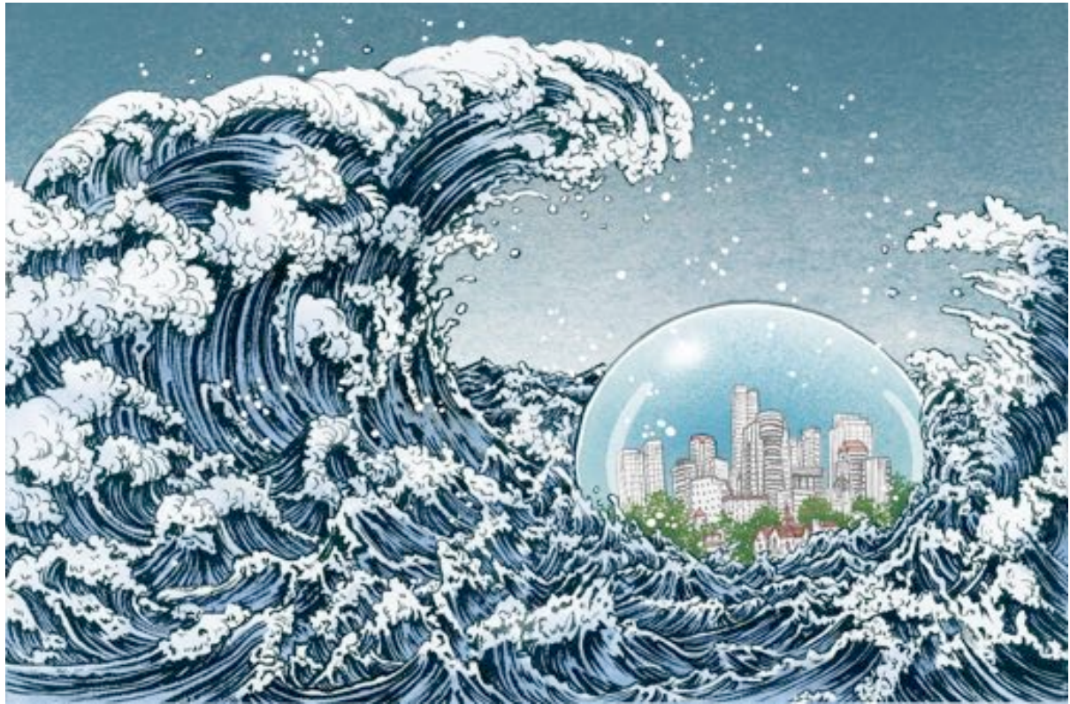
Figure 4. Yoko Shimizu, illustration for Michael Cockram, "Bracing for Climate Change," Green Source Magazine , January/February 2013. Copyright Yoko Shimizu http://yukoart.com/blog/climate-change-and-the-city , blog entry, February 11, 2013. Reproduced with Permission.