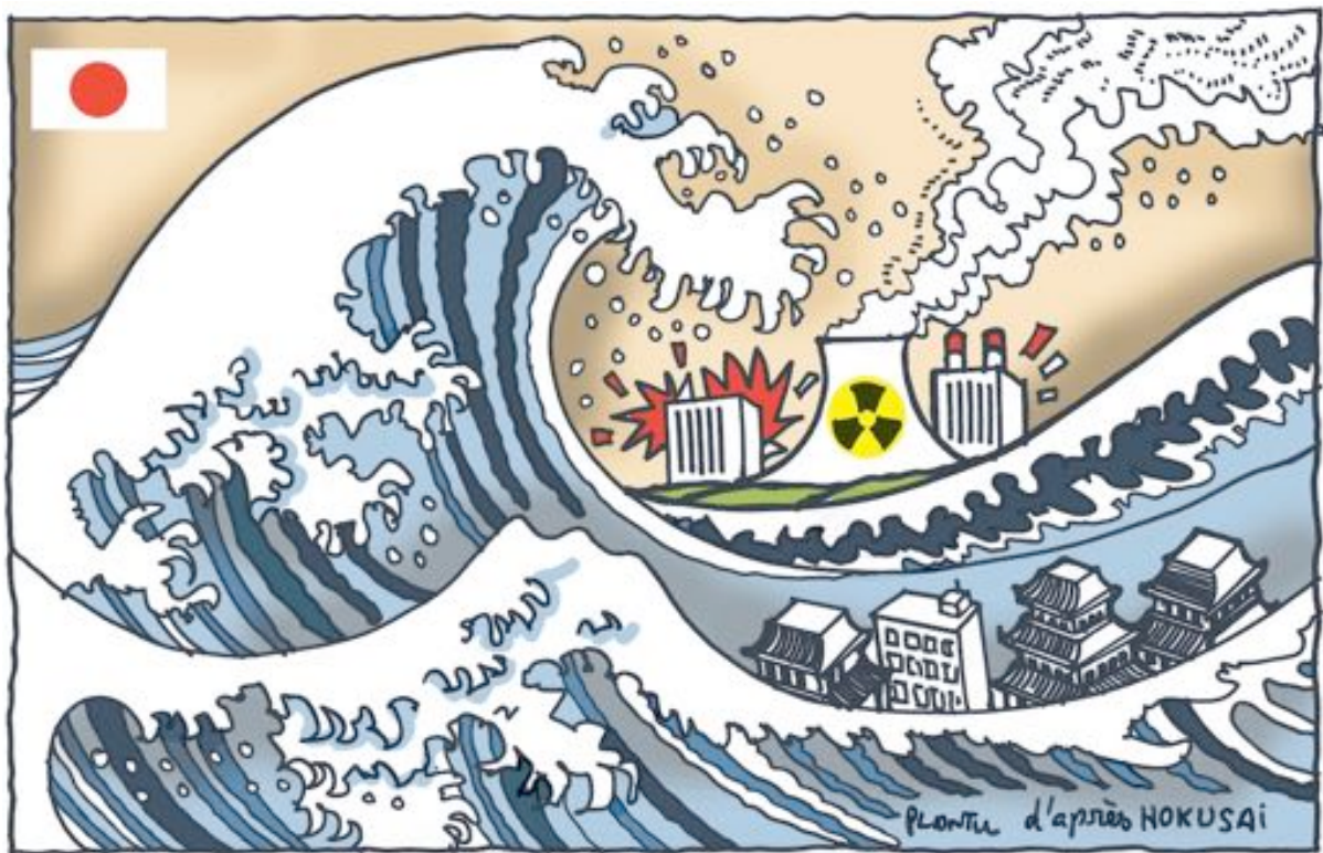
Figure 2. Dessin de Plantu, d'après Hokusai, Le Monde , 15 mars 2011. Reproduced with Permission.

more—and operates as something of a call to arms. It now no longer jeopardizes only the small fishing boat in the image, but also a wider translocal polity. It operates as a harbinger of danger to/for the viewer, who is addressed as a person caught up in a world in which catastrophe is globalized. In some ways, this leverages earlier habits of viewing toward new purposes; Guth writes, “the vantage point adopted in ‘Under the Wave off Kanagawa’ erases the boundaries between subject and object, transforming the viewer into a participant in this watery drama;” 11 the participant nowadays becomes the environmentally freaked out citizen. No surprise that, in the aftermath of the 2011 tsunami, the Wave was reactivated to speak, in a range of editorial cartoons, to that disaster (Figure 2), even sometimes being used as an icon for warnings in tsunami zones (Figure 3).