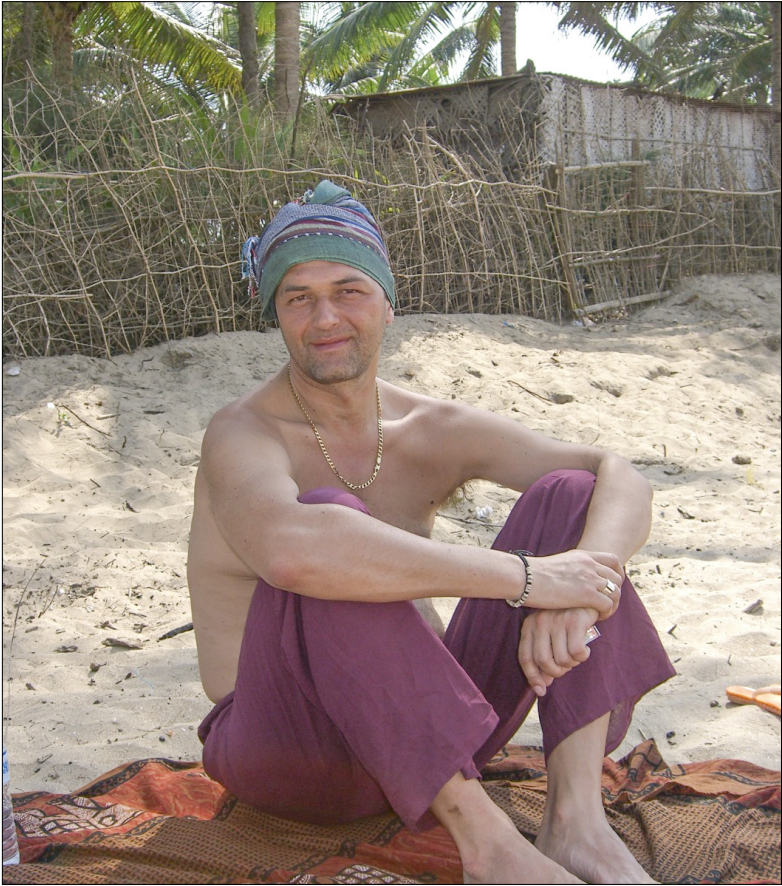
South India, Kerala, Dec 2006 / Jan 2007