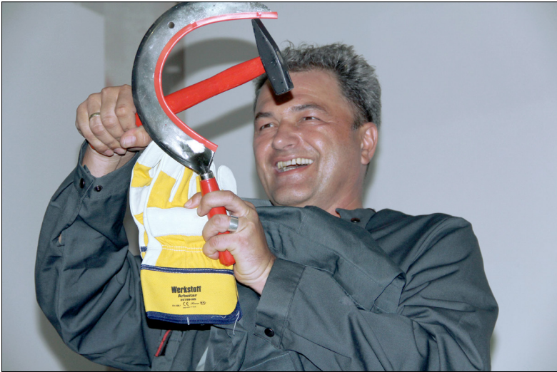
50th Birthday Party, Vienna, September 16, 2012