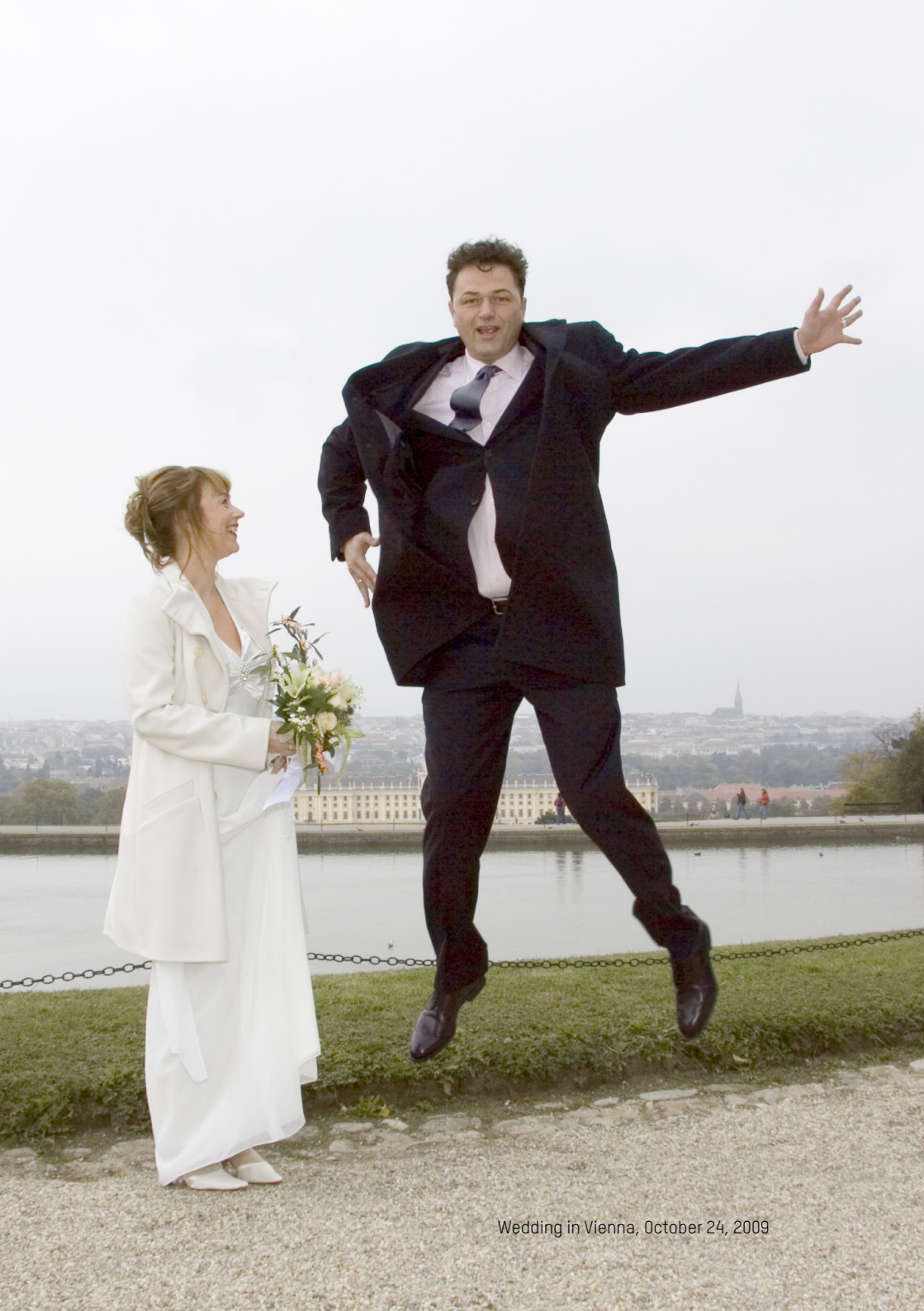
Wedding in Vienna, October 24, 2009