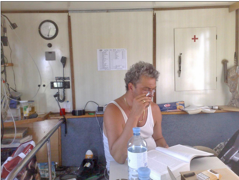
Freies Symposium auf der Eleonore, Linz 2012