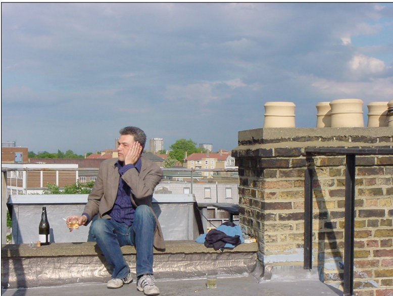
Andrews Road, London, May 2005