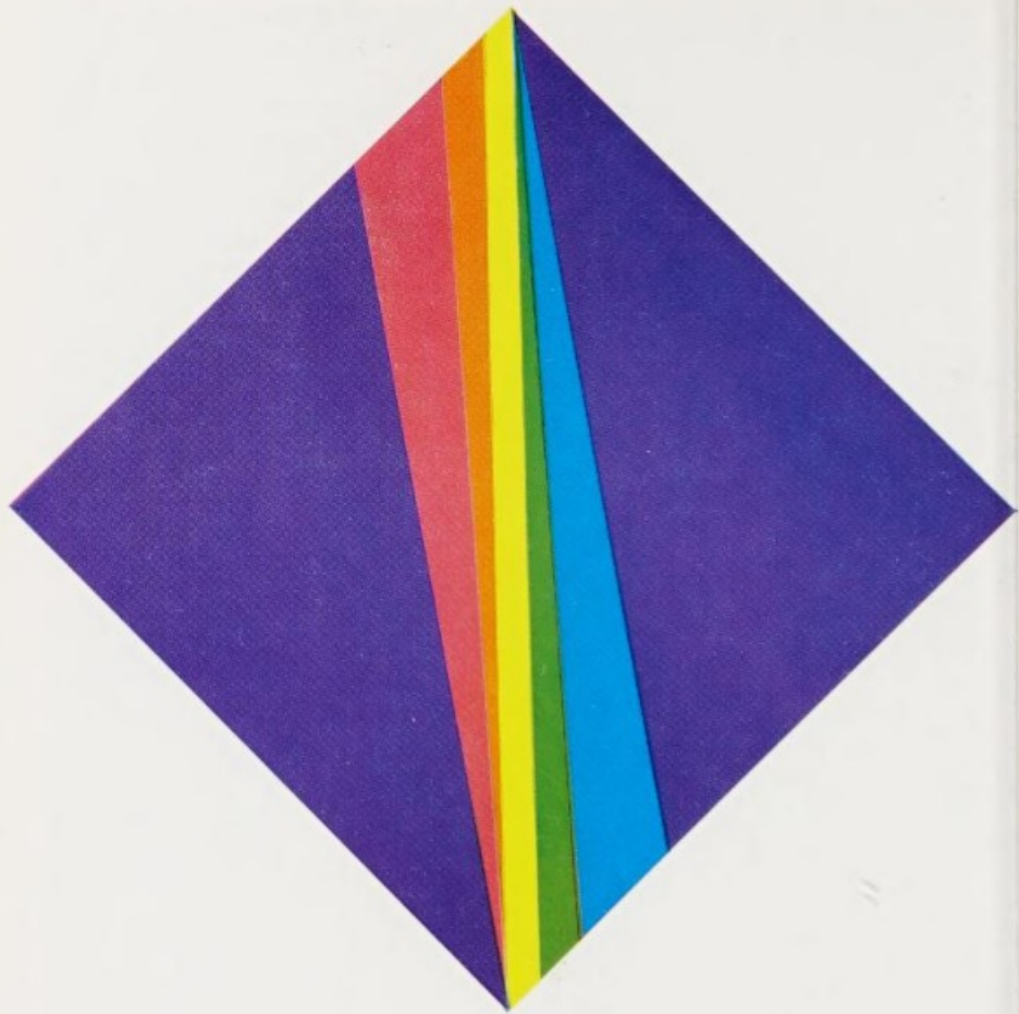
19 verdichtung von violett zu gelb condensation from violet to yellow . 1964–65