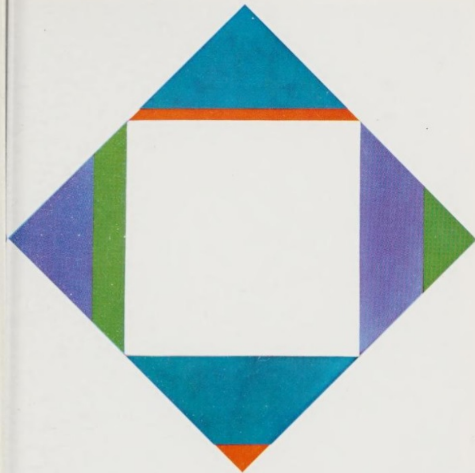
12 vier farbpaare um weisses zentrum four colour pairs around white center . 1961

the geometric figures like squares, rectangles, triangles, etc., which appear in the painting of max bill represent classes of such figures, and must therefore be understood as object-related icons. the arrangement of such figures