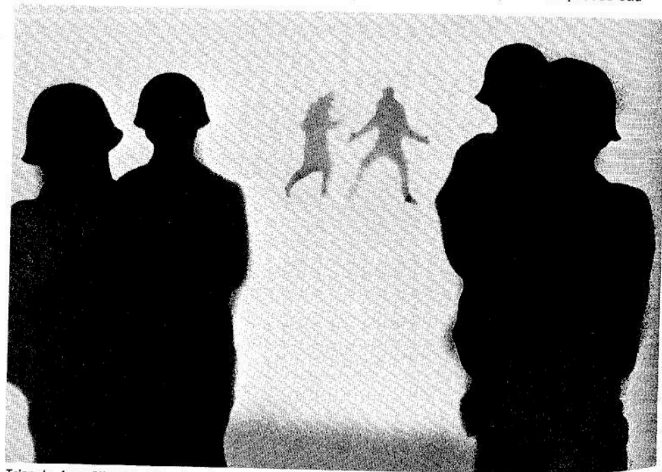
Triangle, from Silencio, Silencio suite, by Juan Genovés, 19¾ x 26", etching, 1970.

We may fairly conclude that where the vocations of the artist and the politician seem to collide, a heavy responsibility rests on the politician—the powers he wields need no description—to reach some kind of accommodation, not with a censorship, but with the artists. Given sufficient planning and discussion, a dialogue can be created. Not a tame one—but communication, which will minimize misunderstandings if not tension. The more the politician proves cau-