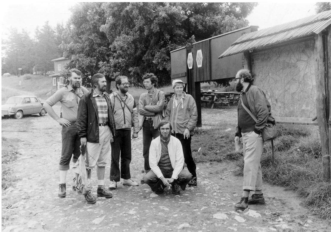
Július Koller, 'Universal Fictive Orientation (U.F.O.) 3', 1978, 3 b/w photograph, image: courtesy Květa Fulierová), Július Koller Society

and randomly selected partners. They were transcribed in typewritten form on sheets of paper in 1969–1970. One of the recurring motifs is the triangle of performer–instrument–public: