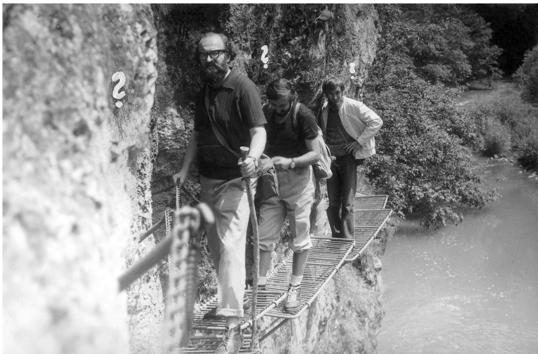
Július Koller, 'Universal Fictive Orientation (U.F.O.) 1', 1978, b/w photograph, image: courtesy Květa Fulierová), Július Koller Society