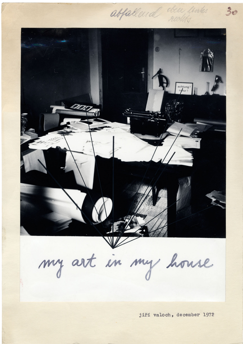
Jiří Valoch, My Art in My House , 1972, marker, b/w photograph, typewriter text, paper, 29.7 cm x 21.2 cm, Marinko Sudac Collection