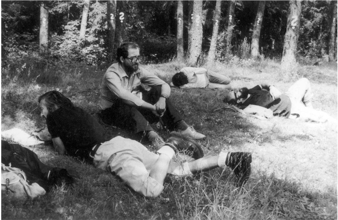
Július Koller, 'Universal Fictive Orientation (U.F.O.) 2', 1978, 3 b/w photograph, image: courtesy Květa Fulierová), Július Koller Society

pool, where the water united the performers with the public. Wearing diving goggles and carrying oxygen cylinders and violins, the musicians dived to the very bottom of the pool, followed by curious members of the audience, some of whom also used diving gear. The last of the series of documentary photos shows the enthusiastic applause of the participants, while in the background swimmers look on from a distance and another group of students are leaving the swimming pool area. What cannot be conveyed by the photographs are the acoustic qualities of the covered swimming pool area with its natural echoes bouncing off the water surface and the smooth tiles. These specific qualities of the chosen space unquestionably played their part in the happening. It is well known how significantly Cage's work influenced the artists associated with the Fluxus movement, and in this connection we may be reminded of the so-called 'event' scores by George Brecht, Yoko Ono and Mieko (Chieko) Shiomi.