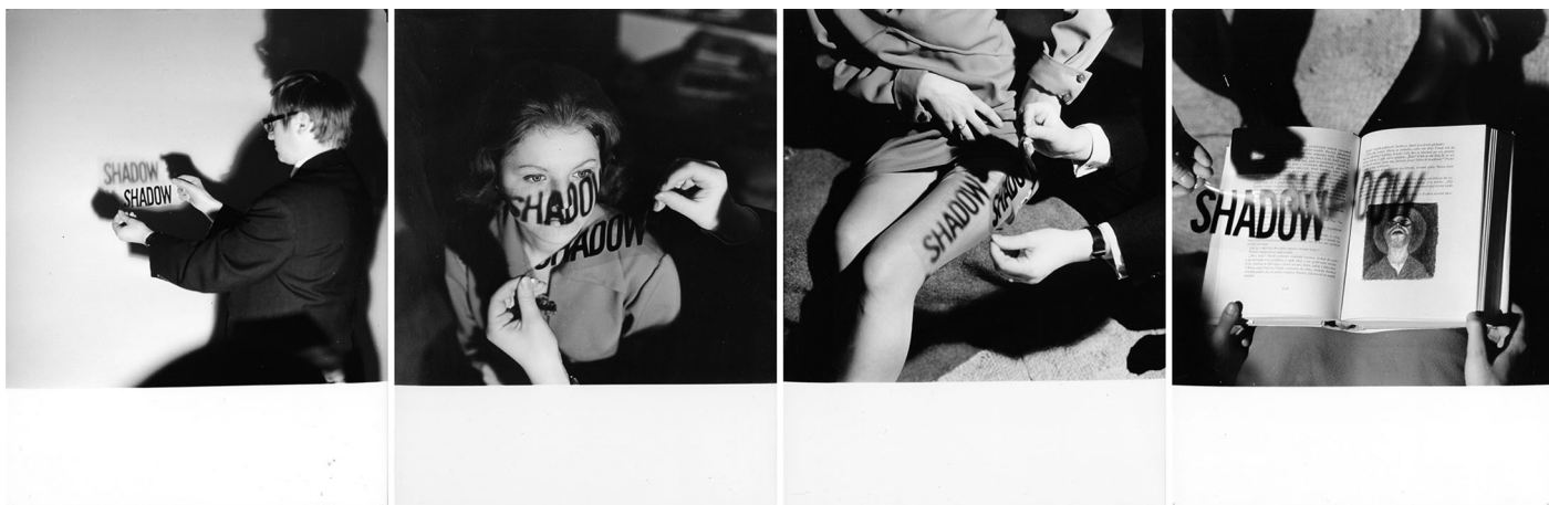
Jiří Valoch, 'Shadow Event', 1971, 4 x b/w photographs, 4 x (23.9 cm x 18.1 cm), Marinko Sudac Collection