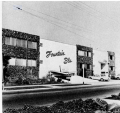
6565 FOUNTAIN AVE.