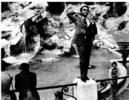
Douglas Huebler; Duration Piece #7, Rome, March 1973 (detail), 1973; 14 black-and-white photographs and statement; overall dimensions 39 1/4 x 32 1/2 in. (99.7 x 81.9 cm) framed; courtesy Darcy Huebler

Hovering behind all tendencies toward reductivism was the shadow of this great “reduction.” The experimentation with the “anaesthetic,” with “the look of non-art,” “the condition of no-art,” or with “the loss of the visual,” is in this light a kind of tempting of fate. Behind the Greenbergian formulae, first elaborated in the late 1930s, lies the fear that there may be, finally, no indispensable characteristics that distinguish the arts, and that art as it has come down to us is very dispensable indeed. Gaming with the anaesthetic was both an intellectual necessity in the context of modernism, and at the same time the release of social and psychic energies which had a stake in the “liquidation” of bourgeois “high art.” By 1960 there was pleasure to be had in this experimentation, a pleasure, moreover, which had been fully sanctioned by the aggressivity of the first avant-garde or, at least, important parts of it.