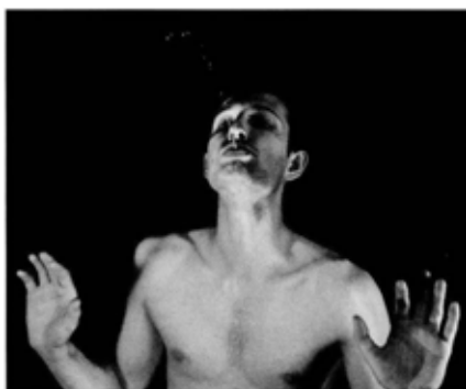
Bruce Nauman, Self-Portrait as a Fountain , 1966–1967/1970 (under cat. no. 106)