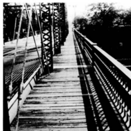
Robert Smithson, The Bridge Monument Showing Sidewalks , 1967, from Monuments of Passaic (cat. no. 173)

Graham’s Homes for America (1966–67) has taken on canonical status in this regard. Here the photo-essay format so familiar to the history of photography has been meticulously replicated as a model of the institution of photojournalism. Like Walker Evans at Fortune , Graham writes the text and supplies the pictures to go along with it. Homes was actually planned as an essay on