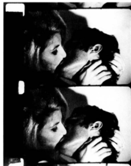
Andy Warhol: K/SS , 1963; film still, black-and-white, silent; The Andy Warhol Museum: Founding Collection

of deconstructive radicalism—expressed in ideas like “the conditions of no art,” and “every man is an artist”—could be applied to photography primarily, if not exclusively, through the imitation of amateur picture-making. This was no arbitrary decision. A popular system of photography based on a minimal level of skill was instituted by George Eastman in 1888, with the Kodak slogan, “you push the button; we do the rest.” In the 1960s, Jean-Luc Godard debunked his own creativity with the comment that “Kodak does 98 percent.” The means by which photography could join and contribute to the movement of the modernist autocritique was the user-friendly mass-market gadget-camera. The Brownie, with its small gauge roll-film and quick shutter was also, of course, the prototype for the equipment of the photojournalist, and therefore is present, as a historical shadow, in the evolution of art-photography as it emerged in its dialectic with photojournalism. But the process of professionalization of photography led to technical transformations of small-scale cameras, which, until the more recent proliferation of mass-produced SLRs, reinstated an economic barrier for the amateur that became a social and cultural one as well. Not until the 1960s did we see tourists and picnickers sporting Pentaxes and Nikons; before then they used the various Kodak or Kodak-like products, such as the Hawkeye, or the Instamatic, which were little different from a 1925-model Brownie. 10