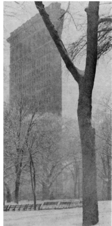
Alfred Stieglitz; The Flatiron Building , 1902–1903; gelatin silver print; 6 1/16 x 3 1/4 in. (17 x 8.3 cm); The J. Paul Getty Museum, Los Angeles

In this process, photography elaborates its version of the Picture, and it is the first new version since the onset of modern painting in the 1860s, or, possibly, since the emergence of abstract art, if one considers abstract paintings to be, in fact, pictures anymore. A new version of the Picture implies necessarily a turning-point in the development of modernist art. Problems are raised which will constitute the intellectual content of Conceptual art, or at least significant aspects of that content.