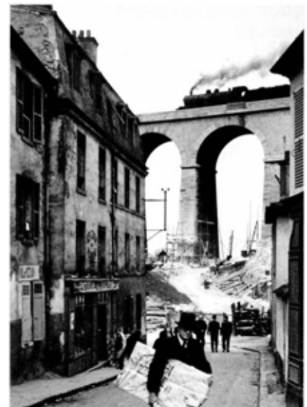
André Kertész; Meudon, 1928, 1928 ; gelatin silver print; 16 7/16 x 12 1/2 in. (41.8 x 31.8 cm); courtesy Estate of André Kertész

The peculiar, yet familiar, political ambiguity as art of the experimental forms in and around Conceptualism, particularly in the context of 1968, is the result of the fusion, or even confusion, of tropes of art-photography with aspects of its critique. Far from being anomalous, this fusion reflects precisely the inner structure of photography as potentially avant-garde or even neo-avant-garde art. This implies that the new forms of photographic practice and experiment in the sixties and seventies did not derive exclusively from a revival of anti-subjectivist and anti-formalist tendencies. Rather, the works of figures like Douglas Huebler, Robert Smithson, Bruce Nauman, Richard Long, or Joseph Kosuth emerge from a space constituted by the already-matured transformations of both types of approach—factographic and subjectivistic, activist and formalist, "Marxian" and "Kantian"—present in the work of their precursors in the 1940s and 1950s, in the intricacies of the dialectic of "reportage as art-photography," as art-photography par excellence . The radical critiques of art-