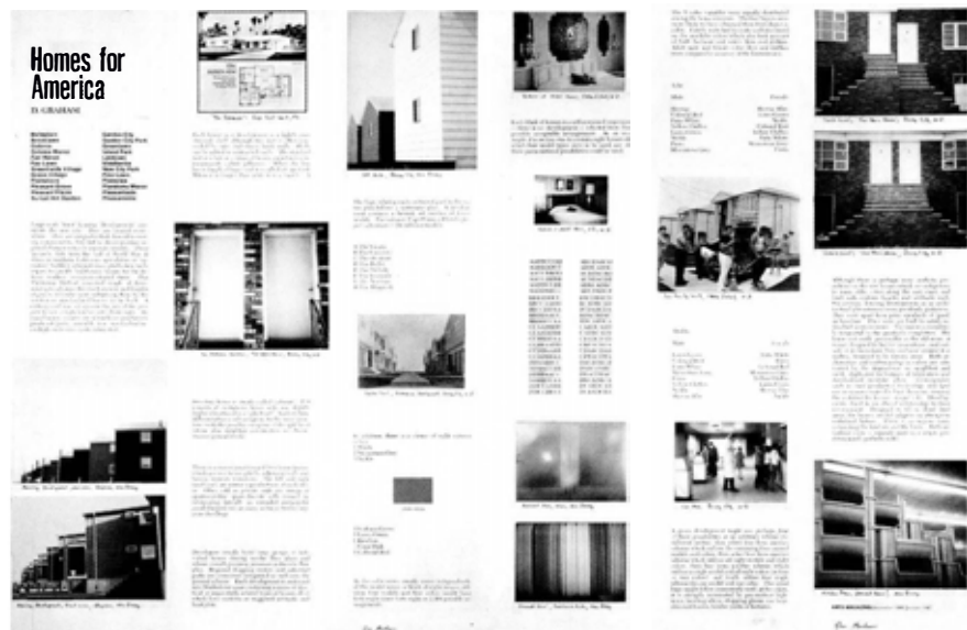
Dan Graham; Homes for America , 1966–1967; photo-offset reproduction of layout for Arts Magazine ; 34½ x 25 in. (87.6 x 63.5 cm); Walker Art Center

The essence of the modernist deconstruction of painting as picture-making was not realized in abstract art as such; it was realized in emphasizing the distinction between