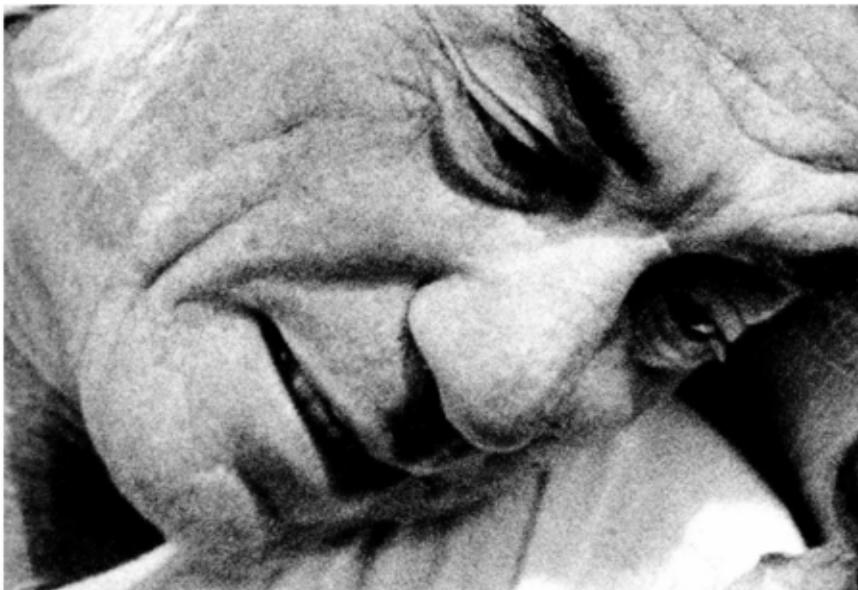
Publicity still from John Cassavetes’ Faces (filmed 1965/released 1968)