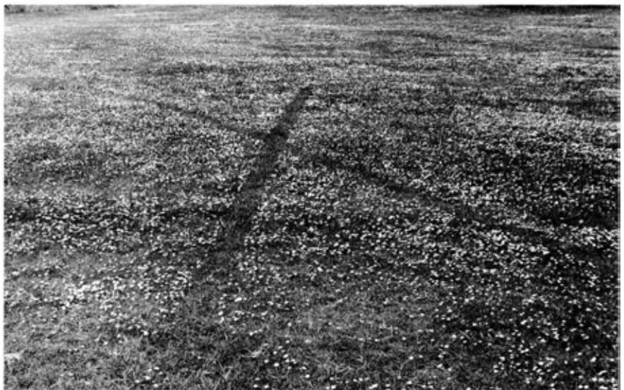
Richard Long; England 1968 , 1968; black-and-white photograph; dimensions variable; courtesy the artist

This complex game of mimesis has been, of course, the foundation for all the “endgame” strategies within avant-gardism. The profusion of new forms, processes, materials and subjects which characterizes the art of the 1970s was to a great extent stimulated by mimetic relationships with other social production processes: