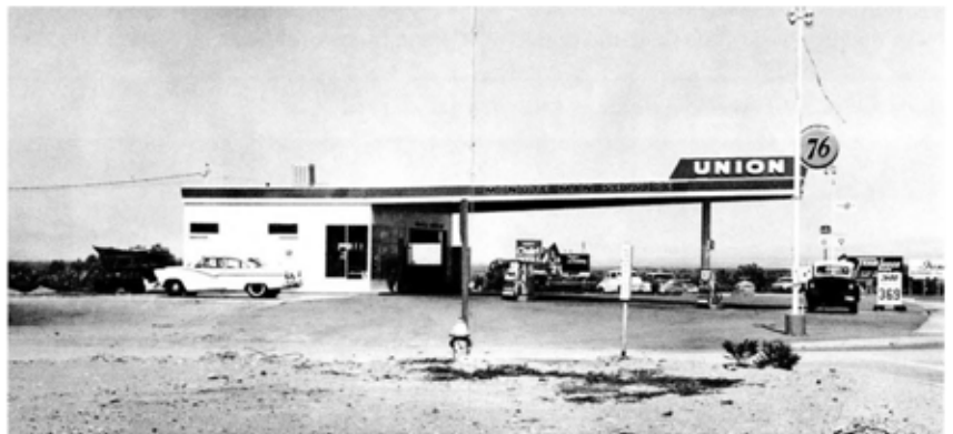
UNION, NEEDLES, CALIFORNIA