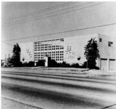
1555 ARTESIA BLVD.

Edward Ruscha; 1555 Artesia Blvd. and 6565 Fountain Ave., from Some Los Angeles Apartments , 1965; photo-offset-printed book; 7 1/8 x 5 5/8 in. (18.1 x 14.3 cm); Walker Art Center