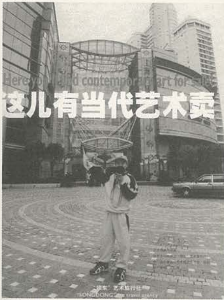
Fig. 12 Supermarket exhibition held in the Shanghai Square Shopping Center, 1999.

There had been no precedent for this type of exhibition space in Chinese history. Nor was it based on any specific Western model, although its basic concept was certainly derived from Western art museums and galleries funded by private foundations and donations. Because China did not have a philanthropic tradition to fund public art, and because no tax law was developed to help attract private donations to support art, to found a non-commercial gallery required originality and dedication. It was a tremendous