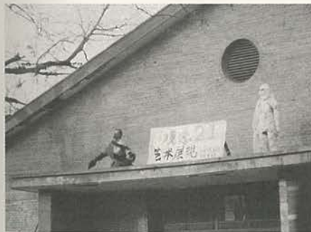
Fig. 2 Experimental art exhibitions were organized in all sorts of places, from a classroom in an art school to an open ground in a park.

The “issue” of exhibition attracted many Chinese experimental artists, art critics, and independent curators in the 1990s, and subsequently brought them into linked activities and discussions. At the center of this issue was a question: How to exhibit experimental art publicly? It was evident that throughout the decade, although “closed” shows were still routinely held as private communications among experimental artists themselves, an increasing number of curators and artists had chosen “to go public.” This phenomenon became especially obvious after the mid-90s. The advocates of this approach hoped that by finding new channels to bring experimental art into the public sphere, they could realize the social potentials of this art and undermine the prohibitions traditionally imposed upon it. They also hoped that these new channels would eventually constitute a social basis for the “normal working” of experimental art, thus enabling this art to contribute to China’s ongoing social and economic transformation. These agendas were not simply concerned with the exhibition per se , but rather intimately related to large questions about the roles of experimental art in China as well as the relationship between experimental artists and the society at large.