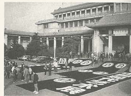
Fig. 3 China/Avant-garde exhibition, 1989, National Art Gallery, Beijing

Chinese experimental art was "discovered" by Hong Kong, Taiwan, and western curators and dealers in the early 90s. A series of events, including the world tour of the China's New Art, Post-1989 exhibition organized by Hong Kong's Hanart TZ Gallery, the appearance of young Chinese experimental artists in the 1993 Venice Biennale, and cover articles in Flash Art and The New York Times Magazine , introduced this art to a global audience. 3 Since then, Chinese experimental art has attracted growing attention abroad. To list just a few facts in 1999, the last year of the decade: at least two large exhibitions of this art took place in the United States; the Beijing-born artist Xu Bing was awarded a MacArthur Fellowship; another New York-based Chinese artist Wenda Gu was featured on the cover of American Art ; twenty Chinese artists were selected to present their work in that year's Venice Biennale, more than the number of either the American or Italian participants; Cai Guo-qiang won one of the three International Awards granted at this Biennale. While Xu Bing, Wenda Gu, and Cai Guo-qiang were among those Chinese artists who have emigrated to the West and established their reputations there, artists who decided to remain home found no shortage of invitations to international exhibitions and art fairs. Their works were covered by foreign media and