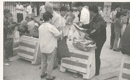
Fig. 15 People reading Talents on Beijing's streets, 1999.