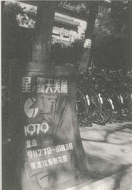
Fig. 1 “Stars” exhibition, 1979, Beijing