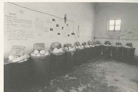
Fig. 17 Song Dong's work in the exhibition Trace of Existence curated by Feng Boyi in Beijing, 1998.

Each of the eleven participating artists selected a specific location within the exhibition space as the site of his or her work (fig. 17). Song Dong, for example, used the factory’s abandoned dining hall to stage his installation: twelve large vats containing 1,250 cabbages picked on the spot. Wang Gongxin projected his video Tending Sheep in a sheep pen with a real sheep in it (fig. 18). The curator sub-titled the exhibition “a private showing of contemporary Chinese art,” but they also supplied large buses to take several