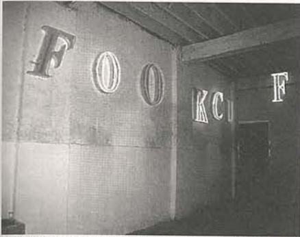
Fig. 20 Fuck Off , Eastlink Gallery Shanghai, 2000.