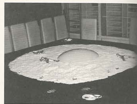
Fig. 13 The exhibition Art as Food held in Beijing's Club Vogue, 1999.

This direction was exemplified by a number of original projects developed in 1999 and 2000. For example, the exhibition Supermarket was actually held in a supermarket in downtown Shanghai (fig. 12); the fashionable bar Club Vogue in Beijing became the site of the exhibition Art as Food (fig. 13); upon the opening of the largest "furniture city" in Shanghai, customers had the opportunity to see a huge experimental art exhibition, called Jia? or Home? , on the store's enormous fourth floor. The fact that a majority of these shows used commercial spaces reflected the curators' interest in a "mass commercial culture," which in their view had become a major moting force in contemporary Chinese society. While affiliating