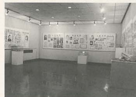
Fig. 8 The exhibition Women/Here in the Contemporary Art Gallery of the Central Academy of Fine Arts High School, Beijing, 1995.