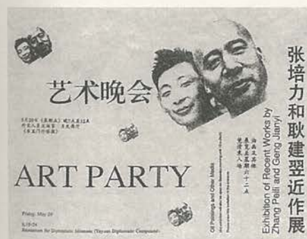
Fig. 6 Poster for an exhibition held in 1991 in the Diplomatic Missions Restaurant, Beijing.