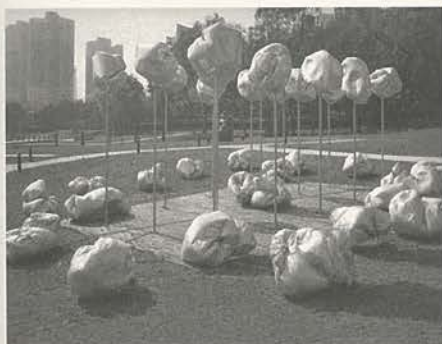
Fig. 10 He Xiangning Art Museum in Shenzhen

Generally speaking, however, national and municipal galleries were still not ready to openly support experimental projects by young Chinese artists. Even when they held an exhibition of a more adventurous nature, they often still had to emphasize its “academic merit” to avoid possible criticism. Compared with these large galleries, smaller galleries affiliated to universities, art schools, and other institutions enjoyed more freedom to develop a more versatile program, including to feature radical experimental works in their