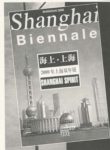
Fig. 19 Third Shanghai Biennale, November 2000-January 2001