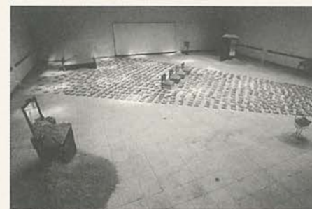
Fig. 9 Yin Xiuzhen's exhibition, Ruined City , in the Art Museum of Capital Normal University, Beijing, 1996.