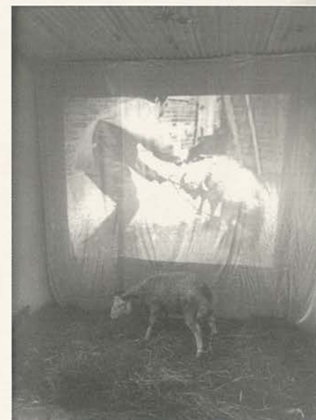
Fig. 18 Wang Gongxin's work in the exhibition Trace of Existence , Beijing, 1998.