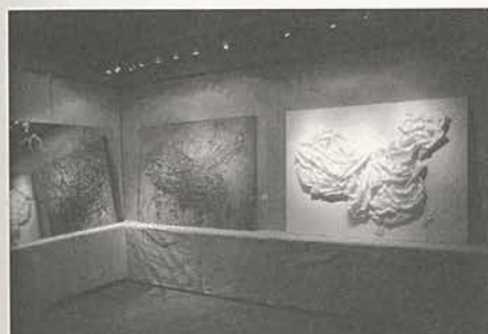
Fig. 11. Factory No. 2 exhibition held in Beijing’s Wan Fung Gallery in early 2000.