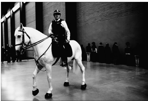
Installation view of La Monnaie Vivante at the Tate Modern. 2007.

and Franck Apertet) and Prinz Gholam. Curatorially, La Monnaie Vivante is distinctive in presenting performances as overlapping in a single space and time (a combination of exhibition and festival); this format forges an intense and continually shifting proximity between the different performances, as well as between performers and viewers, who occupy the same space as the works and move among them. At Tate Modern in 2008, for example, performances of varying duration took place on the Turbine Hall bridge, ranging from a six-hour live installation by Sanja Iveković ( Delivering Facts, Producing Tears , 1998–2007) to fleeting instruction pieces by Lawrence Weiner (shooting a rifle at a wall, emptying a cup of sea water onto the floor). This led to some sublime juxtapositions, such as Santiago Sierra’s Eight People Facing a Wall (2002) as the backdrop to Tania Bruguera’s Tatlin’s Whisper #5 , which in turn circled around six dancers holding poses, and salivating onto the floor, choreographed by Vigier and Apertet.