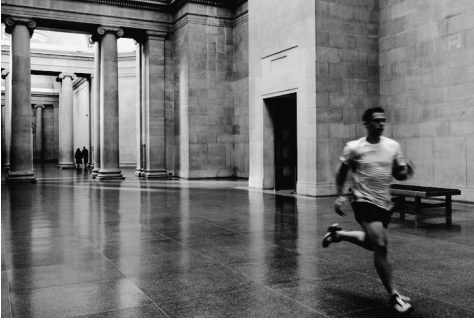
Martin Creed. Work No. 850. 2008.

eage in contemporary choreography such as Jérôme Bel's The Show Must Go On (2001), which makes use of everyday movements to literalize the lyrics of pop songs. Several of these strands come together, albeit in a more professionalized