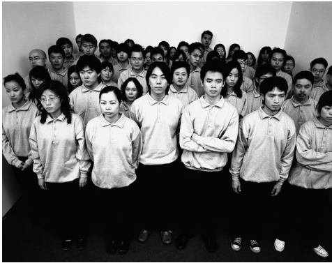
Paola Pivi. 100 Chinese. 1998–2005.

paid upwards of $2,500 for a ticket. 27 Although this project seems to be a clear example of Abramović entering the domain of self-parody (apparently unwittingly), I would like to maintain that not all examples of delegated performance should be tarnished with the label of “art-fair art” or “gala art”: the better examples offer more pointed, layered, and troubling experiences, both for the performers and viewers, which problematize any straightforward Marxist criticism of these performances as reification.