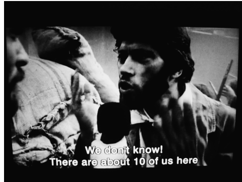
Peter Watkins. La Commune (Paris, 1871). 2000.

Whereas once performance art sought to break with the art market by dematerializing the work of art into ephemeral events, today dematerialization and