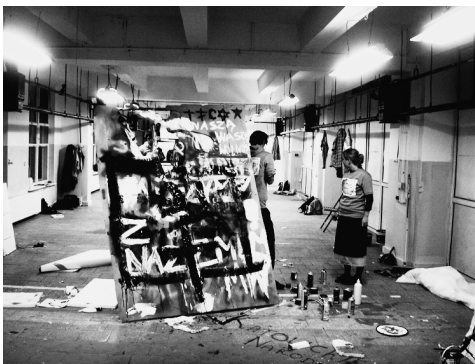
Artur Żmijewski. Them . 2007.