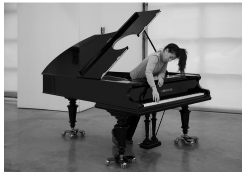
Allora and Calzadilla. Stop, Repair, Prepare . 2008.

A second strand of delegated performance, which began to be introduced in the later 1990s, concerns the use of professionals from other spheres of expertise: think of Allora and Calzadilla hiring opera singers ( Sediments, Sentiments, Figures of Speech , 2007) or pianists ( Stop, Repair, Prepare , 2008); of Tania Bruguera hiring mounted policemen to demonstrate crowd-control techniques (in Tatlin's Whisper #5 , 2008); or of Tino Sehgal hiring university professors and students for his numerous speech-based situations ( This Objective of That Object , 2004; This Progress , 2006). 8 These performers tend to be specialists in fields other than those of art or performance, and since they tend to be recruited on the basis of their professional (elective) identity, rather than for being representatives of a particular class or race, there is far less controversy and ambivalence around this type of work. Critical attention tends to focus on the conceptual frame and on the specific activities or abilities of the performer or interpreter in question, whose skills are