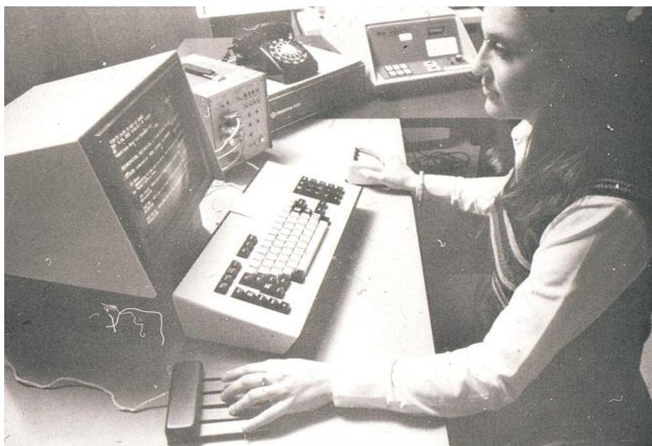
Fig. 2. Workstation demonstrated 1968