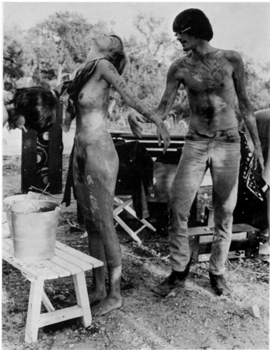
Sunlove, Happening with The Soft Machine , 1967.

No crisis of the mind can exist independently of the social predicament, and artists are far from being the only ones to have to bear the consequences, the horrifying anguish of the sens perdu . They are however almost the only people, together with criminals and revolutionaries, to react against this loss, to assume it and express it; which is, precisely, an infringement of the rules.