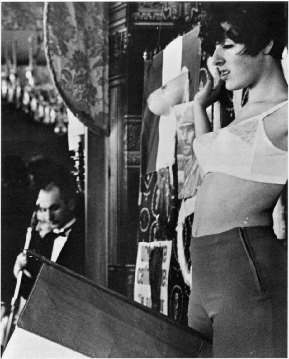
Lebel's Happening on the theme of Playtex bras (Tour d'Argent Restaurant, Paris, 1965).

The Happening answers with actions. The marriage between theory and praxis is consummated—an extremely rare event. Transformation of thought, of the dream become Action in which Being in search of its sovereignty attains its greatest openness; the Happening, of all the languages at our disposition, is the least alienating. John Cage and Eric Dolphy play not only with notes but with sounds and noises; Picabia and Rauschenburg paint not only with colors but with everyday objects; Oldenburg or Ferrò will make a picture not only with images but with events. We no longer paint battles—we wage them.