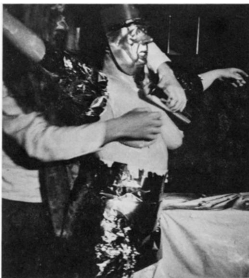
Publik, by Ben Vautier (Paris, 1966).

We are doing exactly the opposite. It will be remembered that during the Happenings which Kaprow did for the Théâtres des Nations in 1963, we met the spectators in the Théâtre Récamier and took them half a kilometer away, to the second floor of the Bon Marché. Environment is the essential element in any Happening. Art must literally "go down into the street," come out of the cultural zoo, to enrich itself with what Hegel (without humor) called "the contamination of the casual." Thus, the first European Happening (at the end of the second Anti-Trial, June 1960) took place partly in the streets and on the canal of the Giudecca in Venice. In 1963, Wolf Vostell organized Cityrama , moving across Cologne. We have used the spaces of the Boulogne cinema studios ( Manifestation for conjuring the spirit of Catastrophe , 1963), the Musée d'Art Moderne in Paris ( Incidents , 1963), and the American Artists Center (Festival of Free Expression, 1964 and 1965). We hope to do other things in a station, a stadium, an airplane. To be elsewhere. To be radar. To be there. The conventional theatre, the art shop or gallery, are no longer (and perhaps in themselves have never been) sacred places—so why shut ourselves up in them? Artistic activity is founded on high telepathy—a contact high—and everything which comes into its field becomes a sign , and is part of art. It is therefore evident that the primary problem of today's art has become the renovation and intensification of perception .