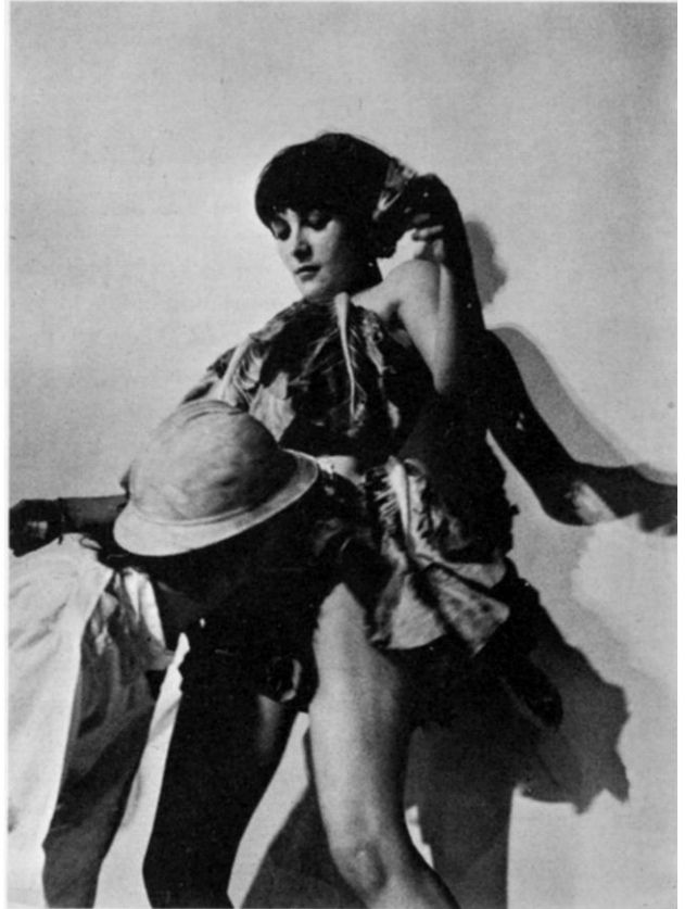
Soldier eats cabbage leaves off badminton girl in Dechirex by Lebel at Second Festival of Free Expression (Paris, 1965).

The artist of the second half of this century—whether in Europe or America—is a politically and spiritually decadent being in comparison with what various genial utopians would have liked him to be—but also in comparison with his own growing pains (1910-1930). Dispossessed of most of his intellectual resources, progressively depersonalized as he “succeeds” socially, the artist is nothing but the clown of the ruling classes. It is useless to interpret this downfall as a victory of apolitical feeling over that of revolt. To the watchdogs of tradition, upset by the generally sagging market, I say that not only will we not agree to limit or put a brake on this crisis, but we will take every opportunity to exasperate it to its highest pitch. For this is our only chance to have done with this exploiting society, with its slave-owning