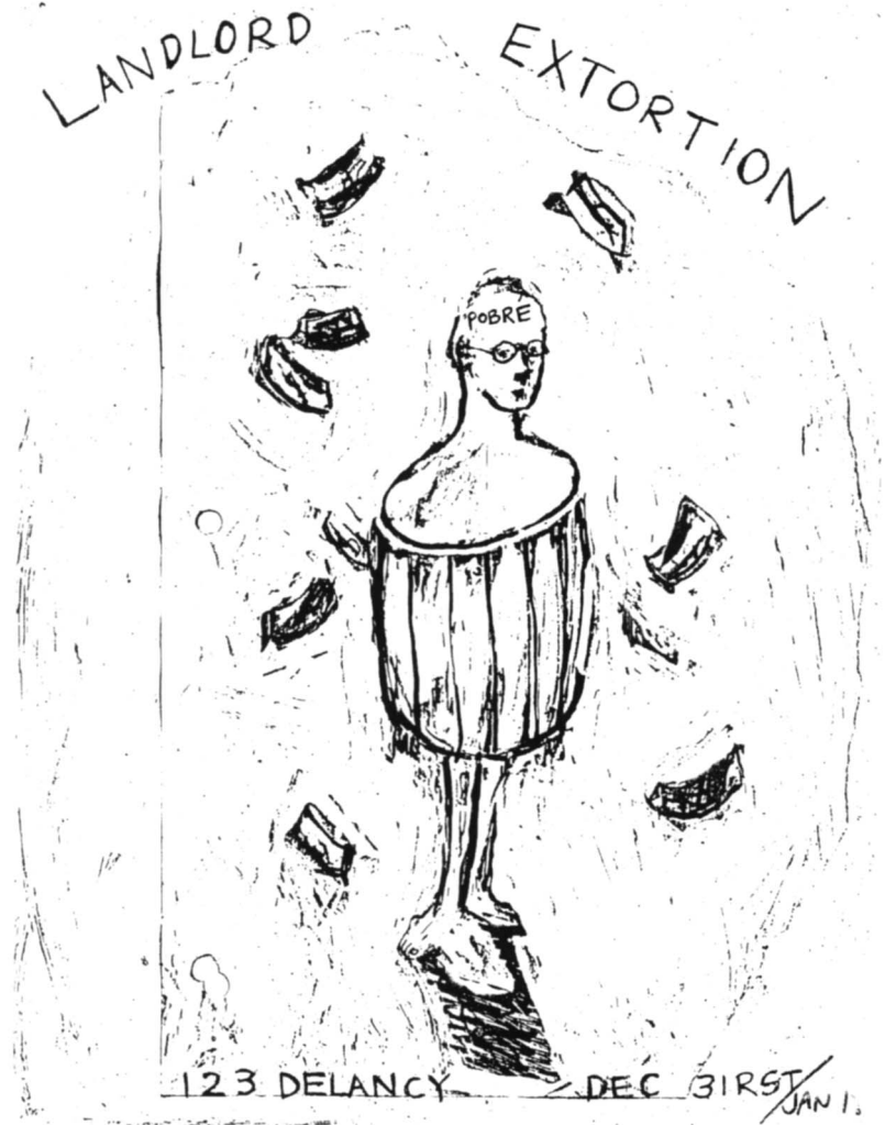
Colen Fitzgibbon, "Landlord Extortion," poster for The Real Estate Show , 1979, photocopy, 8½ x 11 (21.6 x 27.9 cm) (artwork © Colen Fitzgibbon)

on Manhattan Cable Channel D starting in May 1977. All Color News sought to provide a "community news service" that covered "events affecting people who are not artists, as well as the art community." 19 This mission reflected a wider movement of 1970s activist collectives that used video production as a means to question the ideology that determined what was newsworthy and the type of information the three major networks proffered audiences via television. 20 Instead of repeating coverage of common stories found in the mainstream media—police shootings, high-profile murder cases, and local politics— All Color News devoted programming "to information on events that get little or no coverage in public news, and provides a critical investigation of current social structures through a collaborative news gathering team of artists." 21 Strategically, members aired images and stories that would make visible the information that mainstream press coverage commonly suppresses without evidence of erasure. This approach to news gathering critiqued the means through which the media not only ignored the "current social structures" but also helped to produce and manage them.