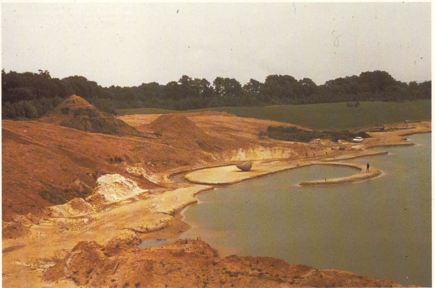
Robert SMITHSON Broken Circle, 1971-72 and Spiral Hill, 1971 (Emmen, Holland)

Morris' projects and especially Heizer's project Effigy Tumuli on the Buffalo Rock Mesa (1983-85) throw light upon the financing of Land Reclamation in America after Carter's signing of the 1977 Act. The Foundation of the Ottawa Silica Company, which owned the former coal mines along the Illinois River, selected and paid the artist. Furthermore, they donated the land to the State of Illinois, which integrated it into the 'Buffalo Rock State Park'. 10 On the land decontaminated by AMLR, Heizer formed five forms recalling regional animals from walls of earth with linear edges. The 'diffracted gestalt' 11 of the large earth walls can only be seen in full view from an aircraft. Earlier, the Indians of the northern part of Illinois had also built such walls of earth representing animal forms ('effigy tumuli'); Heizer was not making references to ecology, but rather to history.