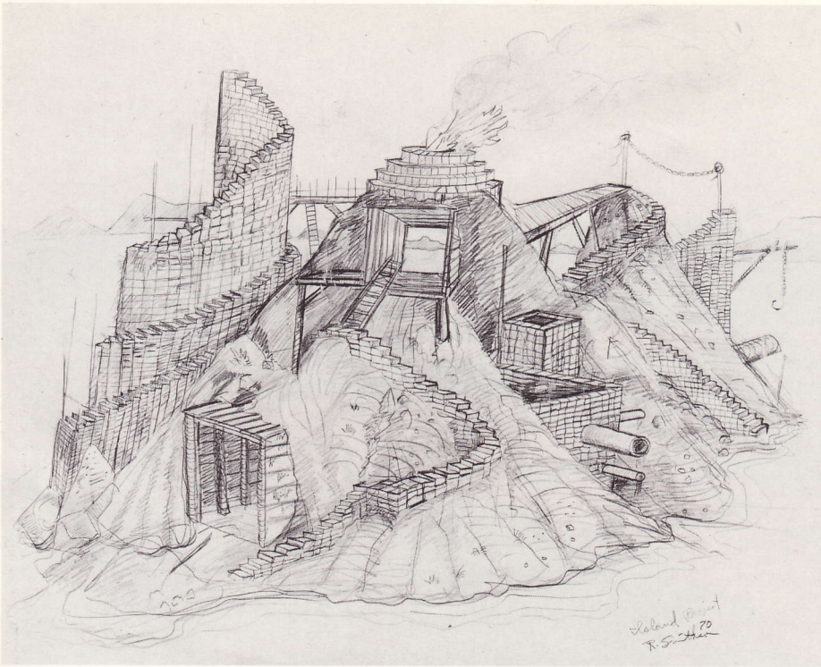
Robert SMITHSON Island Project, 1970 Pencil on paper 48 x 61 cm

impress the imagination with an idea of their progress beyond their actual limits.