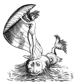
HIC SVNT MONSTRA