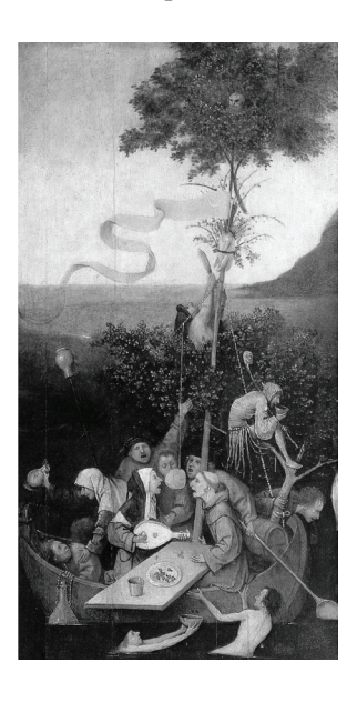
Fig. 1. Hieronymus Bosch, Ship of Fools (1490–1500)