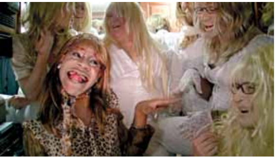
Below: Ryan Trecartin, K-Corea INC.K (Section A) , 2009, HD video, color, 33 minutes 5 seconds.