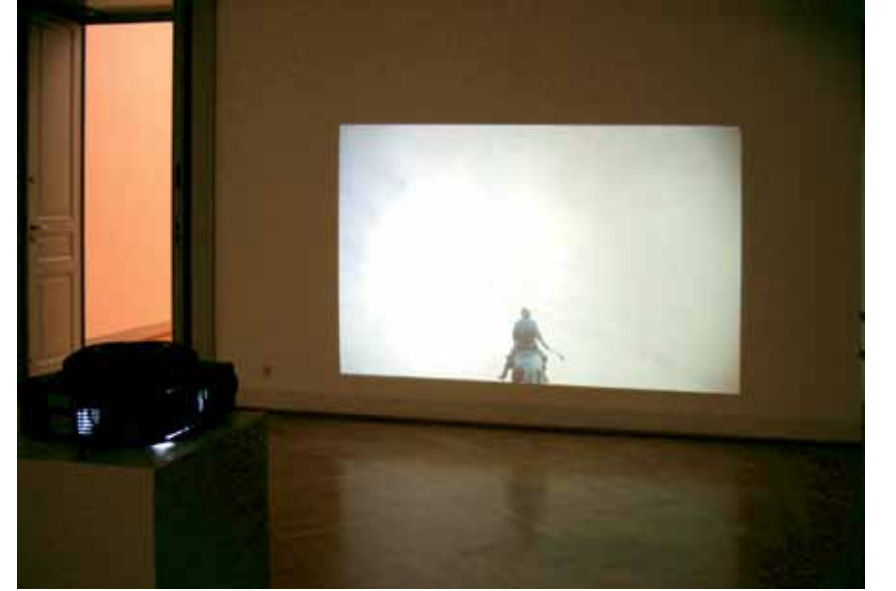
Matthew Buckingham, Image of Absalon to Be Projected Until It Vanishes (detail), 2001, slide projection, framed text. Installation view, Kunstmuseum St. Gallen, Switzerland, 2005.