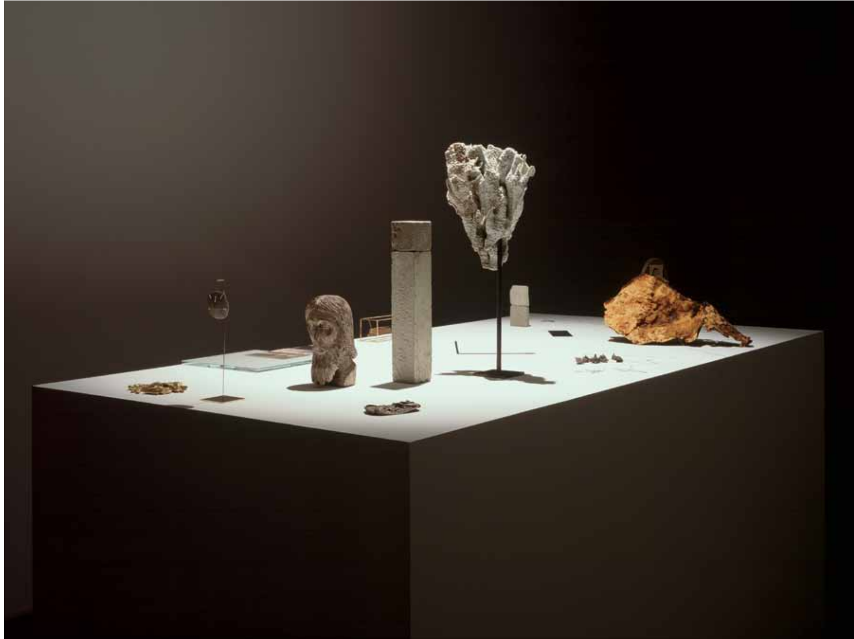
Carol Bove, La traversée difficile (The Difficult Crossing), 2008, mixed media. Installation view, Kimmerich, Düsseldorf.