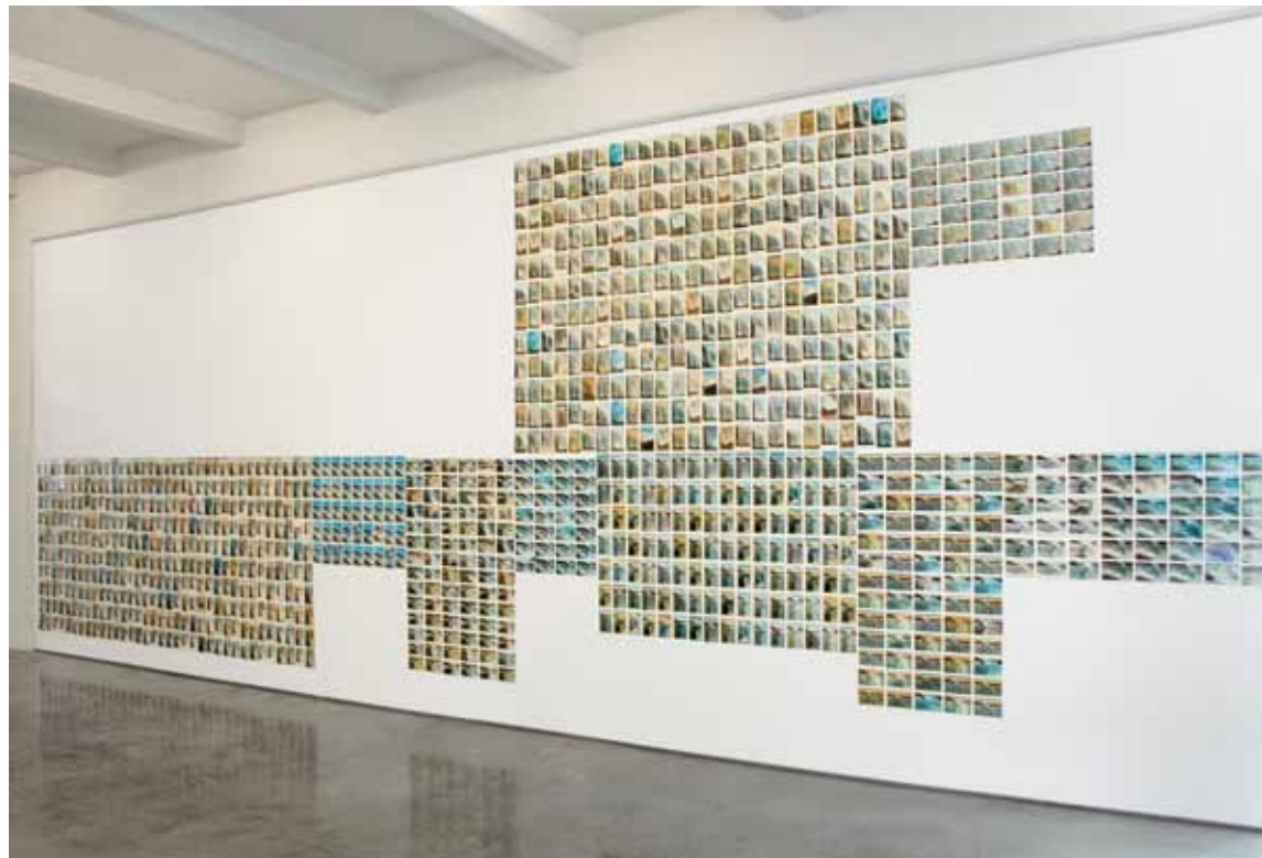
Below: Zoe Leonard, You see I am here after all , 2008, approx. four thousand postcards. Installation view, Dia:Beacon, Beacon, NY.

information as possible about Zuaiter's life, bringing together objects owned by or important to him (books, postcards, films, records), and Jacir's efforts to locate these objects are narrated diaristically in wall texts. The presentation of research-based art and archival installations is typically at pains to confer aura and value on carefully selected physical objects; moreover, these objects remain fixed and static rather than being adaptable by users. Such works reaffirm the paradoxical compromise wrought by contemporary art when confronted with new media: The end-less variability and modulation of the digital image is belied by the imposition of a "limited" edition and an aesthetics of the precious one-off (sepia-tinted prints, display cabinets, file boxes of ephemera, etc).