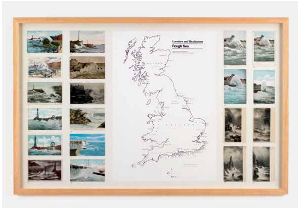
Above: Susan Hiller, Dedicated to the Unknown Artists (detail), 1972–76, 305 postcards, charts, maps, one book, one dossier, mounted on fourteen panels, each 26 x 41 ¼".