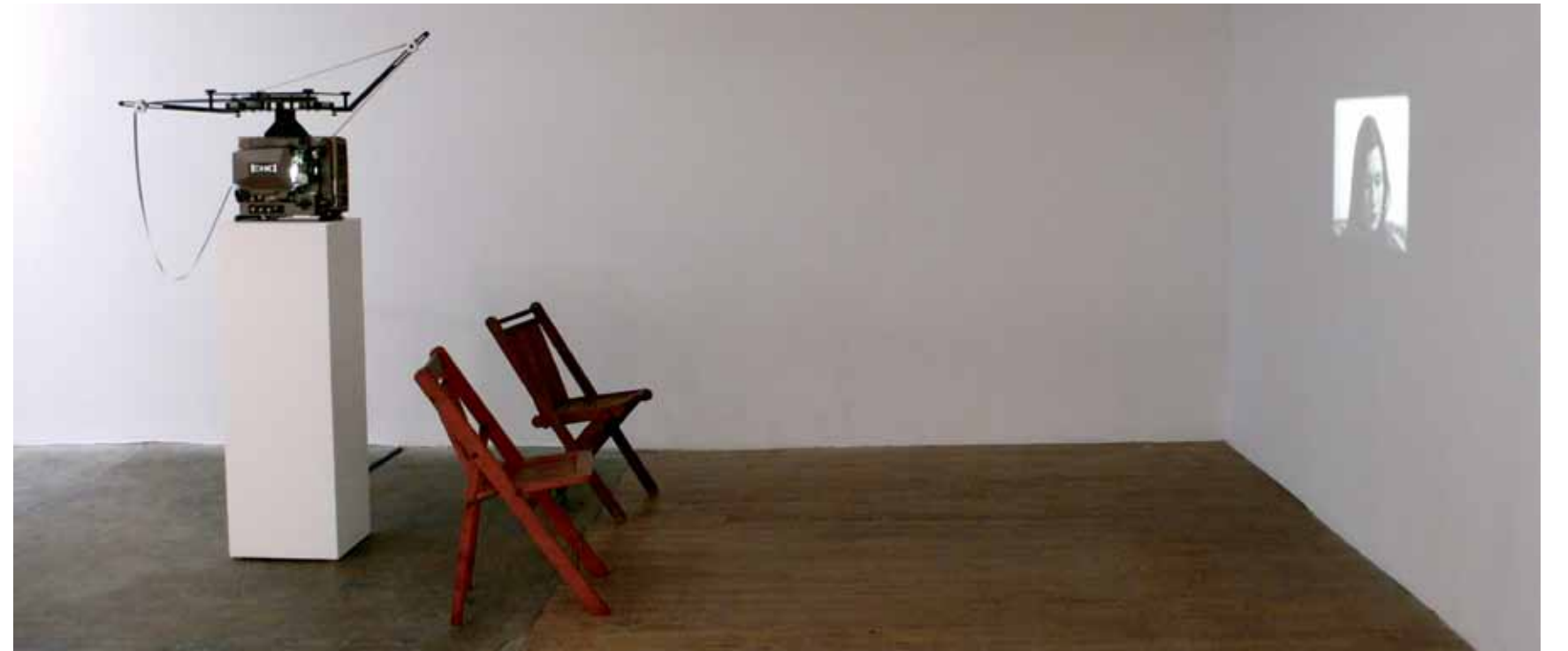
Manon de Boer, Attica , 2008, 16 mm, black-and-white, 9 minutes 55 seconds. Installation view, Lunds Konsthall, Lund, Sweden, 2009.

CLAIRE BISHOP ON CONTEMPORARY ART AND NEW MEDIA