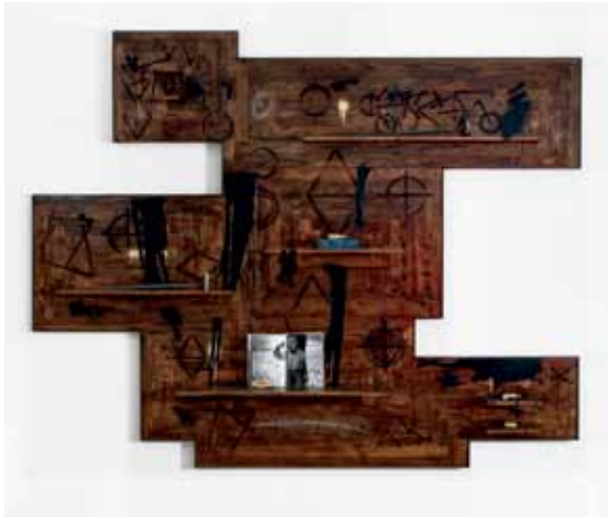
Rashid Johnson, Fatherhood as Described by Paul Beatty , 2011, branded red oak flooring, black soap, wax, books, branding irons, shea butter, oyster shells, space rock, gold paint, 96 x 120 x 12 ½".