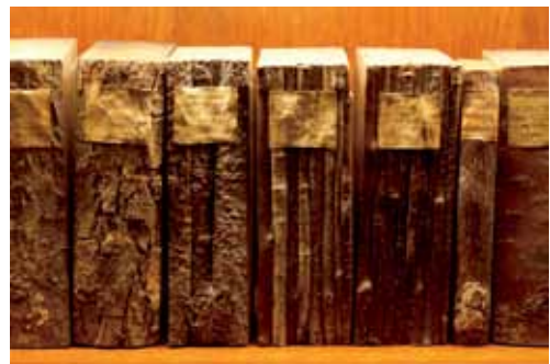
Mark Dion, Xylotheque (detail), 2011–12, wood, glass, electric lighting, porcelain cabinet knobs, wood inlay, plant parts, paper, papier-mâché, clay, wax, paint, wire, vellum, leather, plastic, ink, dimensions variable.