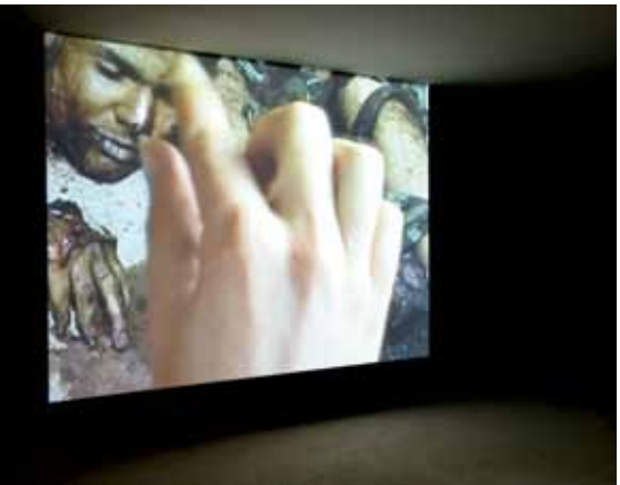
Above: Thomas Hirschhorn, Touching Reality , 2012, video, color, silent, 4 minutes 45 seconds. Installation view, Palais de Tokyo, Paris.

THE FASCINATION WITH ANALOG MEDIA is an obvious starting point for an examination of contemporary art's repressed relationship to the digital. Manon de Boer, Matthew Buckingham, Tacita Dean, Rodney Graham, Rosalind Nashashibi, and Fiona Tan are just a few names from a long roll call of artists attracted to the materiality of predigital film and photography. Today, no exhibition is complete without some form of bulky, obsolete technology—the gently clunking carousel of a slide projector or the whirring of an 8-mm or 16-mm film reel. The sudden attraction of "old media" for contemporary artists in the late 1990s coincided with the rise of "new media," particularly the introduction of the DVD in 1997. Overnight, VHS became obsolete, rendering its own aesthetic and projection equipment open to nostalgic reuse, but the older technology of celluloid was and remains the favorite. Today, film's soft warmth feels intimate compared with the cold, hard digital image, with its excess of visual information (each still contains far more detail than the human eye could ever need). 3 Meanwhile, numerous apps and software programs effortlessly impersonate the analog without the chore of developing and process-