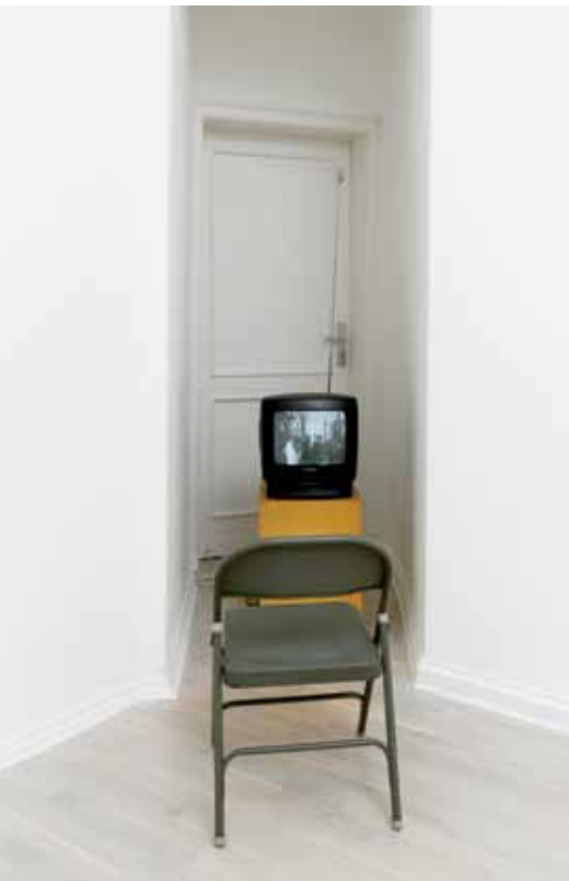
Dave McKenzie, We Shall Overcome , 2004, video, color, 5 minutes 46 seconds.

The ability to do something, to participate in something, or even to access something should be critiqued by acknowledging one's desires and needs and by imagining the possible outcomes of one's actions. As technologies continue to shift, it becomes increasingly important to take a position—not only by choosing but by assessing and reassessing. □