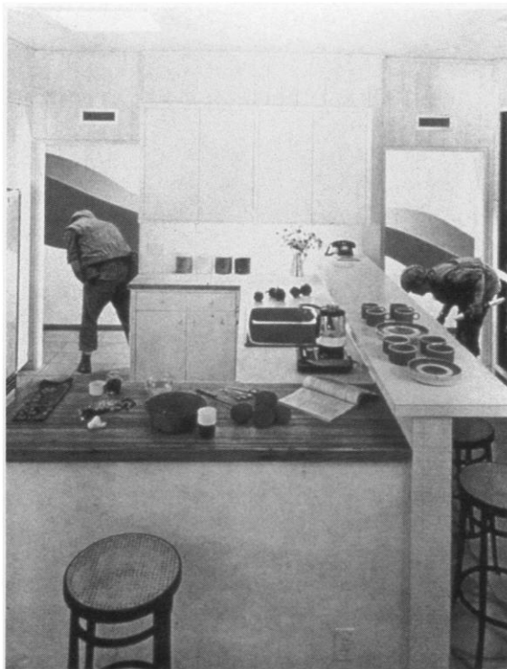
Fig. 1. Martha Rosler, Red Stripe Kitchen (1969-72), color photomontage, 24" x 20".

Piper’s study of philosophy enabled her to articulate her artistic concerns more precisely as an investigation of subject-object relations between “myself as solipsistic object inhering in the reflective consciousness of an external audience or subject; and my own self-consciousness of me as an object, as the object of my self-consciousness.” 33 In Food for the Spirit (1971), Piper documented the metaphysical and physical changes she underwent during a period of isolation and fasting while reading Immanuel Kant’s Critique of Pure Reason . In response to her anxiety that she was disappearing into a state of Kantian self-transcendence, she periodically photographed her physical self, either nude or nearly so, in front of a mirror while reading passages from the Critique into a tape recorder. By thus documenting herself as the embodied object of her philosophical inquiry, Piper simultaneously made explicit her own particularized subjecthood as a black woman. 34 As Maurice Berger noted, this marked a shift away from the aesthetic privileging of the mind over the body and of the intellectual over the corpore-