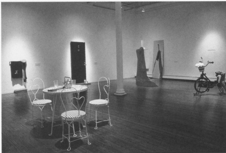
Fig. 3. Eleanor Antin, Portraits of Eight New York Women (1970), 1998 installation, Ronald Feldman Fine Arts, New York.

This absence of presence was, of course, one of the defining issues for feminist artists struggling for recognition and self-definition during the 1970s. Although much of the work from that period has been repudiated for its supposedly essentializing belief that a "true" female identity or "sensibility" could be discovered, a closer scrutiny reveals that feminist thinking about questions of identity was far more complex and sophisticated than such reductive criticism suggests. 48 Indeed, given that women were seeking political emancipation and agency just as the privilege of subjectivity and authorship