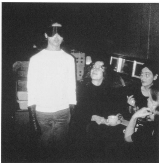
Fig. 2. Adrian Piper, Untitled Performance at Max’s Kansas City, NYC (1970), black-and-white photograph, 16" x 16".

For Eleanor Fineman Antin (b. 1935, New York City), the questions of subjectivity and otherness led to an ongoing inquiry into the diverse formations and representations of identity. 43 As early as 1965 Antin had explored the “essence” of identity in her Blood of a Poet Box , a work in the Fluxus mode,