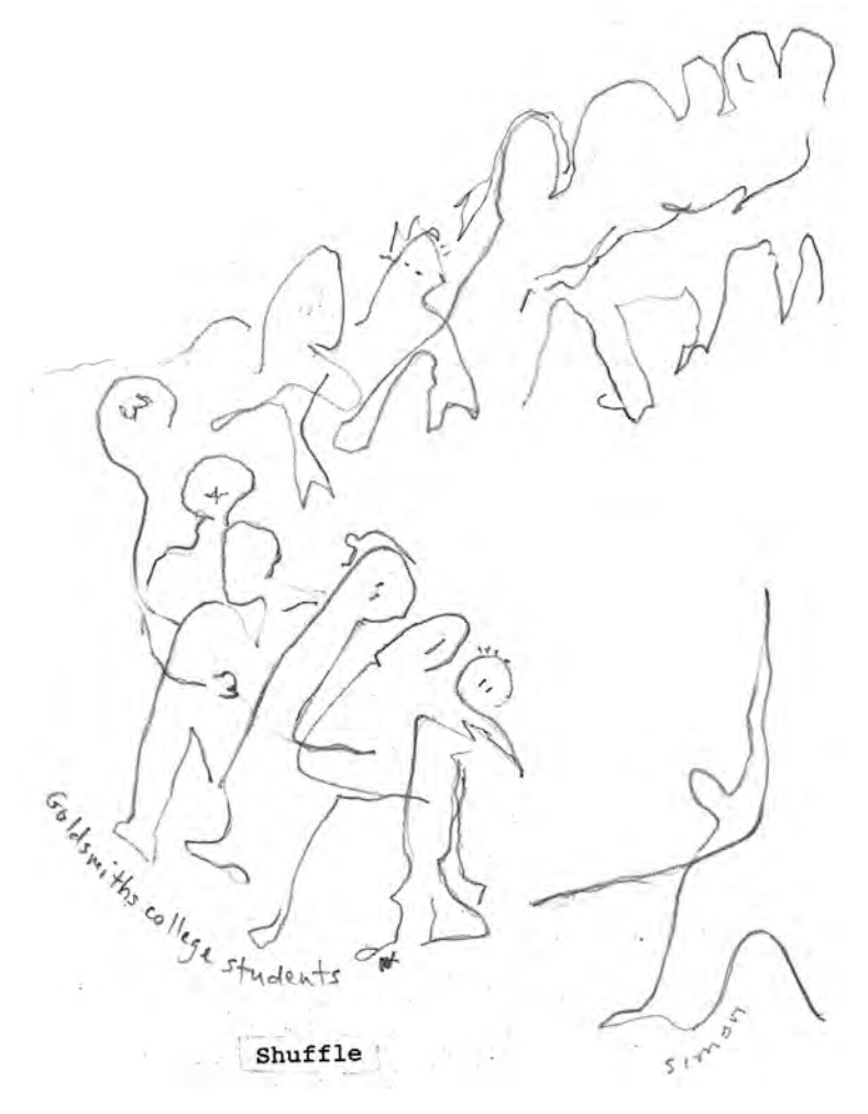
Shuffle, a drawing by Alison Knowles. Pencil on laid paper, 8¾" by 11".