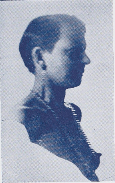
Elsa Baroness von Freytag Loring- hoven