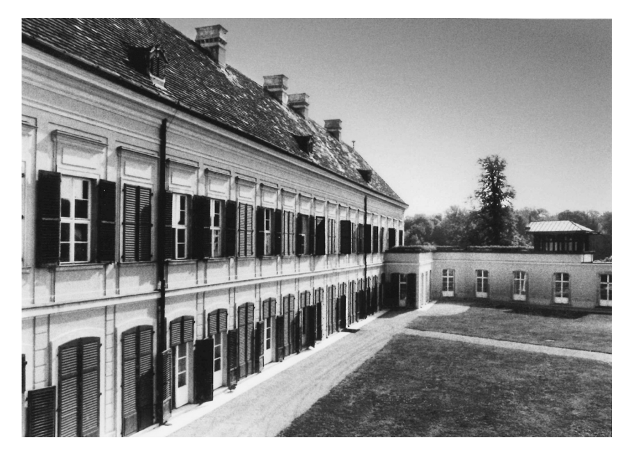
FIGURE 3. Schloss Laxenburg after reconstruction, 1978.

mathematician I interviewed joined IIASA in the early 1980s to find, in his words, a social milieu very similar to the one at home, the prestigious Steklov Mathematical Institute in Moscow. According to this scholar, the elite Soviet mathematical communities espoused rather democratic principles and informal relationships between professors and junior scientists, in this respect being completely different from other, more hierarchical scholarly environments, such as those of economists.<sup>23</sup> Some other scholars from East Europe voiced similar opinions: a Polish scholar even recalled that the atmosphere was much friendlier during the Cold War than it was at the time I interviewed him, because earlier directors made a particular effort to make sure that everyone felt welcome.<sup>24</sup> Also, some Soviet scientists came from elite academic institutes, which were, as David Holloway notes, rare islands of freedom in Soviet society.25 These scholars told me that they did not encounter a big cultural difference; for them the key benefit of IIASA was the opportunity to freely access its increasingly rich library and, importantly, unlimited use of its photocopier. According to one member of administration staff, one could always be certain to find a visiting Soviet scholar at the copying machine.26