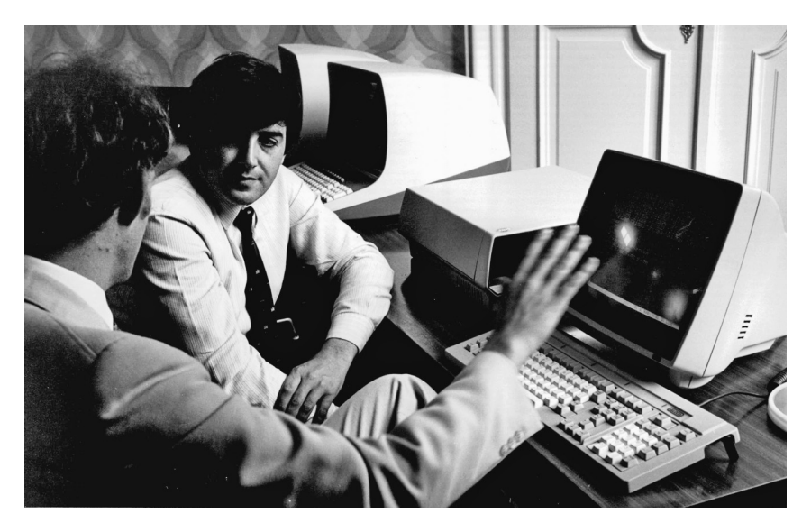
FIGURE 7. IIASA scientists at work, probably the 1970s.