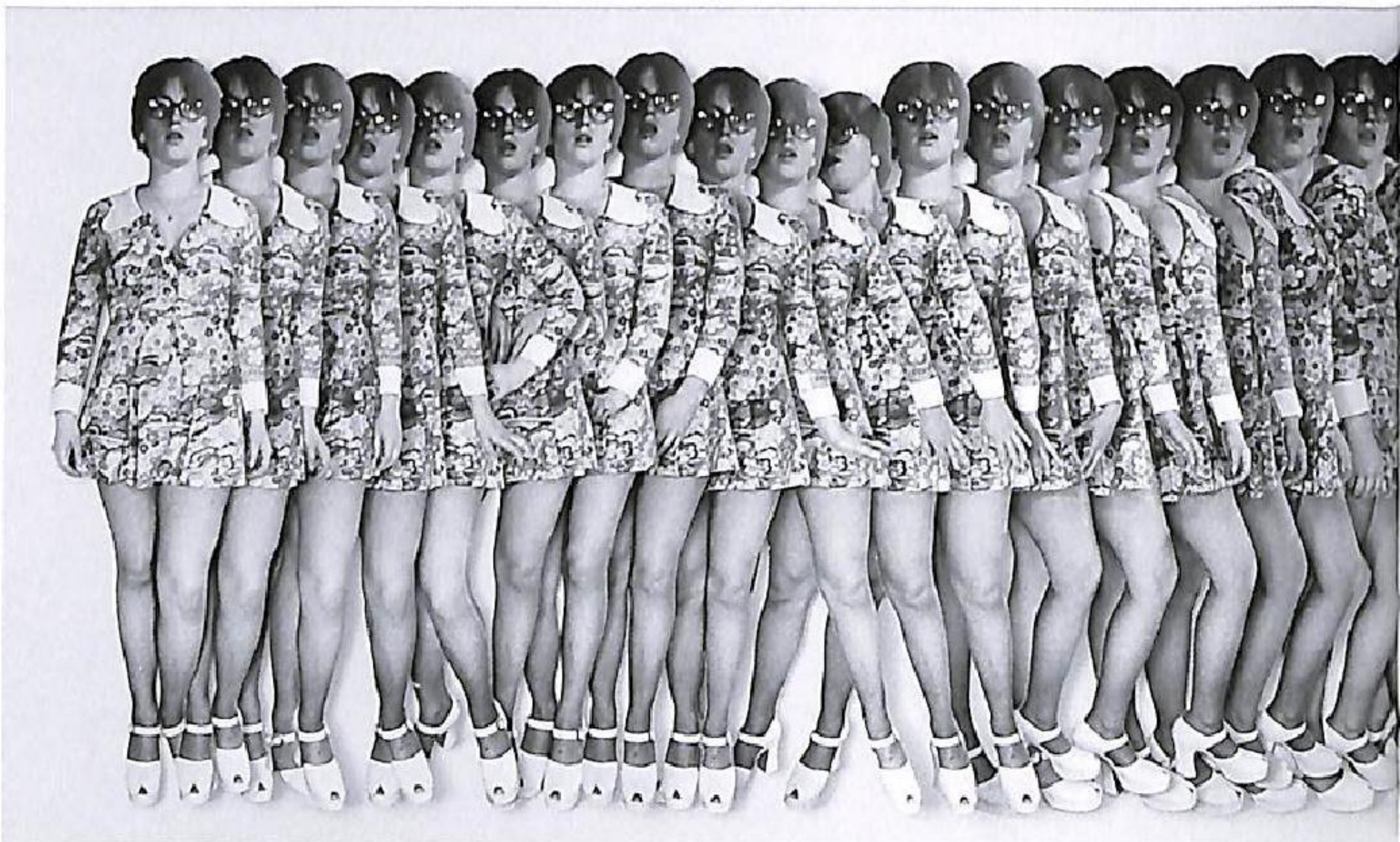
(TOP) The Fairies 1976

Black and white cut-out photographs mounted on paper 10 x 23 inches