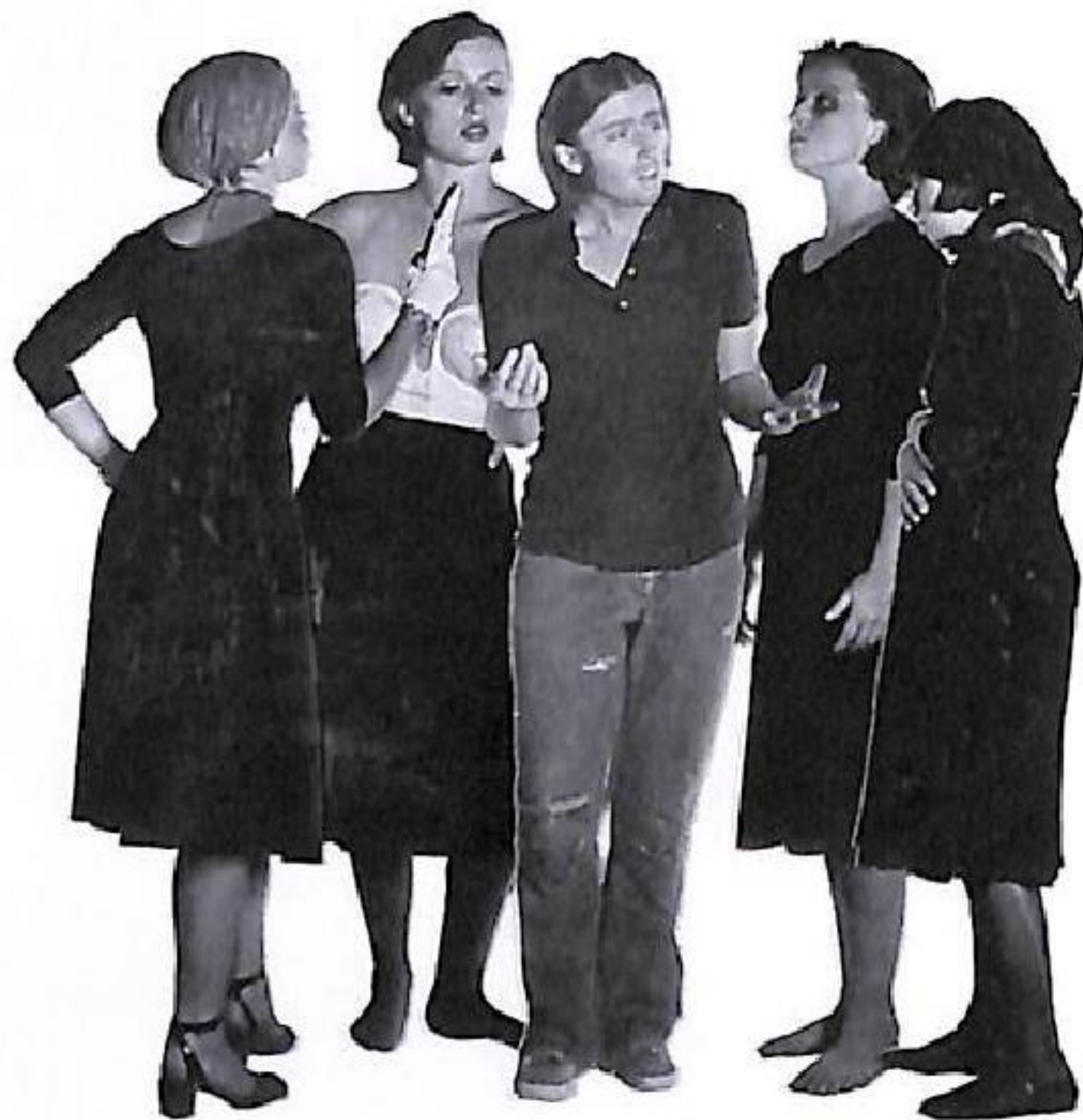
The Sub Characters (Vanity, Desire, Madness, and Agony) Begin to Close in on the Male Friend, Act 3, Scene 7 from A Play of Selves, 1976

Black and white cut-out photographs mounted on paper 15 1/4 x 11 inches