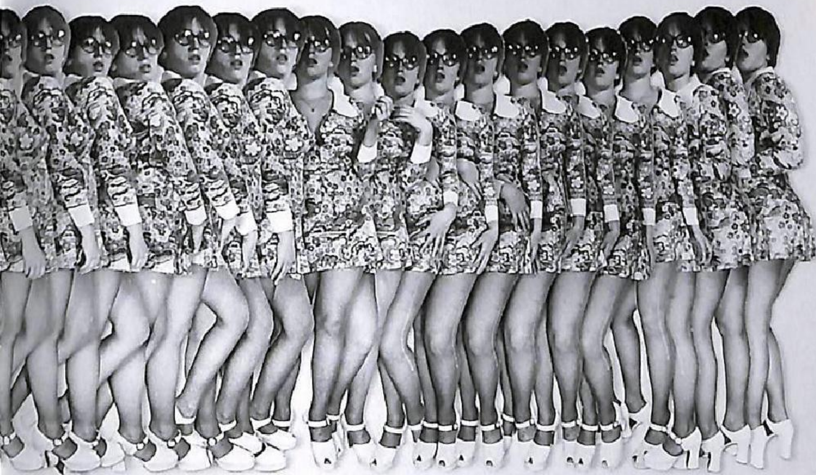
(BOTTOM) Untitled (Mini) 1976

Black and white cut-out photographs mounted on paper