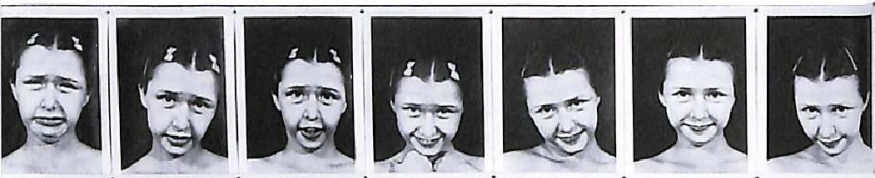
Untitled. 1975 13 black and white photographs 9 1/4 x 45 inches Lent by Elizabeth and Frank Leite