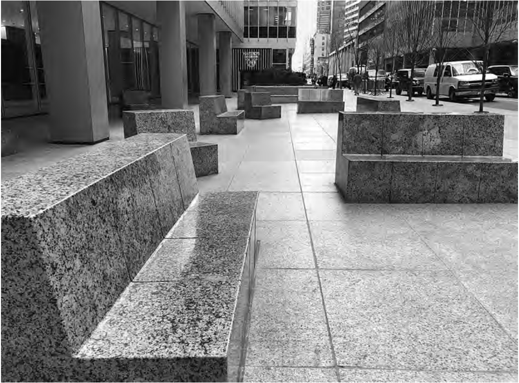
Figure 0.6. Scott Burton, detail of Urban Plaza North , 1985–88, part of the site-specific installation at the Equitable Center, Avenue of the Americas and Fifty-First / Fifty-Second Streets, New York, 1985–88.

“a specialized artistic class” would, over the course of the 1970s, be transferred to his ideas about sculpture and public art (see fig. 0.6), as I discuss in chapter 5.