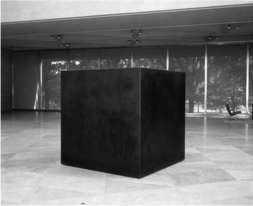
Figure 0.4. Tony Smith, Die, 1962 (fabricated 1968). Steel with oiled finish, 182.9 × 182.9 × 182.9 cm (72 × 72 × 72 in.). National Gallery of Art, Washington, DC. Gift of the Collectors Committee 2003.77.1.

view of some of the main protagonists. He focused more on writing about artists who complicated, chafed against, and extracted some of the tenets of what would come to be called “Minimalism.”