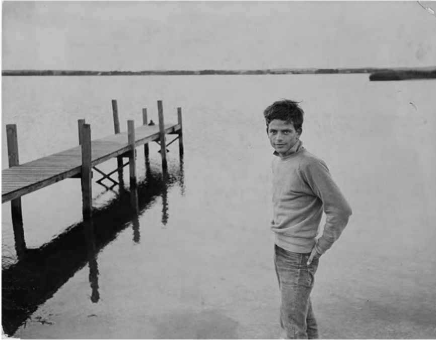
Figure 0.1. Jerome Robbins, Scott Burton Standing near the Dock at Jerome Robbins's Home in Water Mill, Long Island, 1961.