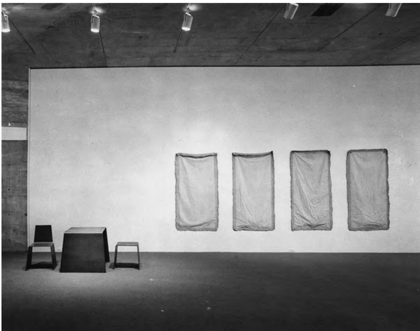
Figure 0.5. Scott Burton, Steel Furniture , 1978/79, with Eva Hesse, Aught , 1968.

Burton found appealing this more open conversation that made space for questions of the personal, feminism, and sexuality—unlike Minimalism. 100 He and his postminimalist peers—each in their own way—saw the contradiction between, on the one hand, Minimalism's contingent, open address to the viewer coupled with the suppression of the autographic presence of the artist and, on the other, its jealous cultivation of signature styles, dehumanized fabrication, and presumptions of speaking neutrally through geometry, seriality, and industrial materials (fig. 0.5). While not all postminimalists were working from positions of marked or marginalized identities, many were. In a reflection on the term “postminimalism” written in 1990, Pincus-Witten reminded his readers that issues such as anti-form, the embrace of variation, and the emphasis on process and shared experience were all related to a general questioning in American culture of value, truth, stability, and universality. He remarked, “In their own day, these eccentric forms were enhanced by the social agitations and advancements made by hitherto grandly disenfranchised sectors of the community—blacks, gays, women.” 101