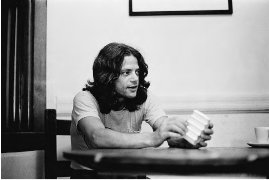
Figure 0.7. Harry Roseman, Scott Burton , 4 August 1973.

heteronormative masculinity and demanded a visible place for queer artists. This chapter begins with an analysis of Burton's 1973 Lecture on Self , in which he made himself an object of self-criticism by dividing his performance into two exaggerated and opposed characters through which he invited praise or scorn. I follow the subsequent history of one of these two, Modern American Artist (1973–75), with its caricature of the exaggerated masculinity that many straight Minimalist artists performed. I discuss how Burton engaged in debates about sex, gender, self-promotion, and artistic identity (in direct competition with artists such as Benglis and Morris) through this character. I also explain how Burton advocated for other artists, recounting the story of Burton's work on an unrealized anthology of lesbian and gay art history. These projects were soon followed by a truculent work about fisting that he dedicated to "homosexual liberation." Such activities ran alongside the layered and cerebral performance works he created for museums and galleries, leaving little doubt that the latter were, too, queerer than they first appeared.