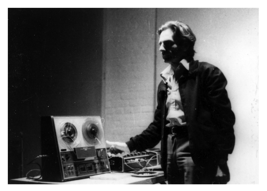
FIGURE 1. Henri Chopin at the International Festival of Sound Poetry, Toronto, 1978.