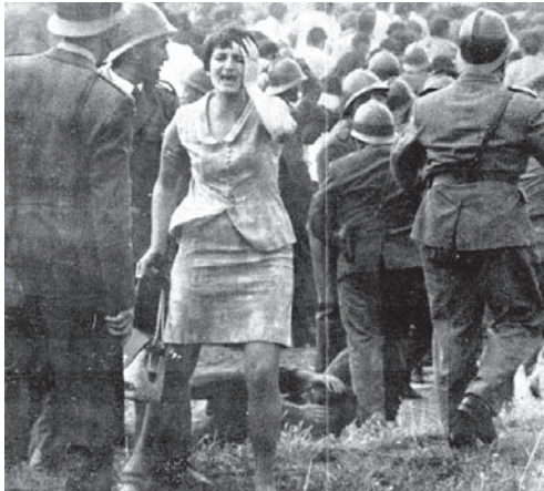
Belgrade, June 1968