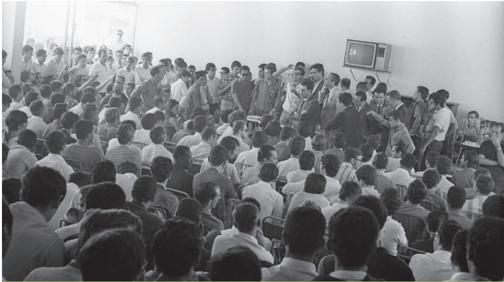
Strike in Minas Gerais (1968) - Metalworkers Union