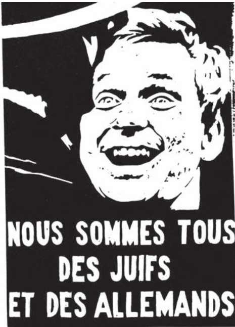
“We are all Jews and Germans” Popular chant among French students to demonstrate solidarity with Daniel Cohn-Bendit.

we have observed similar attempts to make 1968 responsible for all of society's troubles. For example, if today there is no respect, no authority, if school doesn't work, if individualism and selfishness is growing, it is the post-1968 ideology that should be blamed. It is fascinating to observe how the bourgeoisie and the descendants of the world we fought against have a huge need for revenge, even today, as if they had never accepted the fact that their power had started to collapse then. Paradoxically, someone like Sarkozy has a real fascination for 1968 and his behaviour truly follows the style of 1968. When he steps up onto the stage, when he puts on his show of 'boundless pleasure and orgasms', he does what we called in Germany thirty years ago, politics in the first person singular. In other words, he does not act in the name of the revolution, but in his own name. At that time we said that everything was political and Sarkozy even makes politics out of his private life. His 'rupture', supposedly symbolising a will to modernize French society, is driven by a form of self-determination that says: if you want something, you can get it. In other words, if you want more purchasing power, you can get it. His problem is that it is not working. Everyone knows that. That is