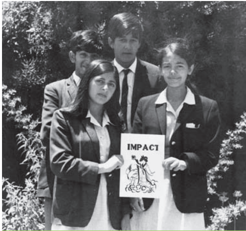
Students of Livingstone High School, Cape Town, with a copy of their 'Impact' magazine of February 1969 which celebrated the 1968 rebellion. The author, aged 17, is on the right at the rear.