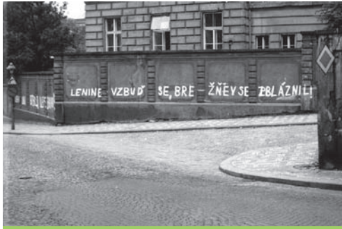
“Wake up Lenin, Brezhnev has gone crazy!” Prague, 1968