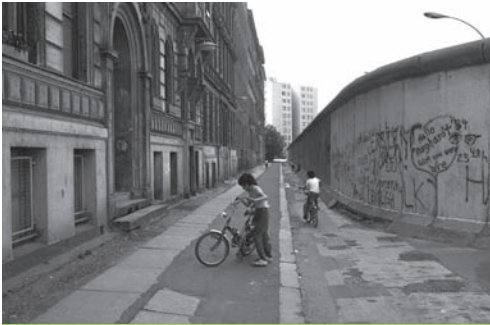
Berlin Wall, June 1965. Pavement and street are on East German territory – the houses are on West German territory.