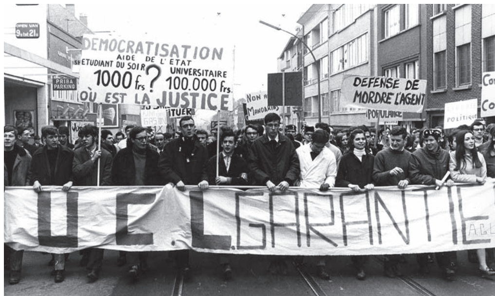
Francoophone students at Louvain University demonstrate for a more democratic education system and proper financial support for the transfer of the university to Wallonia, 20 March 1969.