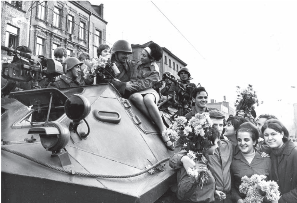
Soldiers returning from deployment in Prague are welcomed in Halle/Saale, 28 October 1968