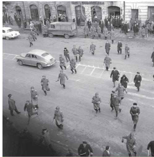
Streets of Warsaw, 1968

Today, I believe, we all know that a single surge of effort is not enough to change the course of history towards a better future. The reality is different. A plethora of forces and self-interests continuously clash and values are never safe. They must be guarded, sustained and protected.