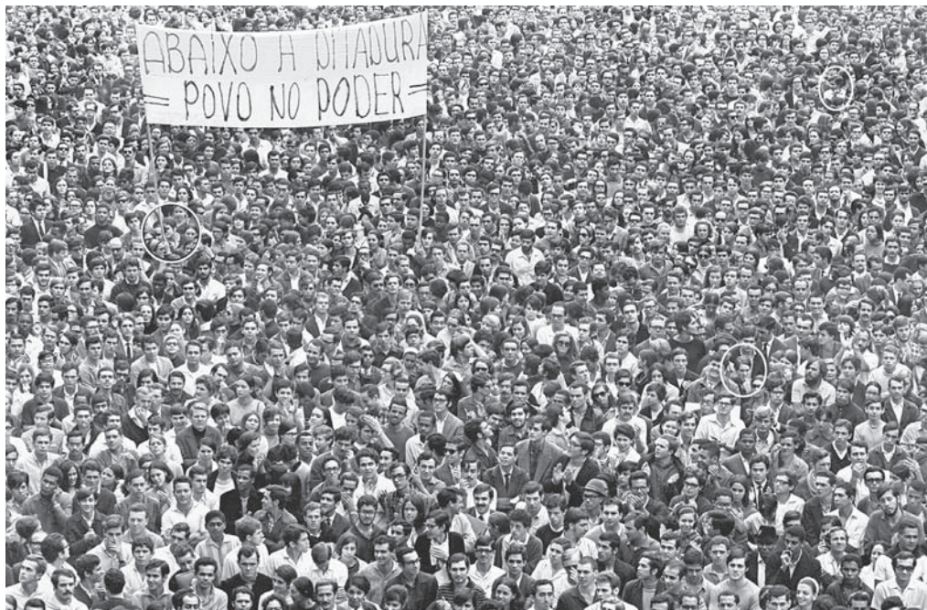
The One-Hundred-Thousand March on 26 June 1968 (Reason for circles in the original picture are unknown)