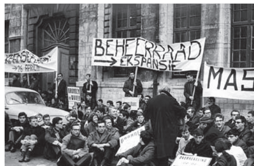
Flemish student support for the separation of the catholic university began early. Demonstration, 1 February 1967

Thus, the Flemish '68 is the only student movement that forced a government to resign. But the victory was ambiguous as was the slogan 'Walloons go home' which mixed the anti-imperialist claims of the movement against the Vietnam War with the claims of the nationalist struggle against the Walloons, who were often confused with the French-speaking bourgeoisie of Flanders. Of course, the SVB changed its slogan to 'bourgeois go home' but it was incapable of avoiding its use by the nationalist movement, even though the movement feared the leftists and workers as well as the claims for the democratisation of access to higher education. At that time, the SVB increased its presence at the gates of factories on strike (for instance at the Limburg mines, which were being closed). A few years later, some of its leaders founded a Maoist party – All Power to the Workers – which became the Parti du Travail en Belgique (PTB – the Belgian Labour Party).