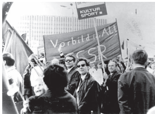
Demonstration of solidarity with the Czech opposition, May 1968 in Berlin. The two men carrying the banner “Role model Czech Republic” were arrested shortly after this picture was taken.

In its struggle for national identity and liberation from Russian rule, the Ukraine felt a special bond with the Czech and Slovak nations. In the 1920s many Ukrainian political exiles found a temporary home in Czechoslovakia under Tomáš G. Masaryk 1 , to the extent that Prague was dubbed the second capital of the Ukraine.