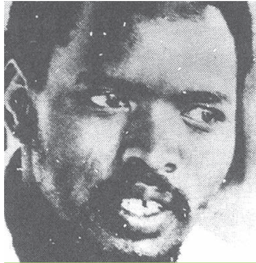
Steve Biko, Black Consciousness Student Leader, NewsCheck , December 1968

Such views were, of course, not the only perspectives on the significance of 1968. The few newspapers that had explicitly supported the black anti-apartheid struggle had, by then, mostly been banned or the police had constantly harassed their staff. Still, popular Johannesburg periodicals for African readers like Drum