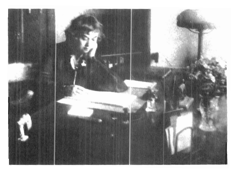
In her office in Stockholm, 1932