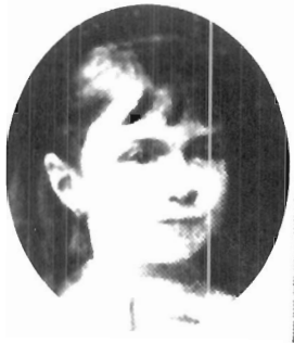
Alexandra Kollentai, aged 5