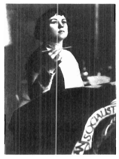
Speal ing at the 2nd International Conference of Communist Women, June 1921