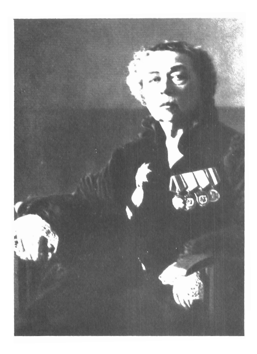
January 1952, two months before her death