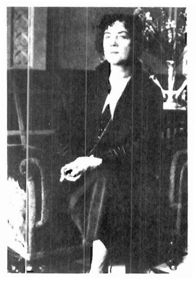
On a business trip to London, 1925