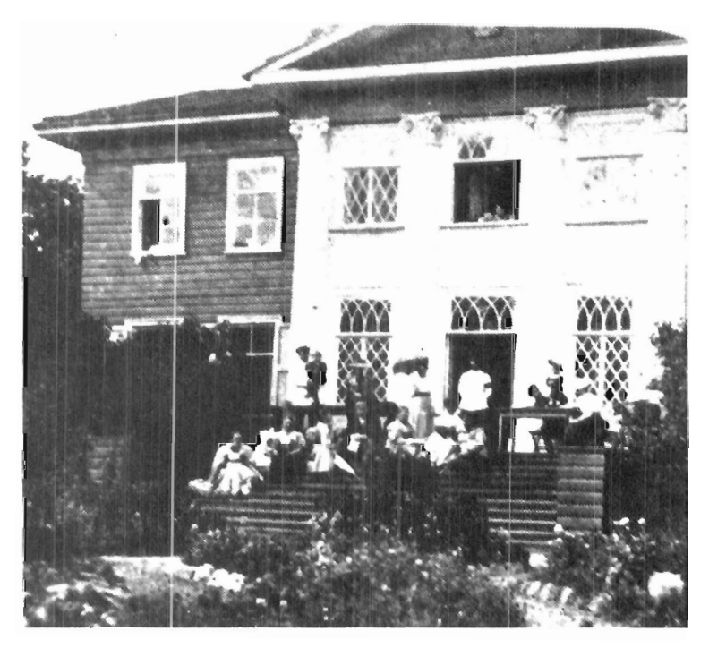
Family and friends at the Kuusa estate in Finland, 1895