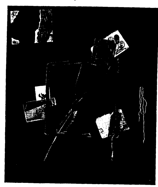
F1G. 2.2. John F. Peto, Old Time Letter Rack; 1894; oil on canvas; 30 \times 25 in. (76.2 \times 63.5 cm.); Manoogian Collection.

which have routinely adopted photography as a technique for producing images. This is because the technical processes involved in photography are articulated to our notion of human agency in a way which is quite distinct from that in which we conceptualize the technical processes of painting, carving, and so on. The alchemy involved in photography (in which packets of film are inserted into cameras, buttons are pressed, and pictures of Aunt Edna emerge in due course) are regarded as uncanny, but as uncanny processes of a natural rather than a human order, like the metamorphosis of caterpillars into butterflies. The photographer, a lowly button-presser, has no prestige, or not until the nature of his photographs is such as to make one start to have difficulties conceptualizing the processes which made them achievable with the familiar apparatus of photography.