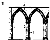
Hegel is referring here to the spandrels, i.e. to 4 in this illustration from O.I.D. s.v. Arcade .