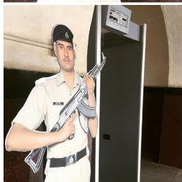
Cardboard security guard in Mysore, India.