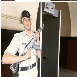
Cardboard security guard in Mysore, India.