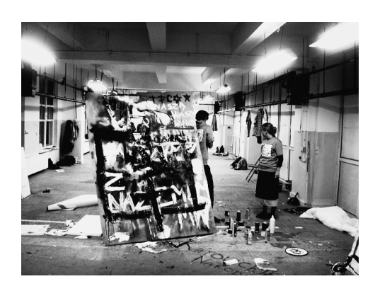
Artur Żmijewski. Them. 2007.