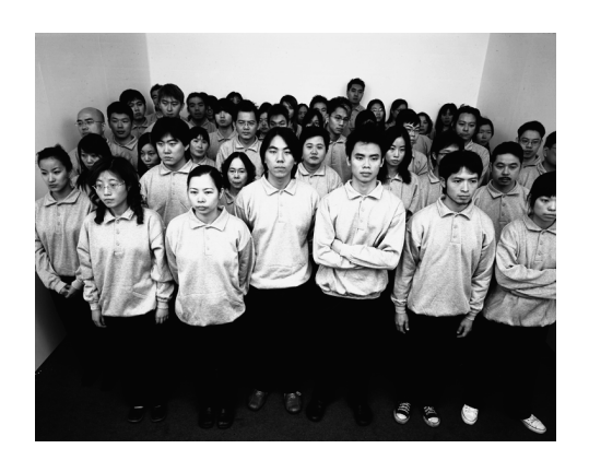
Paola Pivi. 100 Chinese. 1998–2005.

rumor have become two of the most hype.26 effective forms of Performance excites media attention, which in turn heightens the symbolic capital of the event—as seen in numerous covers of The Guardian's annual supplement to accompany the Frieze Art Fair, but also the recent controversy around Marina Abramović's "human table decorations" for the LA MOCA gala: eighty-five performers were paid $150 to kneel on a rotating "Lazy Susan" beneath the tables, with their heads protruding above, staring into the eyes of diners who had