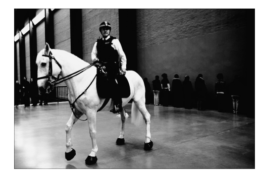
Installation view of La Monnaie Vivante at the Tate Modern. 2007. Photographs by Sheila Burnett.

and Franck Apertet) and Prinz Gholam. Curatorially, La Monnaie Vivante is distinctive in presenting performances as overlapping in a single space and time (a combination of exhibition and festival); this format forges an intense and continually shifting proximity between the different performances, as well as between performers and viewers, who occupy the same space as the works and move among them. At Tate Modern in 2008, for example, performances of varying duration took place on the Turbine Hall bridge, ranging from a six-hour live installation by Sanja Iveković (Delivering Facts, Producing Tears, 1998–2007) to fleeting instruction pieces by Lawrence Weiner (shooting a rifle at a wall, emptying a cup of sea water onto the floor). This led to some sublime juxtapositions, such as Santiago Sierra's Eight People Facing a Wall (2002) as the backdrop to Tania Bruguera's Tatlin's Whisper #5, which in turn circled around six dancers holding poses, and salivating onto the floor, choreographed by Vigier and Apertet.