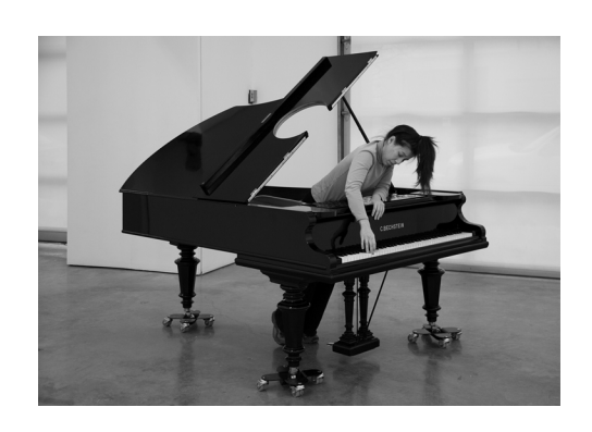
Allora and Calzadilla. Stop, Repair, Prepare. 2008.

think of Allora and Calzadilla hiring opera singers (Sediments, Sentiments, Figures of Speech, 2007) or pianists (Stop, Repair, Prepare, 2008); of Tania Bruguera hiring mounted policemen to demonstrate crowd-control techniques (in Tatlin's Whisper #5 , 2008); or of Tino Sehgal hiring university professors and students for his numerous speech-based situations (This Objective of That Object, 2004; This Progress, 2006).8 These performers tend to be specialists in fields other than those of art or performance, and since they tend to be recruited on the basis of their profes-