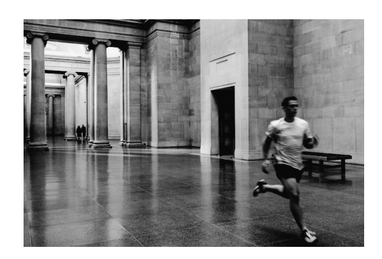
Martin Creed, Work No. 850, 2008.

eage in contemporary choreography such as Jerôme Bel's The Show Must Go On (2001), which makes use of everyday movements to literalize the lyrics of pop songs. Several of these strands come together, albeit in a more professionalized